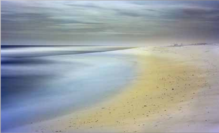
1st Place - Chuck Gallegos "Golden Sands"