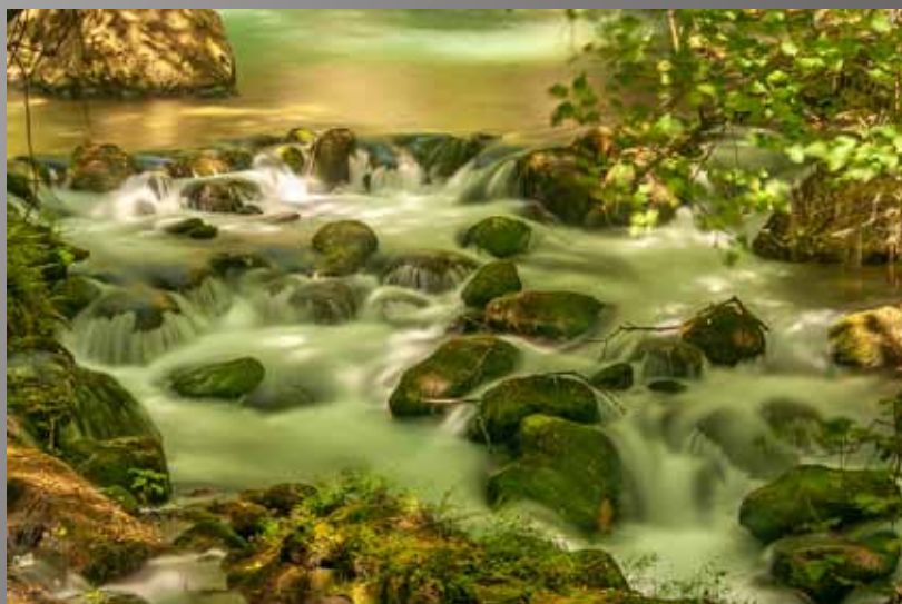
HM - Greg Hockel "Oasis"