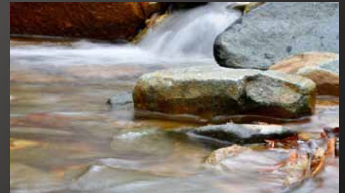
HM - Janet Payton "Water"