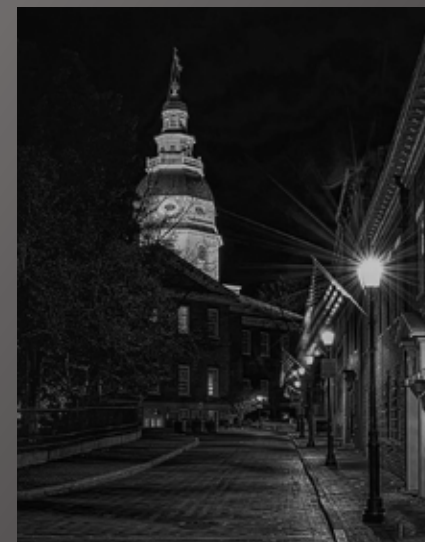
HM - Fred Venecia "School Street"