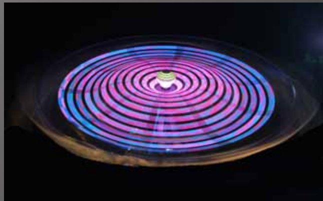
HM - Ed Niehenke "Flying Saucer"