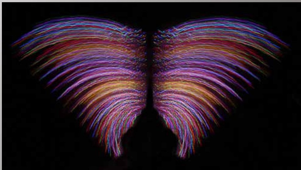
HM - Bob Webber "Light Wings"