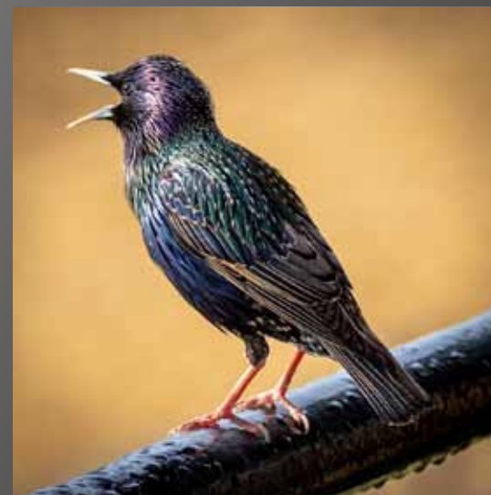
HM - Paul Wilcox "Starling"