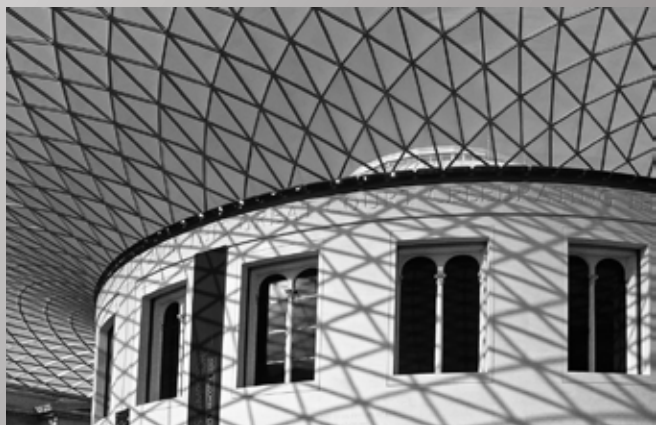
1st Place - Rich Stolarski "Curved Grid"