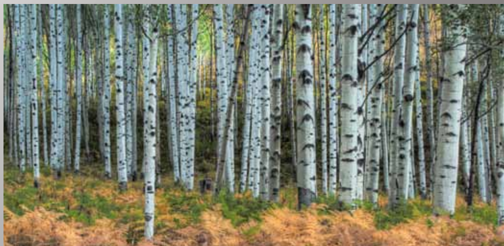
1st Place - Rich Stolarski "Aspens"