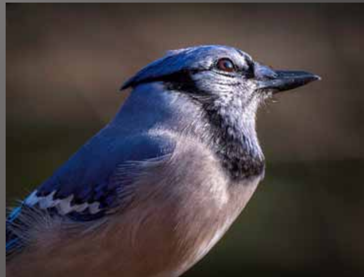
HM - Louis Sapienza "Blue Jay Looking"