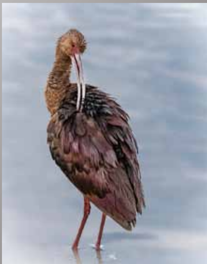
HM - Cathy Hockel "Glossy Ibis in Breeding Plumage"