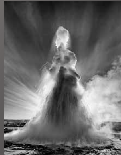
HM - Chuck Gallegos "Eruption"