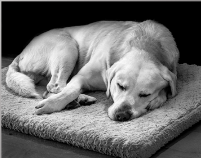
HM - Marilou Burleson "Too Much Playing"