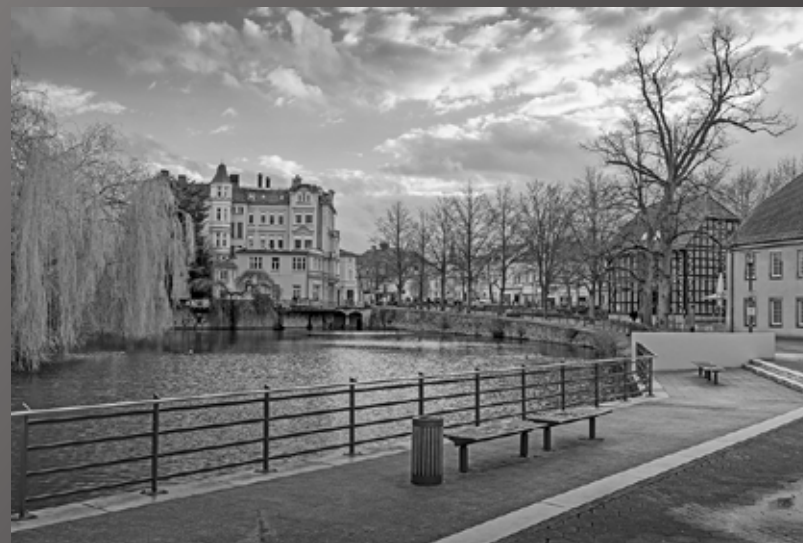
2nd Place - Fred Venecia "Detmold"