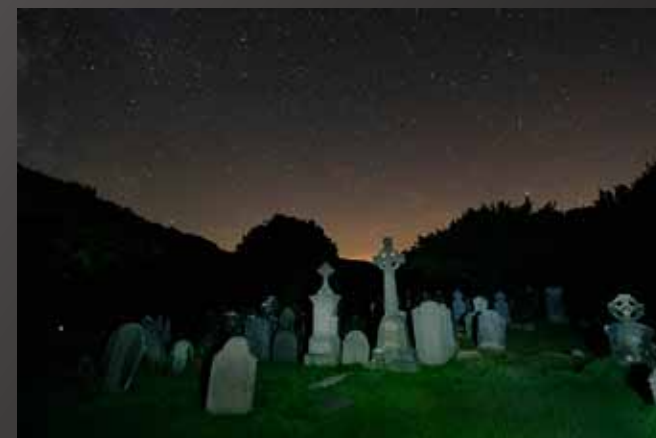
HM - Chuck Gallegos "In the Dead of Night"