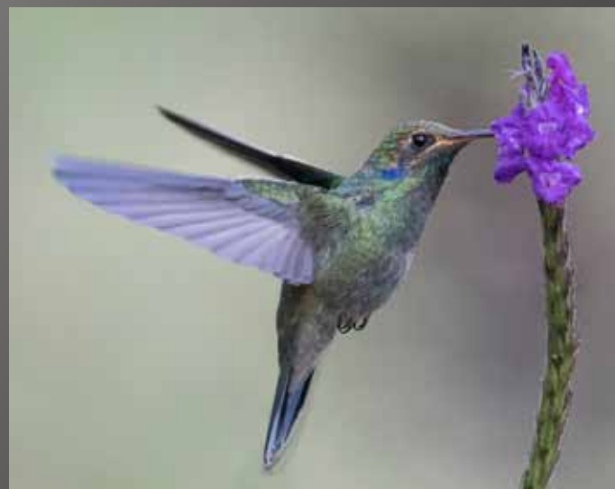
2nd Place - Cathy Hockel "Green Violet Eater Hummingbird"