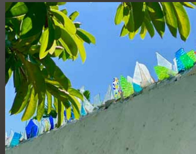
HM - Terri Jackson "Tropical Security"