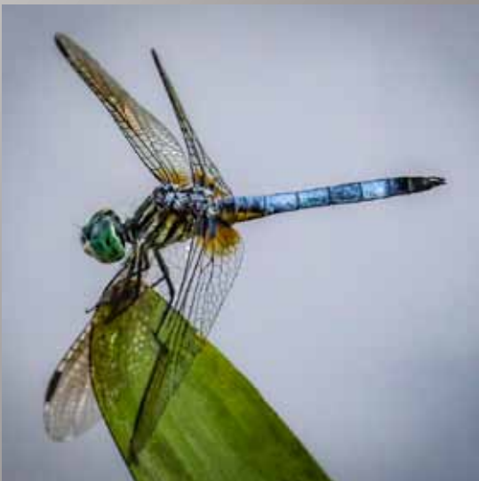
1st Place - Ron Pieffer "Blue Dasher "