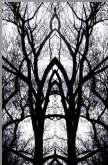
HM - Louis Sapienza "Cathedral In woods"