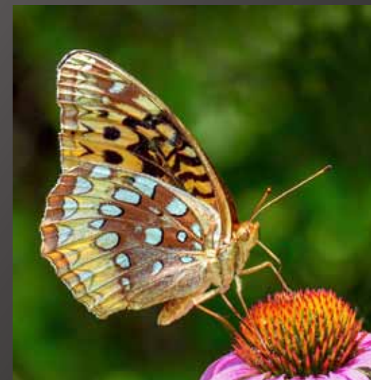
HM - JC Williams "Butterfly on Coneflower"