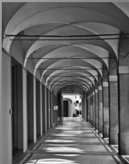
4th Place - Rich Stolarski "Bologna Arches"