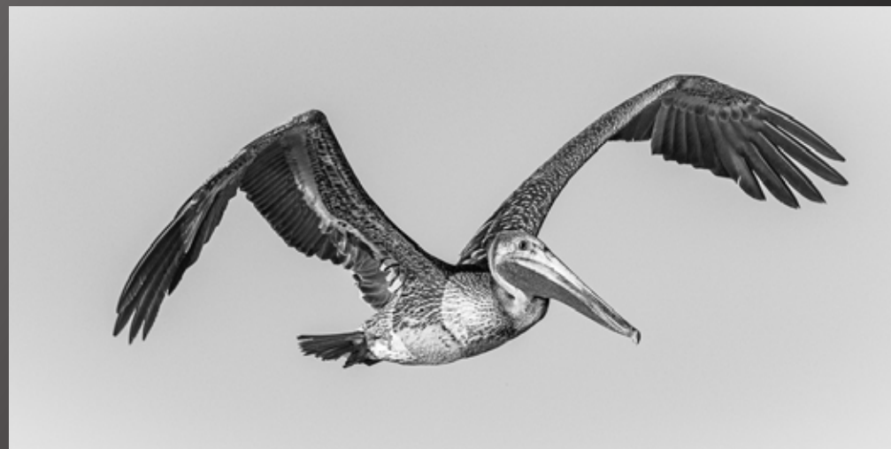
HM - Cathy Hockel "Juvenile Pelican"