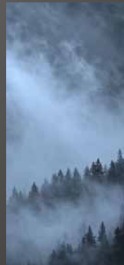
3rd Place - Rich Stolarski "Clouds"