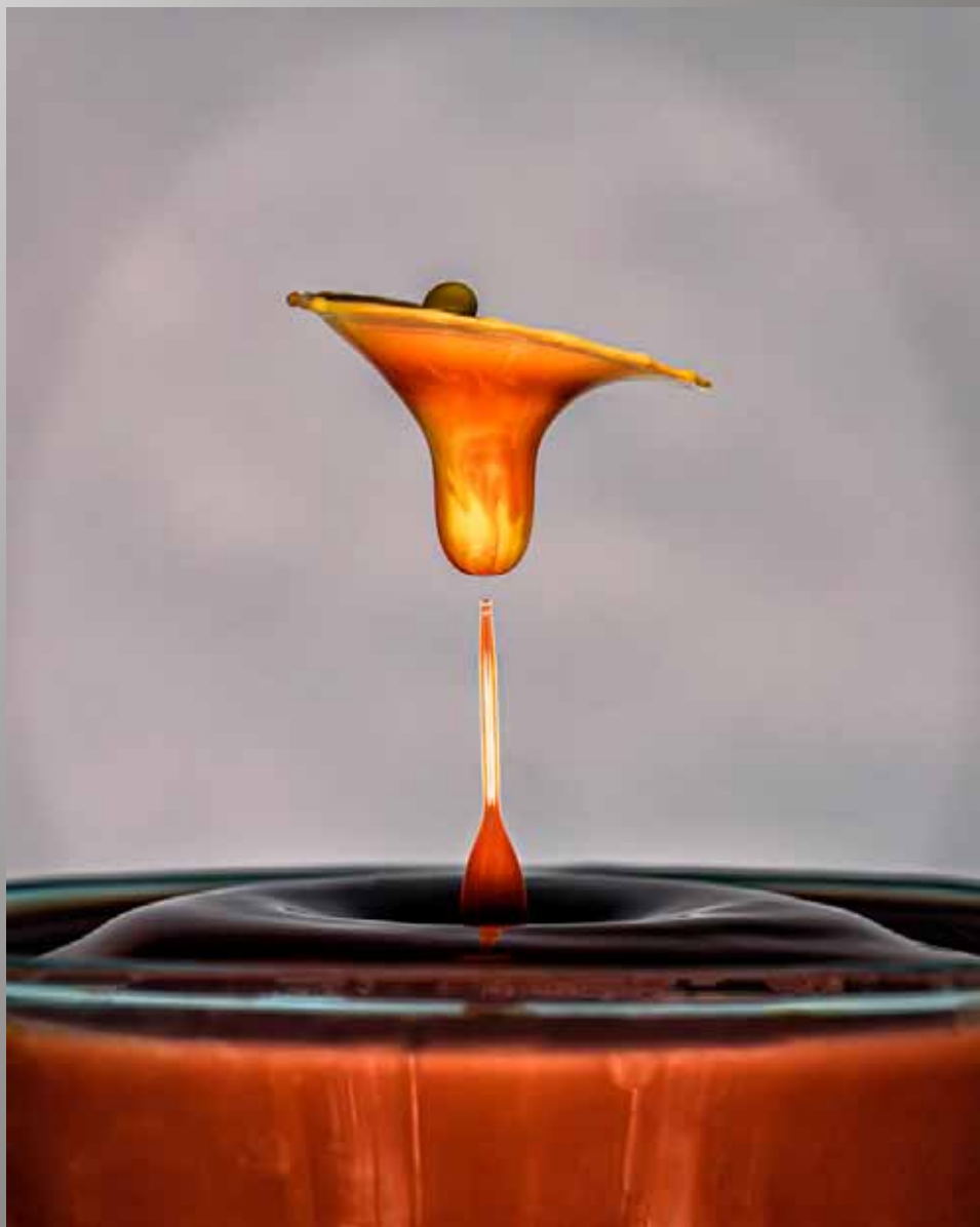
1st Place - JC Williams "Water Drop Flower"