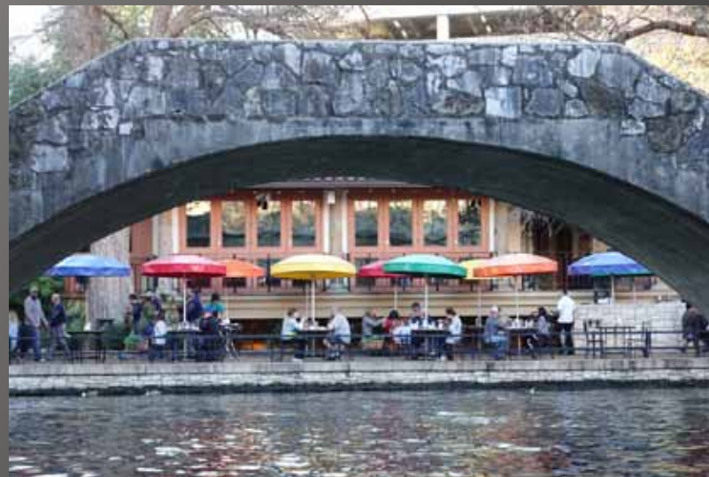
2nd Place - Ed Niehenke "San Antonio Dining"