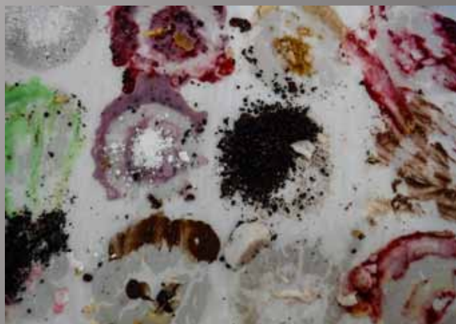
3rd Place - Delaney Peiffer "Aftermath"