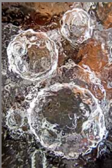
3rd Place - Chuck Gallegos "Ice Bubbles"