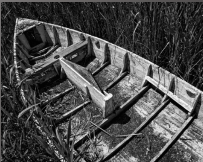
HM - Delaney Peiffer "Boat"