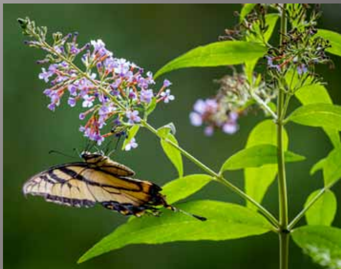
HM - Paul Wilcox "Butterfly"