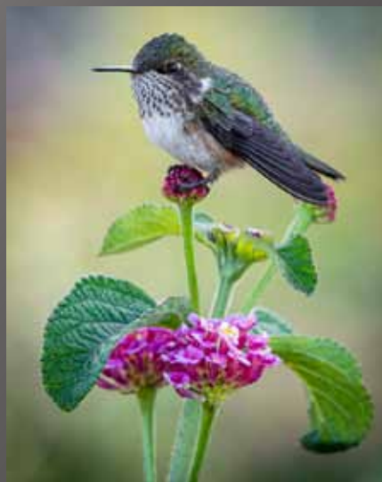
HM - Cathy Hockel "Female Ruby Throated Hummingbird"