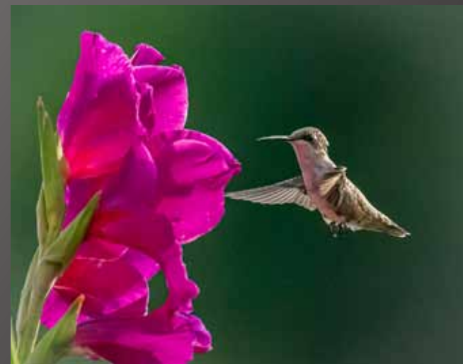
3rd Place - Cathy Hockel "Bon Appetit"