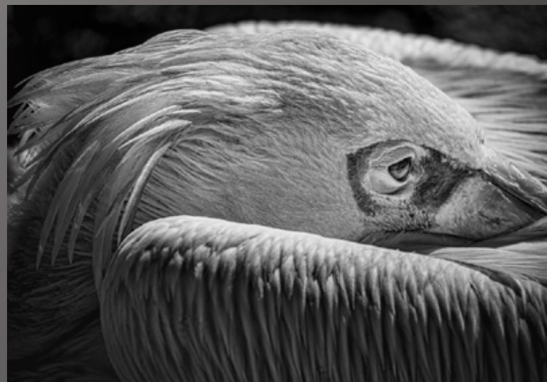
2nd Place - Ron Peiffer "Pelican Break"