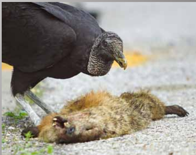
1st Place - Fred Venecia "Who You Looking At"