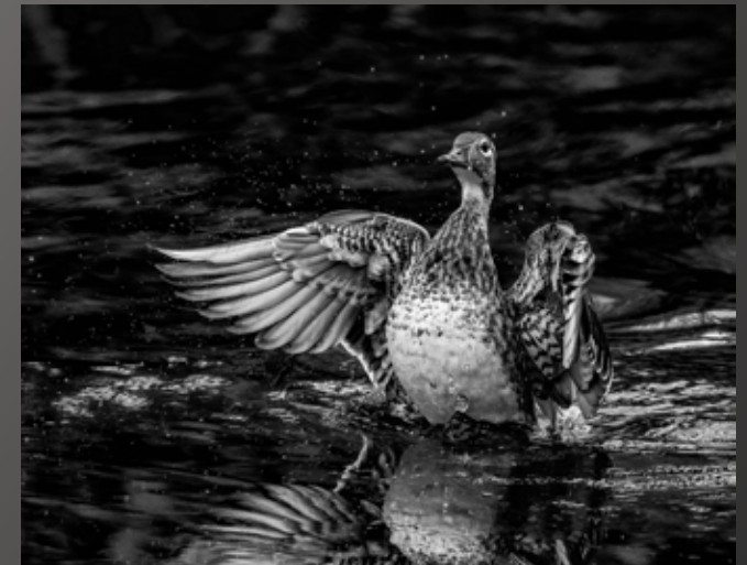
3rd Place - Mike Thomas "Female Wood Duck"