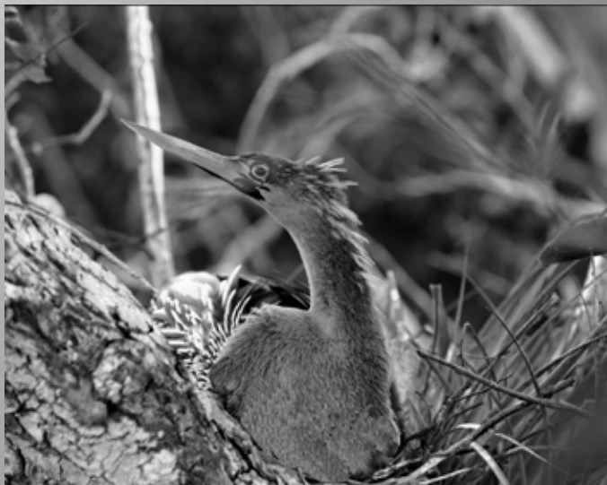
1st Place - Ed Niehenke "Bird In Nest"