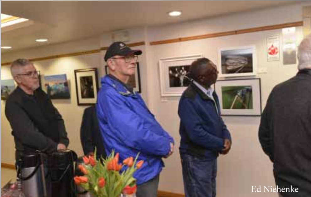
Exhibit Woods Church