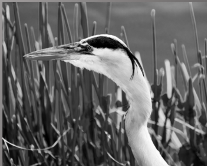
3rd Place - Ed Niehenke "Watchful Bird"