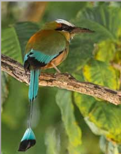
HM - Cathy Hockel "Turquoise Browed MotMot"