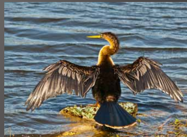
3rd Place - Rich Stolarski "Spread My Wings"