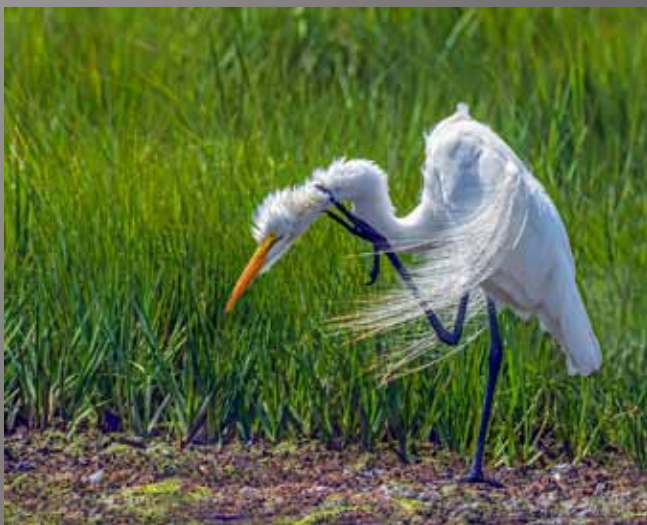
2nd Place - JC Williams "Scratching The Itch"