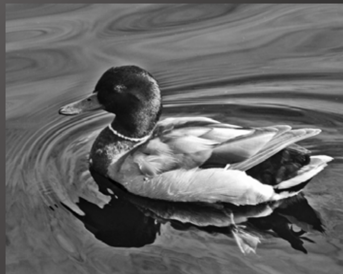
4th Place - Rich Stolarski "Ducky"