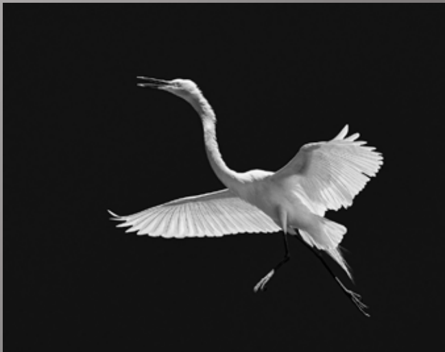
4th Place - Cathy Hockel "Dancing Snowy Egret"