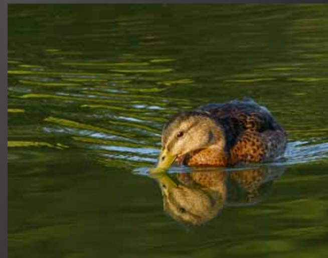
HM - Fred Venecia "Reflection"