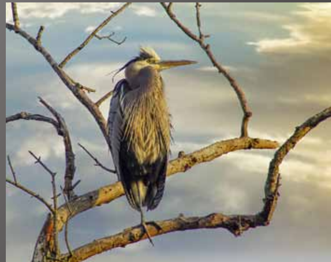
HM - Fred Venecia "Great Blue Heron"