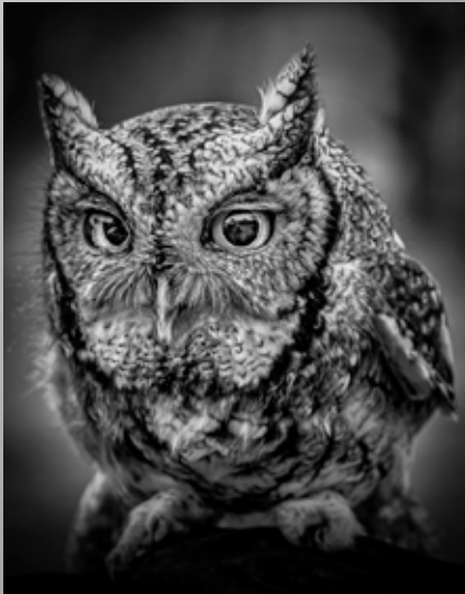
1st Place - Ron Peiffer "Little Owl"