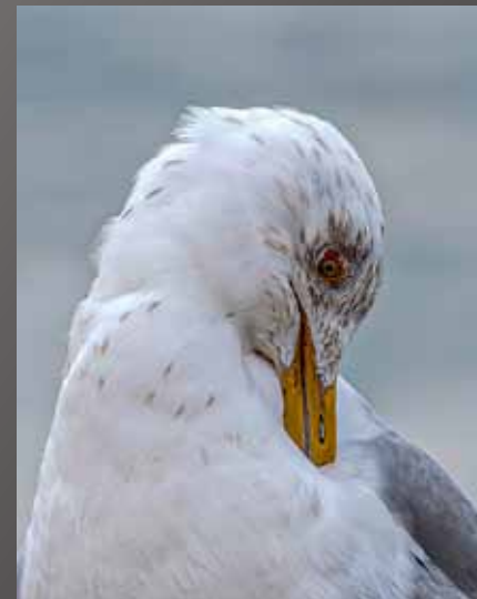
2nd Place - JC Williams "Ocean City Beauty"