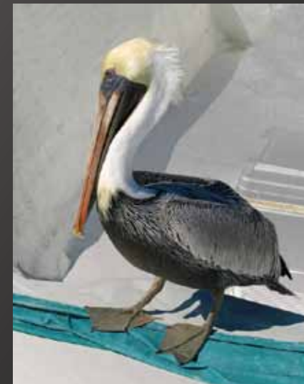
HM - Rich Stolarski "Pelican"