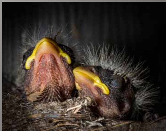
HM - Ron Peiffer "Two Brothers Napping"