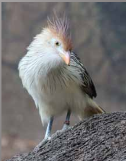
4th Place - Bob Webber "Bronx Zoo Bird"