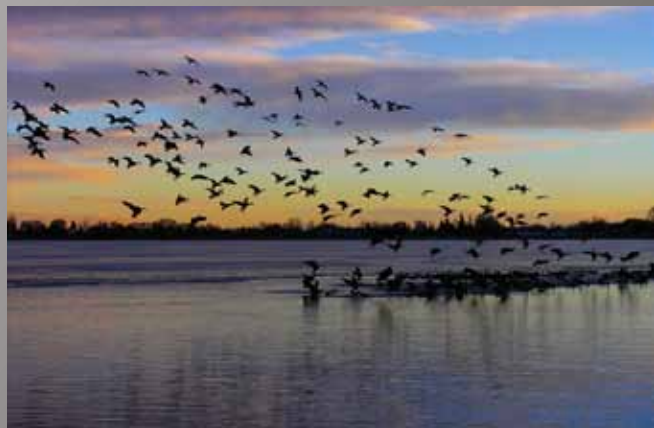
3rd Place - Rich Stolarski "Landing On The Ice"