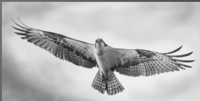
HM - Cathy Hockel "Here's Looking at You"