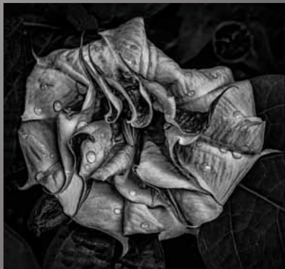
1st Place - Ron Peiffer "PUckered Up Posey"