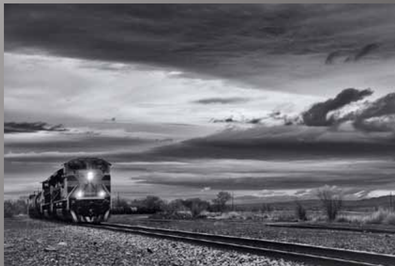
HM - Cathy Hockel "Coming Down the Track"