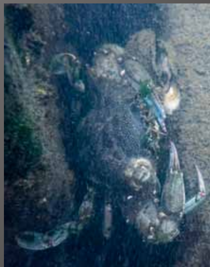
HM - Delaney Peiffer "Crab"