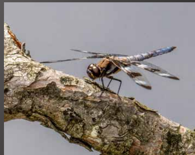
HM - Ron Peiffer "Dragonfly Five"