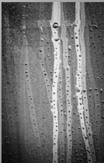
HM - Louis Sapienza "Condensation"