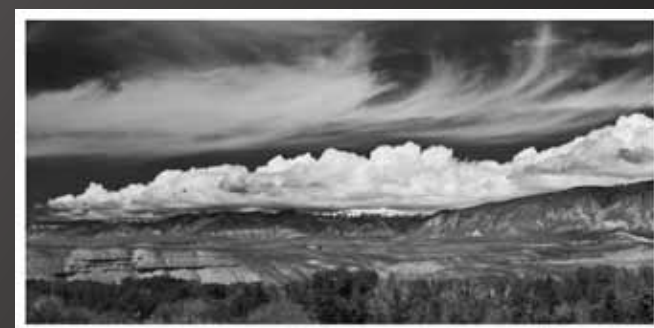
HM - Rich Stolarski "Wyoming Sky"