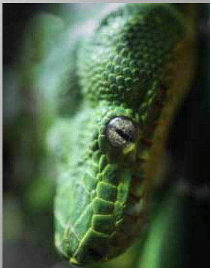
1st - Delaney Peiffer "Snake Eyes"