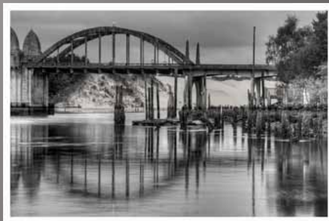
2nd Place - Rich Stolarski "Bridge Over Sliusau River"