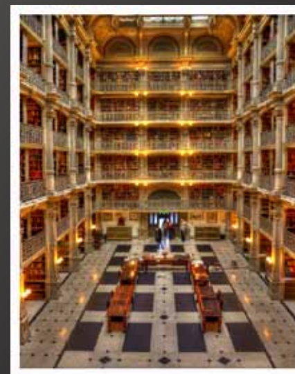
HM - Rich Stolarski "Peabody Library"