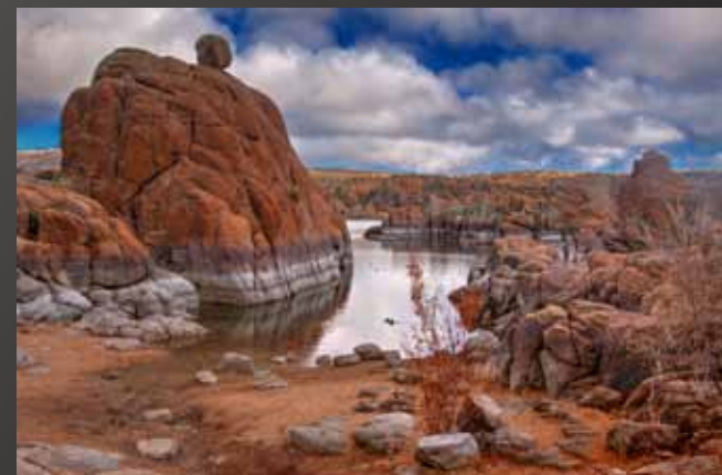
HM - Rich Stolarski "Balancing Act"