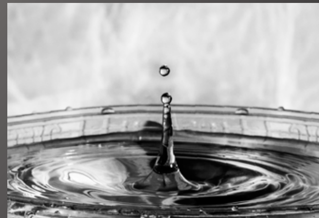
3rd - Marilou Burleson "A Single Drop"