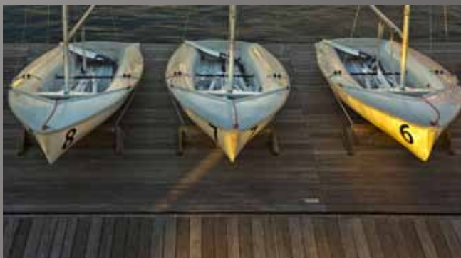
2nd - Rich Stolarski "Sailboats"