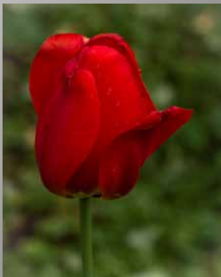
4th Place - Cathy Hockel "Morning Tulip"