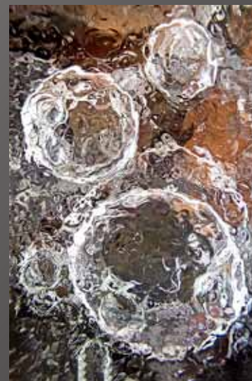
HM - Chuck Gallegos "Ice Bubbles"