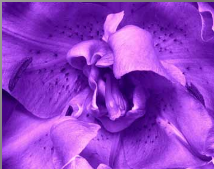
2nd Place - Bob Webber "Deranged Purple"