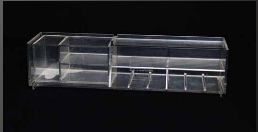
Pretty Neat Cosmetic Organizer You have to see it to truly appreciate it!