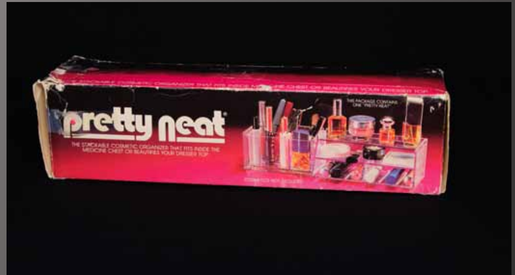
Pretty Neat Cosmetic Organizer in Original Box