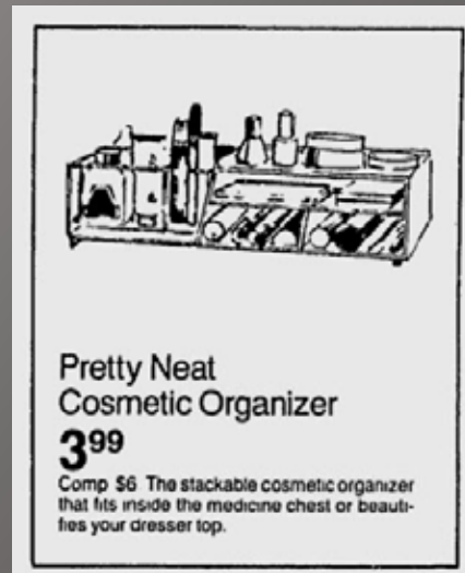
Pretty Neat Cosmetic Organizer Sold for $3.99 in 1983