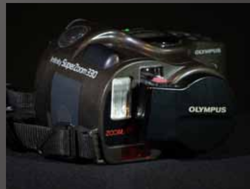
Olympus Infinity SuperZoom 330