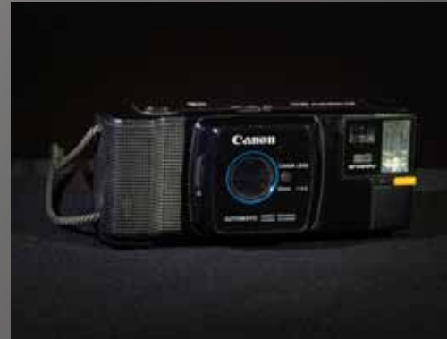
Canon Snappy 20