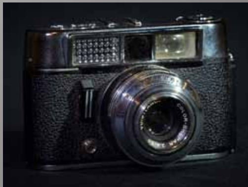
Voigtlander Vito CL