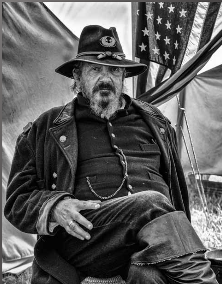
Unlimited Best of Show "The General" by Cathy Hockel