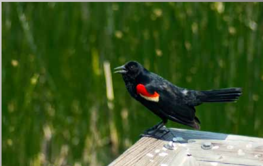
HM - Zoe Smith "Wingtips"