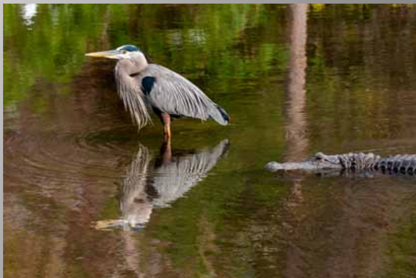
4th Place - Dawn Grannas "Clueless"