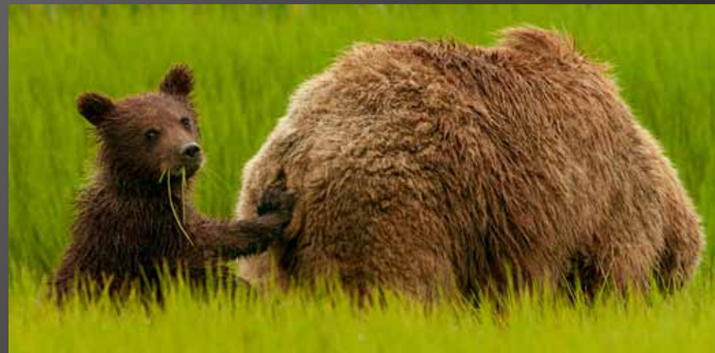
HM - Dick Chomitz "A Small Push"