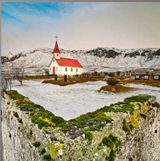
HM - Chuck Gallegos "Little Church on the Corner"