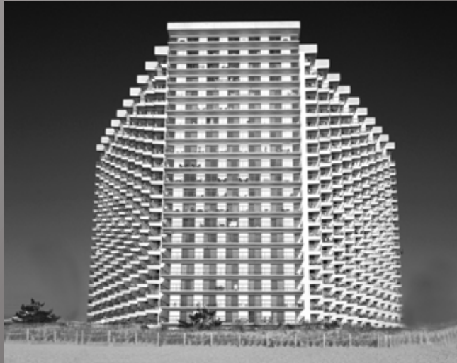
2nd Place - Ed Niehenke "Beach Outlook"