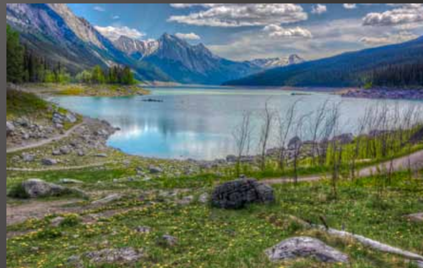
HM - Rich Stolarski "Medicine Lake"