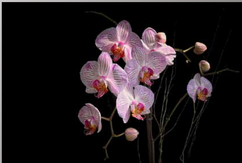
HM - Dick Chomitz "Red and White Orchid"