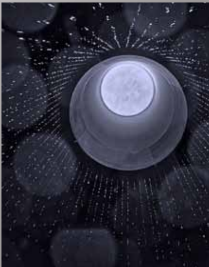
4th Place - Chuck Gallegos "The Grotto"