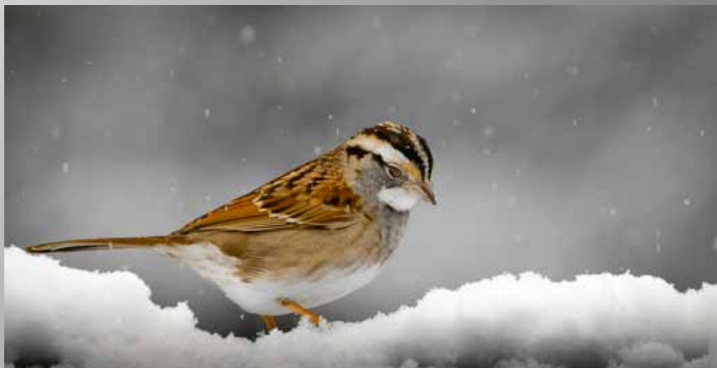
1st Place - Louis Sapienza "Looking for Food"