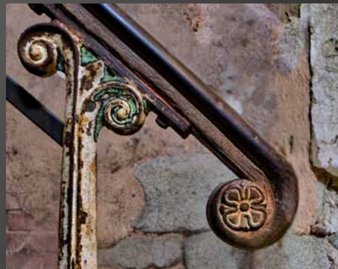
4th Place - Ron Peiffer "Functional Art"