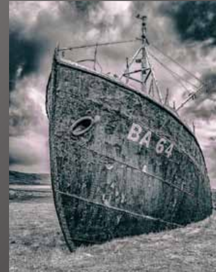
2nd Place - Greg Hockel "Run Aground"