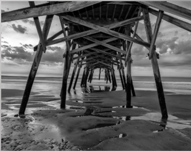
1st Place - Fred Venecia "Low Tide"