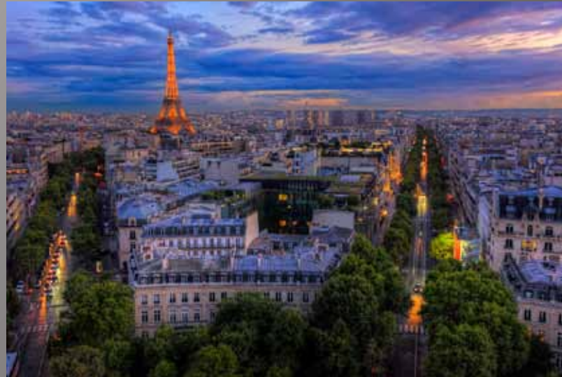
1st Place - Rich Stolarski "Eiffel Tower at Sunset"