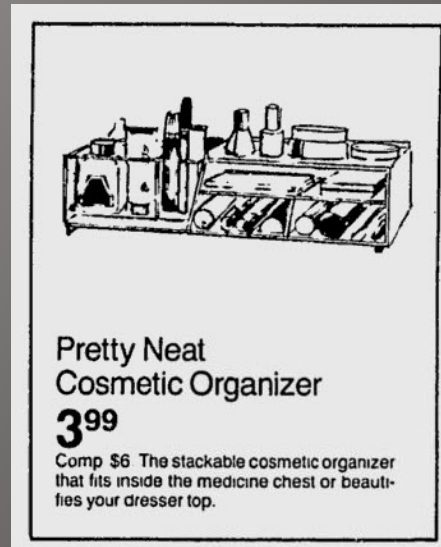
Pretty Neat Cosmetic Organizer Sold for $3.99 in 1983