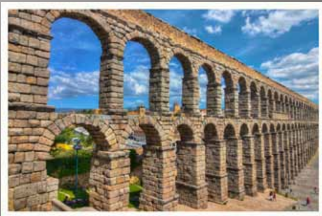
4th Place - Rich Stolarski "Segovia Aquaducto"