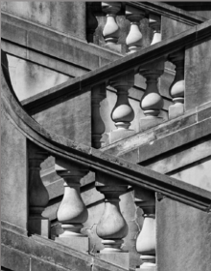
3rd Place - Ron Peiffer "Afternoon Light"