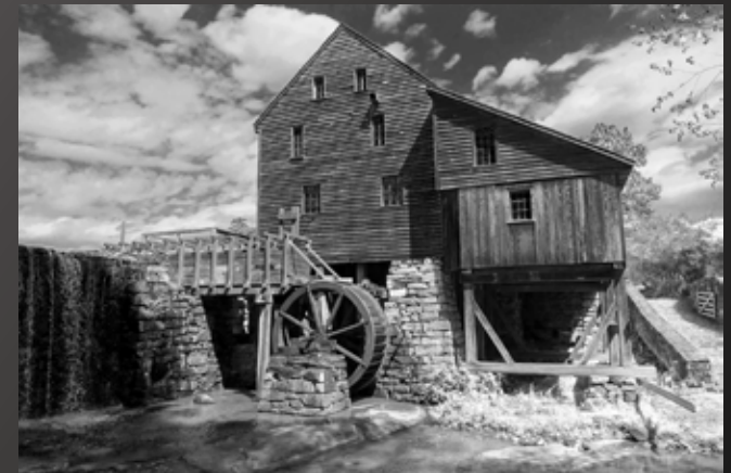
HM - Ed Niehenke "Old Mill"