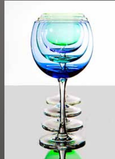
HM - Marilou Burleson "Trickle Down"