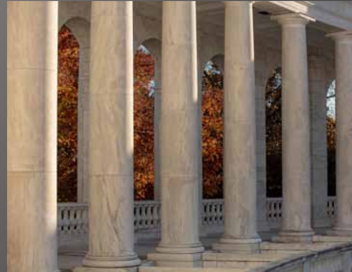
2nd Place - Michelle Barkdoll "Autumn Peaking Thru"