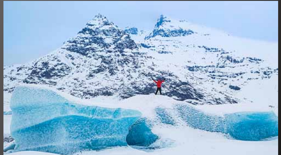
HM - Chuck Gallegos "Cool View"