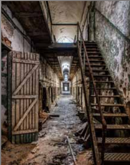
3rd Place - Ron Peiffer "Forgotten Cell Block"