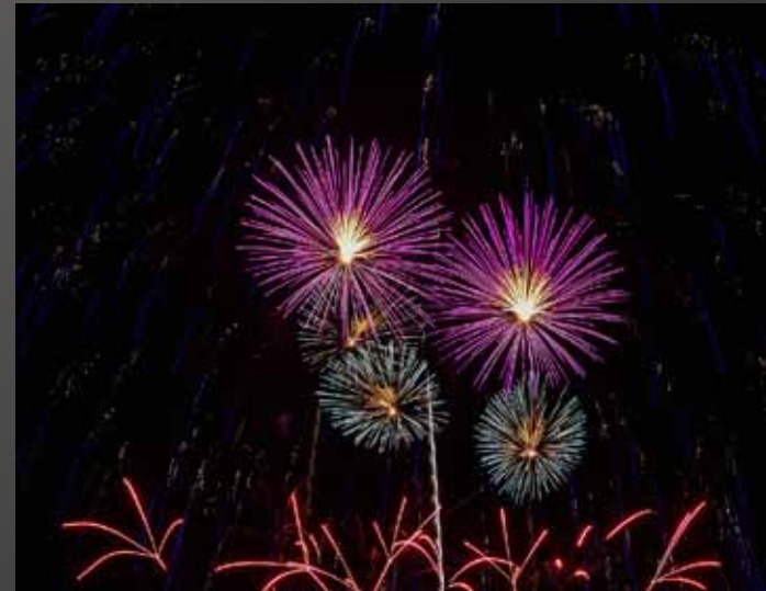
4th Place - Cathy Hockel "Fireworks Flowers"