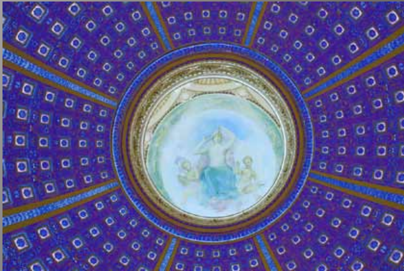
HM - Bob Webber "Under the Blue Dome"