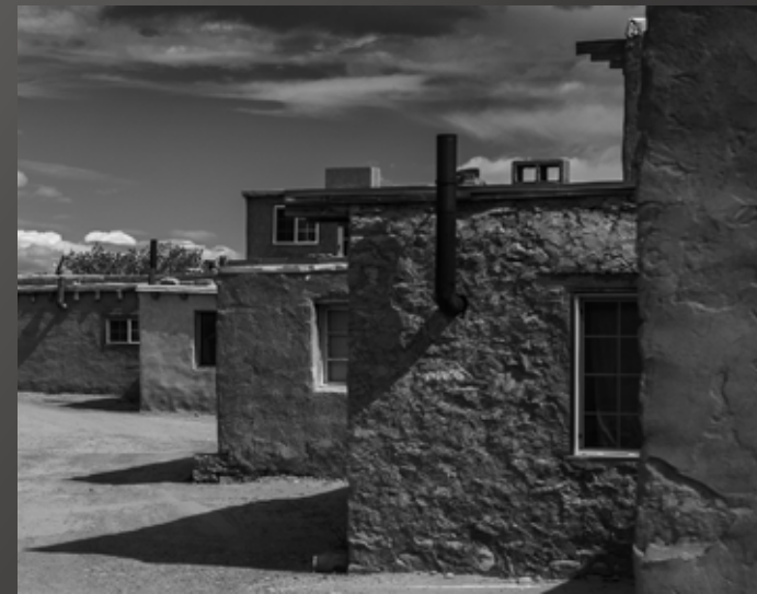
3rd Place - Greg Hockel "Acoma Pueblo"