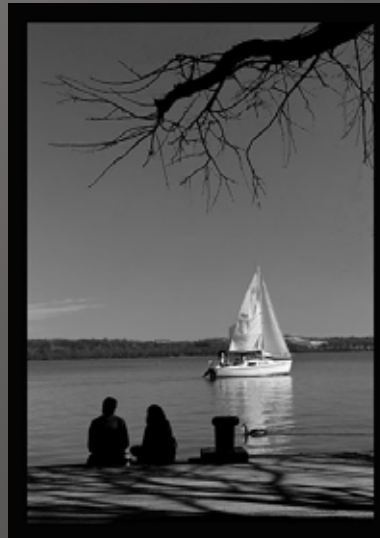
HM - Rich Stolarski "Watching Sailboats"