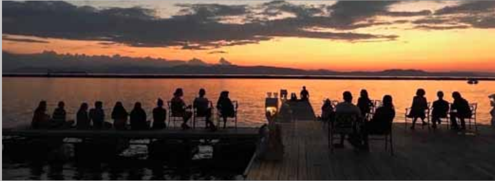
4th Place - Jim Mumper "Docktails"