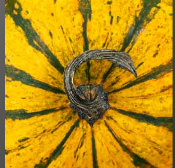
3rd Place - Marilou Burleson "Yellow and Green"