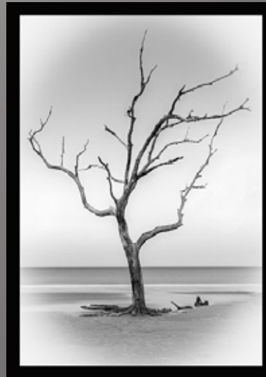
2nd Place - Rich Stolarski "Beach Tree"