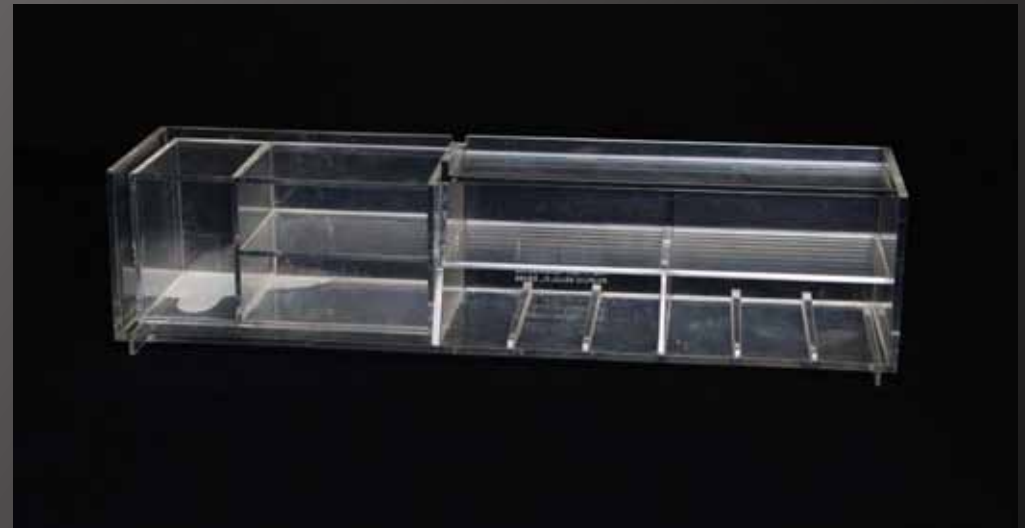
Pretty Neat Cosmetic Organizer You have to see it to truly appreciate it!