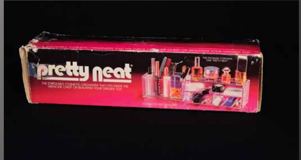
Pretty Neat Cosmetic Organizer in Original Box