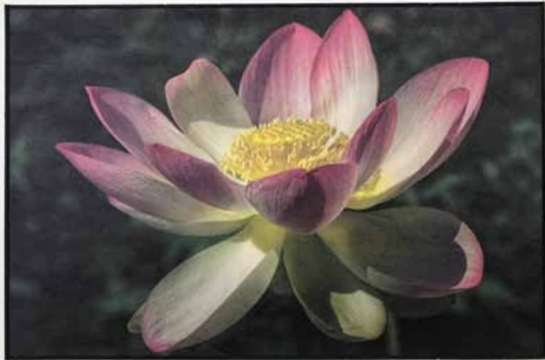
HM - Dick Chomitz "Lotus Flowering on Mulberry Paper"