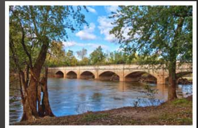
HM - Rich Stolarski "Monocacy Aquaduct"