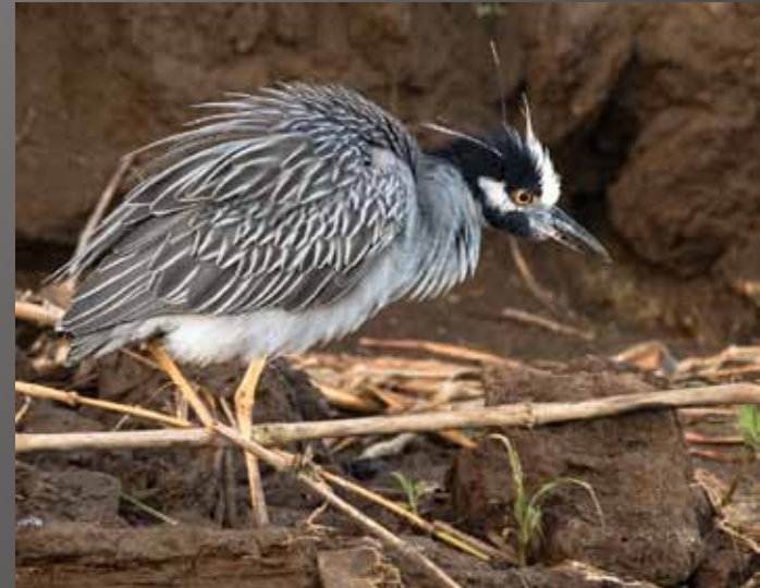
HM - Cathy Hockel "Heron"