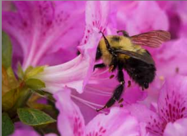
2nd Place - Fred Venecia "Working Bee"