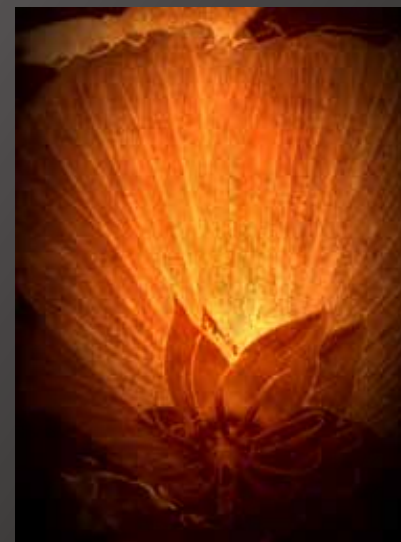
HM - Lou Sapienza "Glowing Petal"