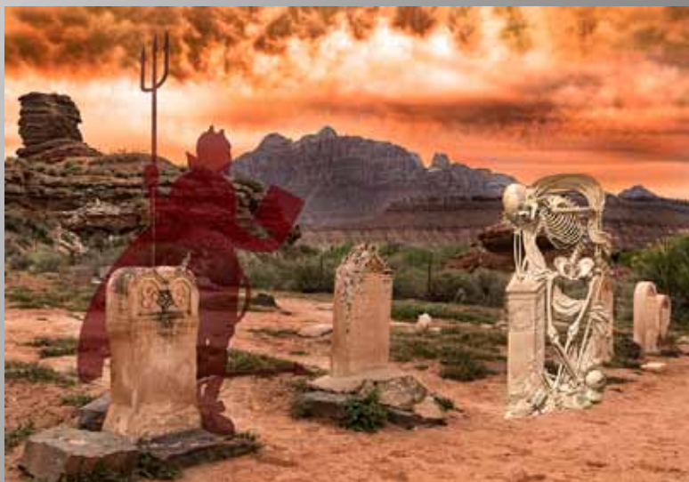
3rd Place - Chuck Gallegos "Judgment Day"