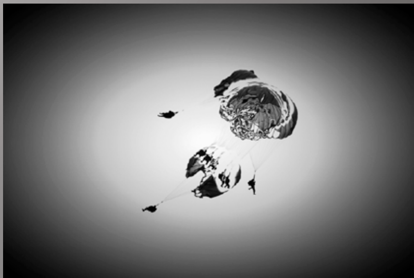
HM - Lou Sapienza "Parachute"