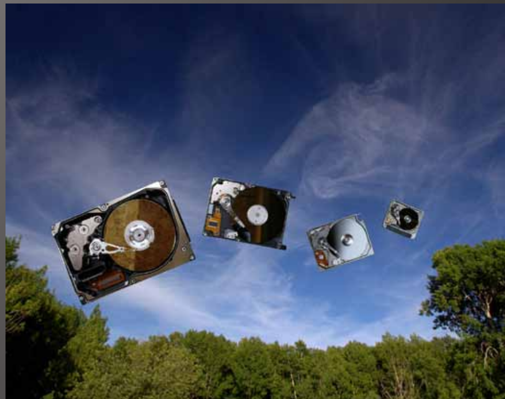
2nd Place - Bob Webber "Data in the Clouds"