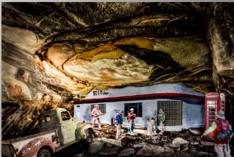
3rd Place - Ron Peiffer "The 50 and 6 Cave and Diner"