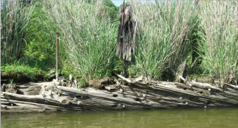
Mallows Bay Kayak Trip