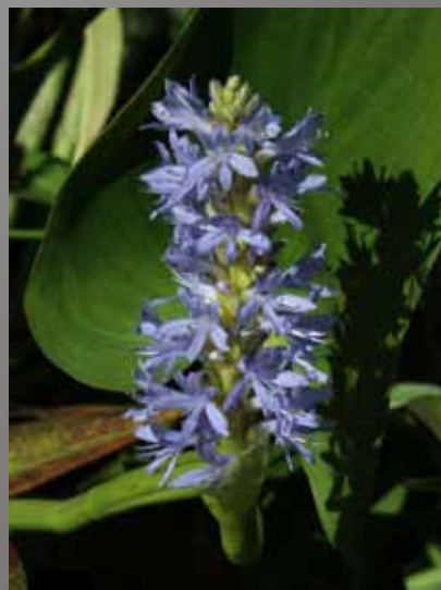
HM Susan Webber "Blue Flower"