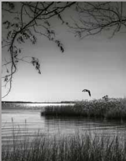
1st Place Cathaleen Ley “Dusk at Chesapeake Heritage Preserve”