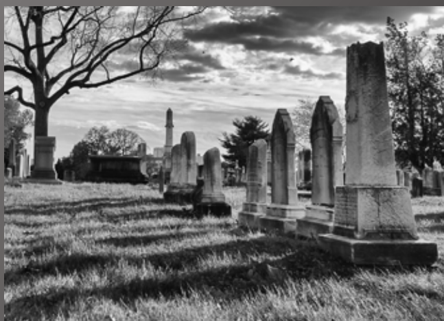
HM Greg Hockel "Greenmount Graveyard Shadows"