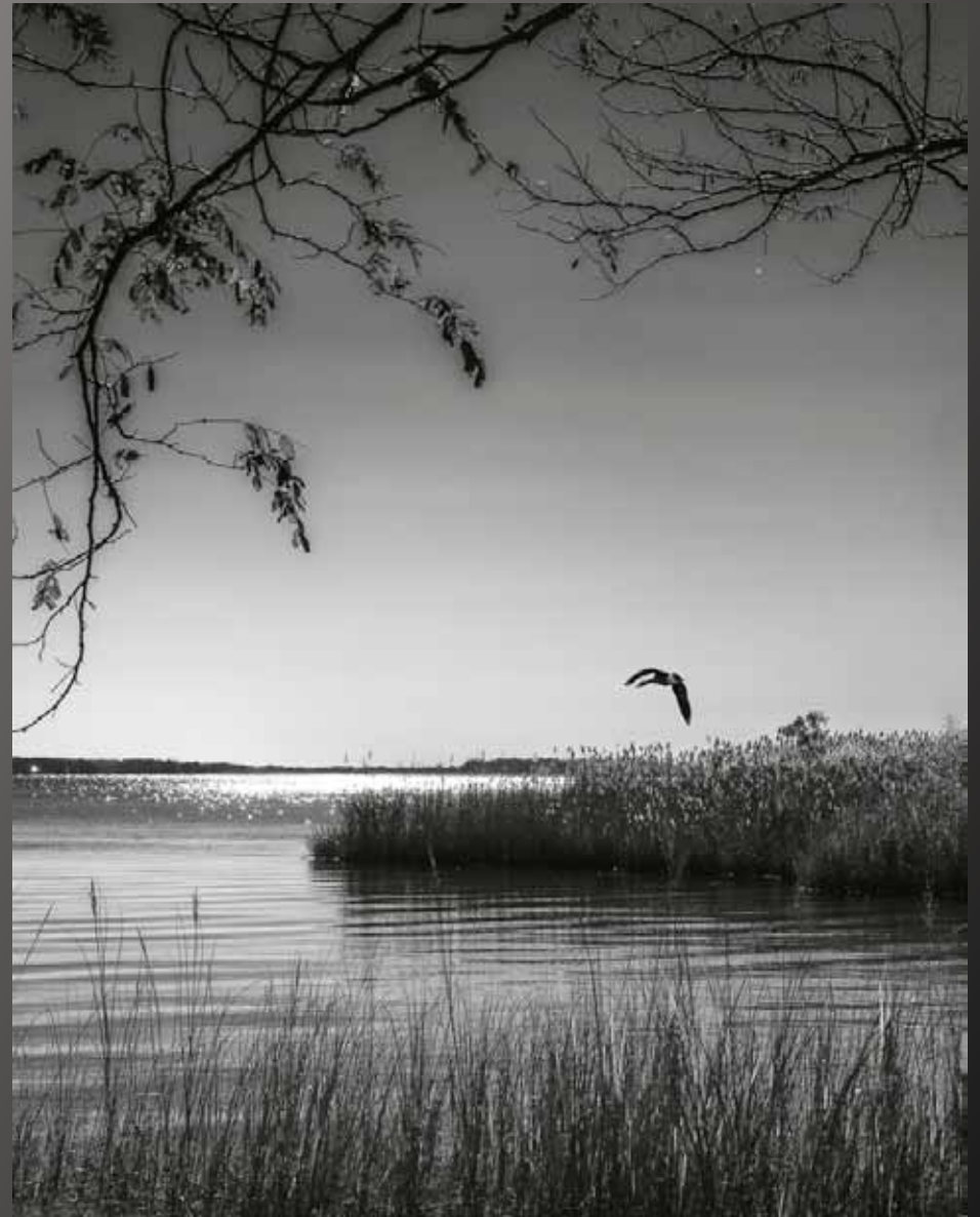
Best in Show - Novice Cathaleen Ley "Dusk at Chesapeake Heritage Preserve"