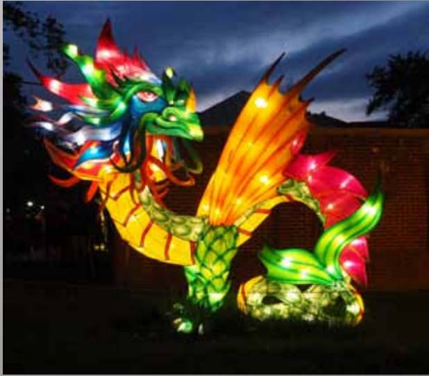
Chinese Lantern Festival