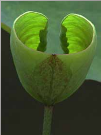
4th Place Bob Webber "Kenilworth Garden Curled Leaf"