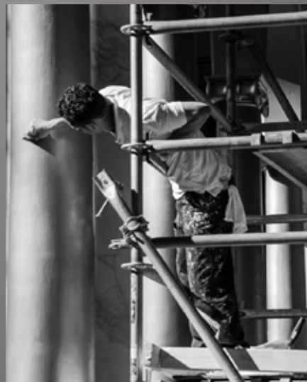
2nd Place Greg Hockel "Working at the National Building Museum"