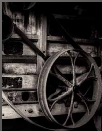
4th Place Ron Peiffer “Big Wheel”