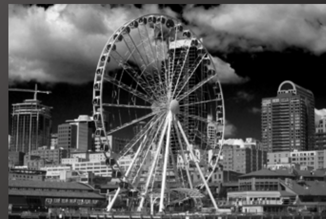
HM Ed Niehenke "Seattle's Great Wheel"