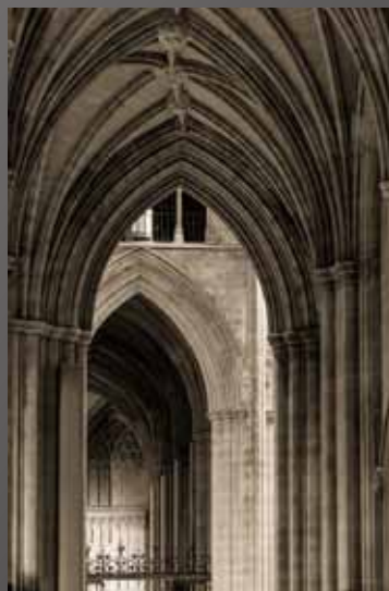
HM Ann Hickman "Cathedral Arches"