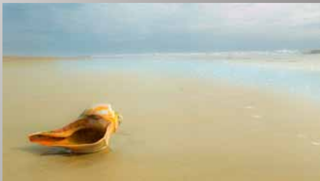
1st Place Chuck Gallegos "Solitary Beach"