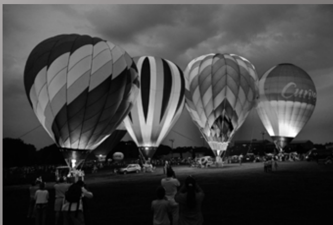
4th Place Ed Niehenke "Up Up and Away"