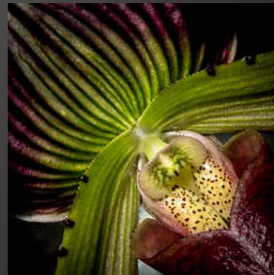
HM Ron Peiffer "Orchid"