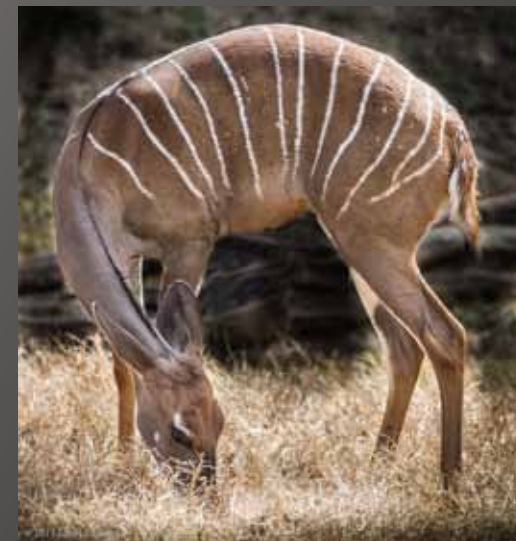
3rd Place Louis Sapienza "Gazelle"