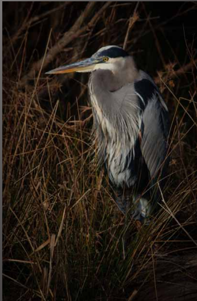
2nd Place Dawn Grannas "Blue Heron"