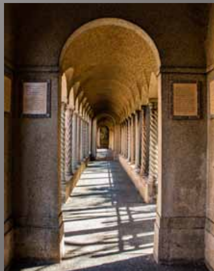
2nd Place Cathy Hockel "WalkWay"