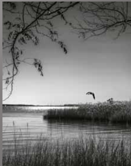
2nd Place Cathaleen Ley "Dusk at Chesapeake Heritage Preserve"