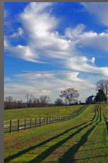
2nd Place Alert Kok "Virginia Landscape"