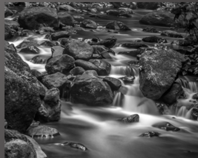
3rd Place Greg Hockel "at the Waterfall Park"