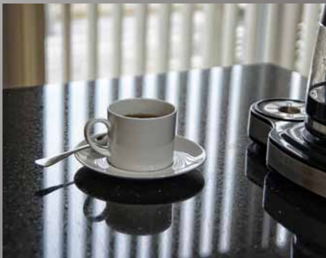
4th Place Fred Venecia "Morning"