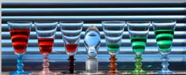
1st Place Sue Webber "Greenwich Glasses"