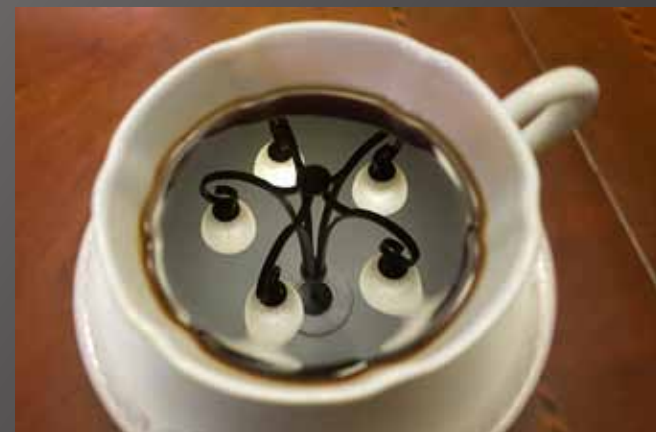
3rd Place Fred Venecia "Morning"