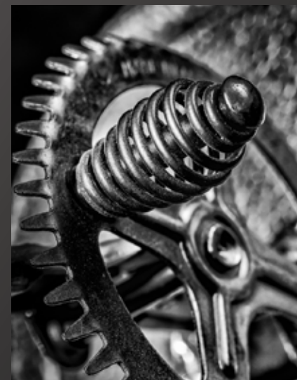
HM Ron Peiffer "The Mixer"