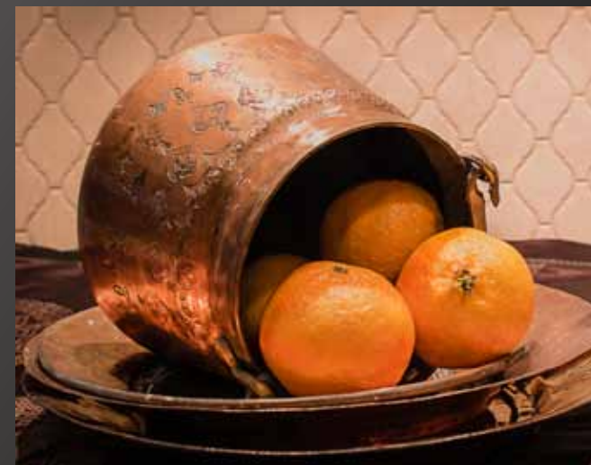
HM Place Cathaleen Ley "Turkish Kitchen"