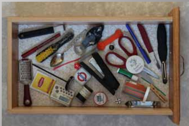
1st Place Sue Webber "Kitchen Gadget Draw"