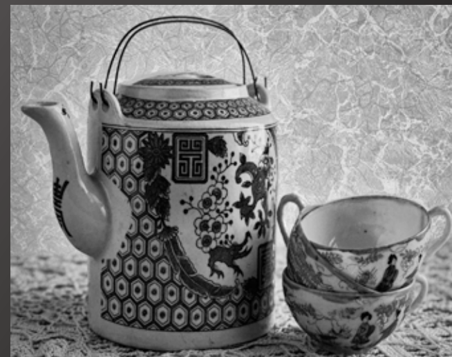
HM Place Cathaleen Ley "Japanese Kitchen"