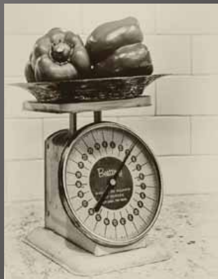
4th Place Cathaleen Ley "50's Kitchen Scales"