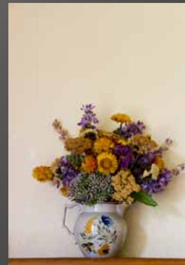
3rd Place Jackie Colestock "Flowers for the Table"