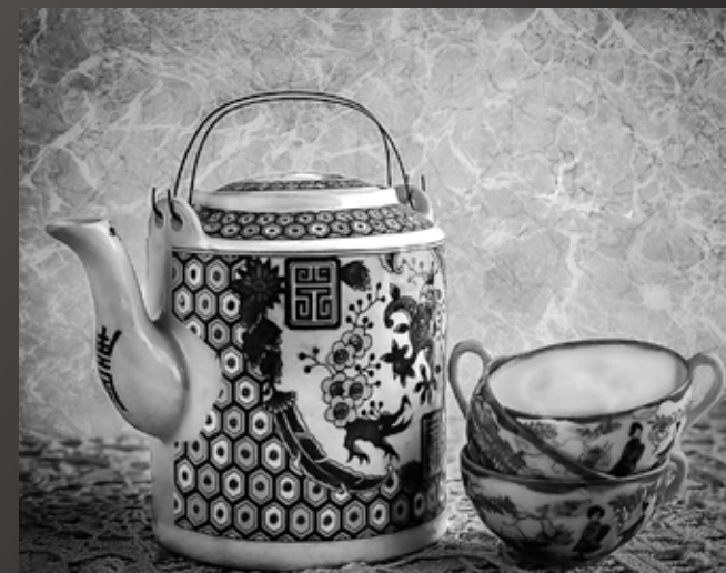
HM Cathaleen Ley "Japanese Kitchen 2"