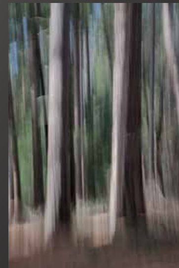
HM Greg Hockel "Yosemite Trees"