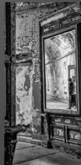
3rd Place Cathy Hockel “Thru the Looking Glass”