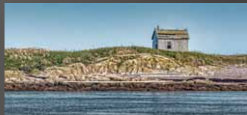
HM Brian Flynn "Flat Wolf Island Shack"