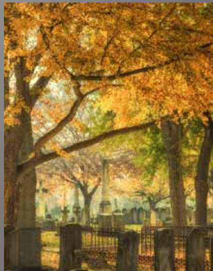
2nd Place Cathaleen Ley "Destiny"