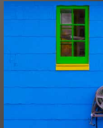
3rd Place Louis Sapienza "Boat House"