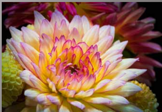
4th Place Louis Sapienza "Dahlia"