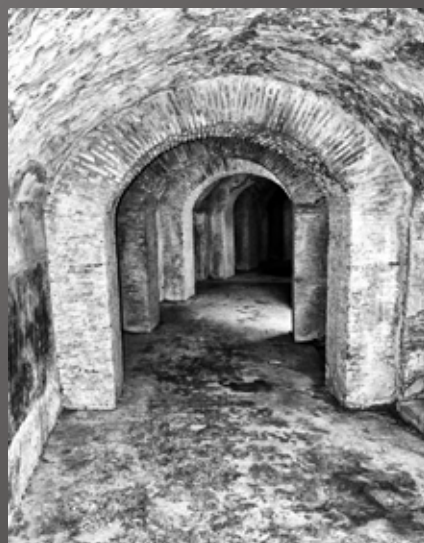
HM Cathy Steele “Mystery Tunnel”