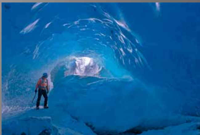
2nd Place Chuck Gallegos "Under the Ice"