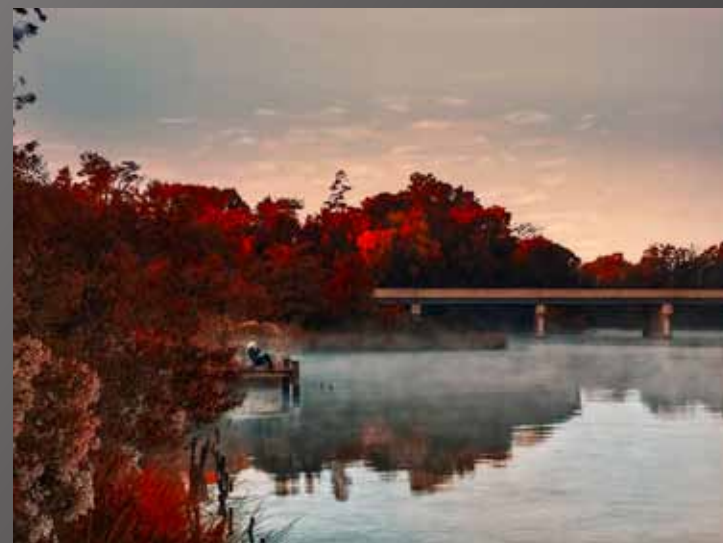
2nd Place Cathaleen Ley "Misty Morning"