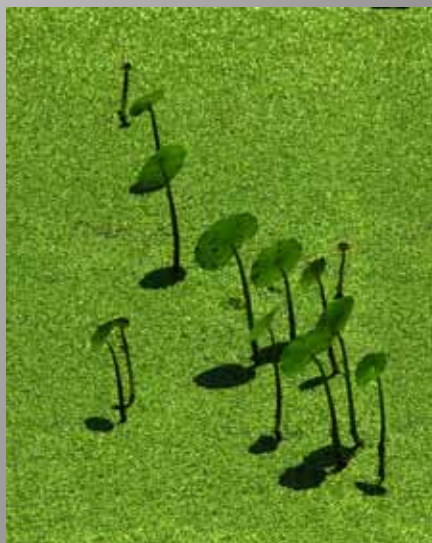
1st Place Allart Kok "Duck Pond March"