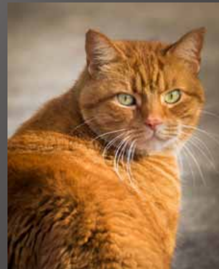
3rd Place Louis Sapienza "Cat"