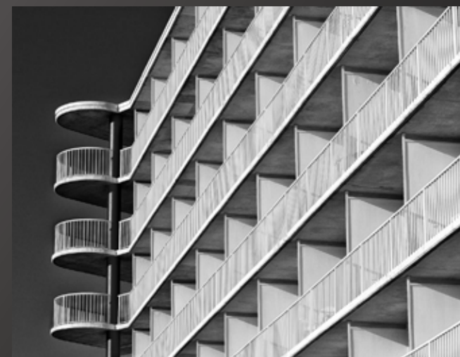
HM Louis Sapienza “Architectural Study”