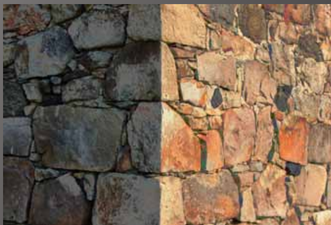
HM Sue Webber "Afternoon Delight"