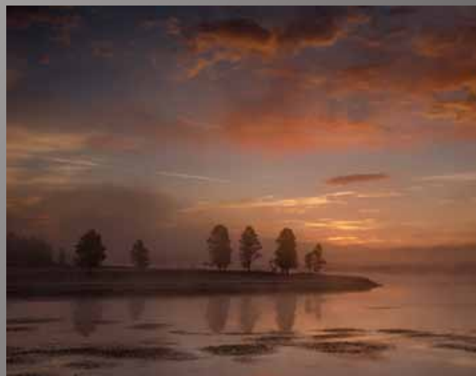
3rd Place - Greg Hockel "Sunrise on the Yellowstone River"