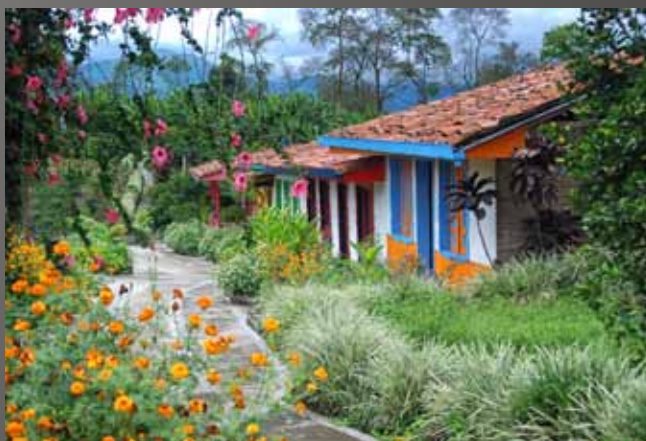
4th Place - Cathy Steele "Coffee Plantation"