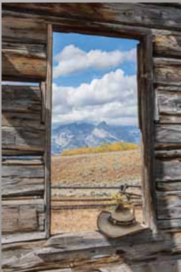
1st Place - Cathy Hockel "Hat in Window"