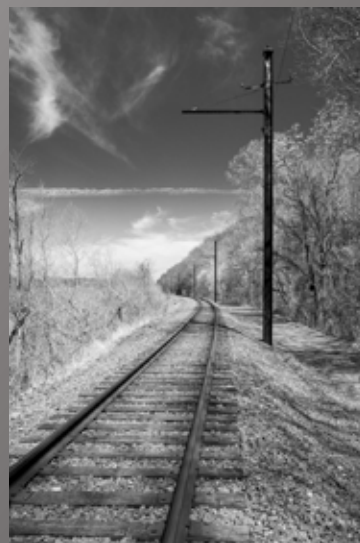
2nd Place - Chip Bulgin "Training Grounds"