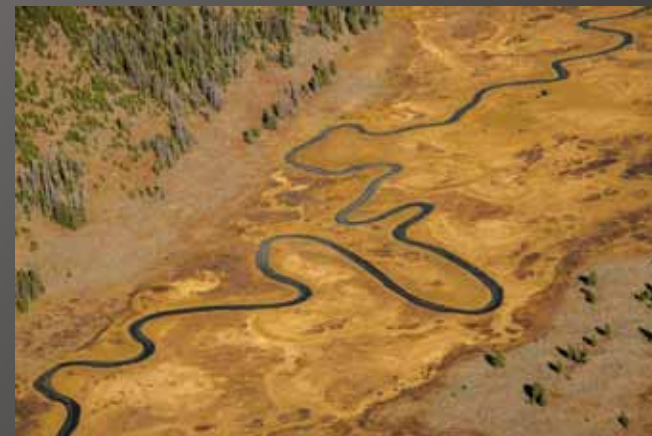
3rd Place - Greg Hockel "Winding River"