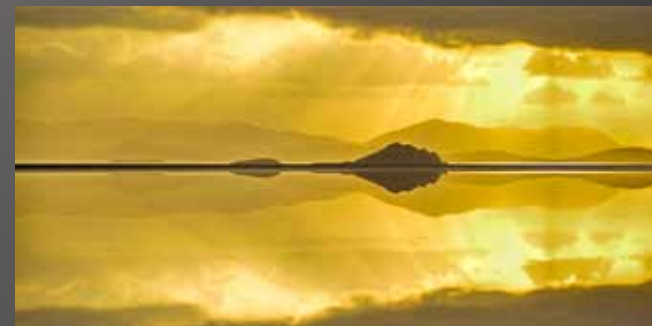
3rd Place Louis Sapienza "Island Reflections"