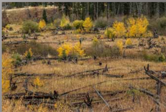
4th Place - Greg Hockel "Abandoned Corrals"