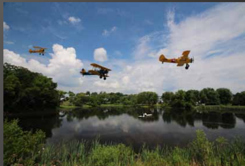
4th Place - Bob Webber "Pond Scape"