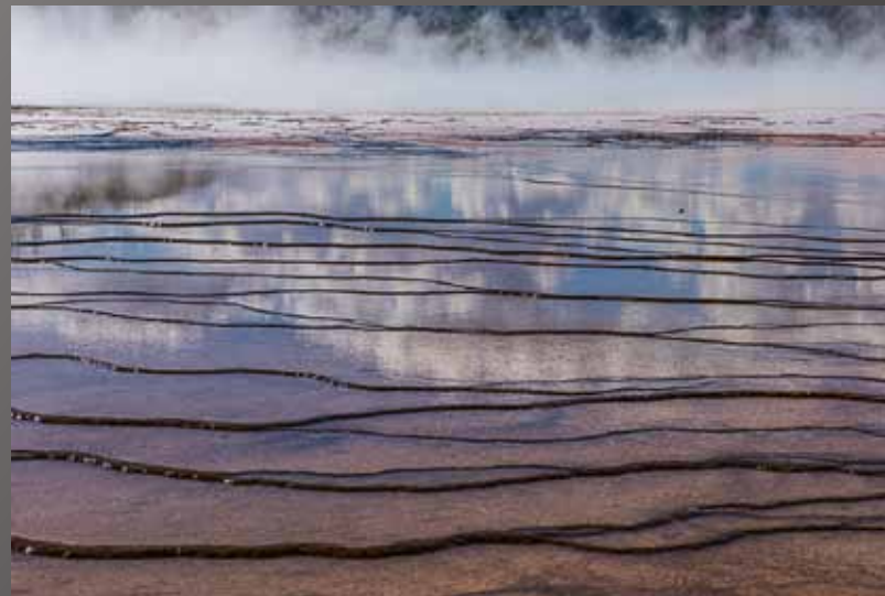
2nd Place - Cathy Hockel "Geyser Ripples"