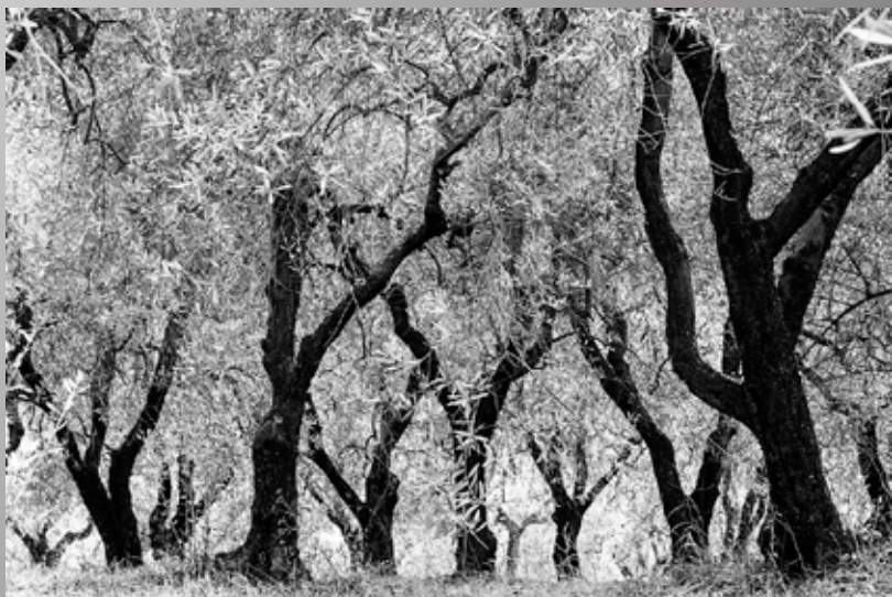
1st Place - Chuck Gallegos "Under the Olive Grove"