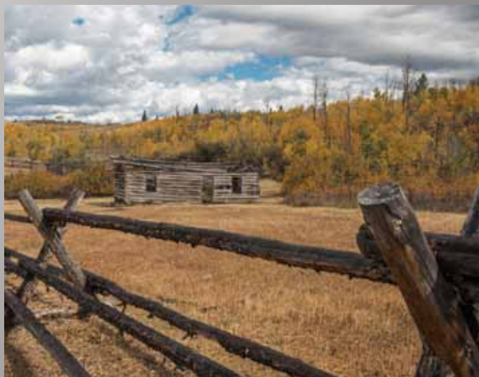
1st Place - Greg Hockel "Abandoned Cabin"