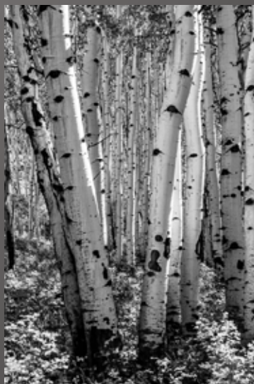
4th Place - Cathy Hockel "Aspens"