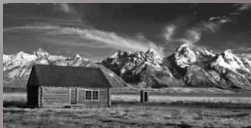
4th Place - Reb Orrell "Grand Tetons"