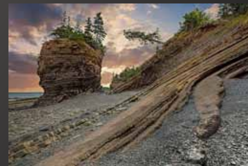
HM Chuck Gallegos "Time Warp"