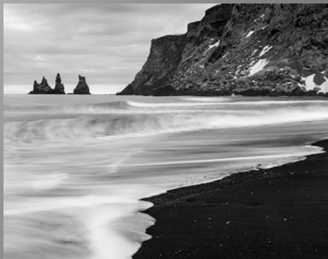
3rd Place - Chuck Gallegos "Reynisdranger Sand and Foam"