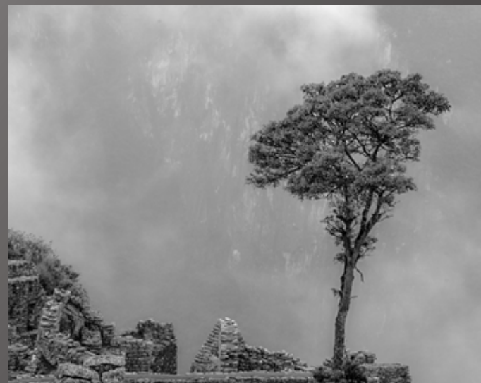
3rd Place - Greg Hockel "Mountain Top Tree"