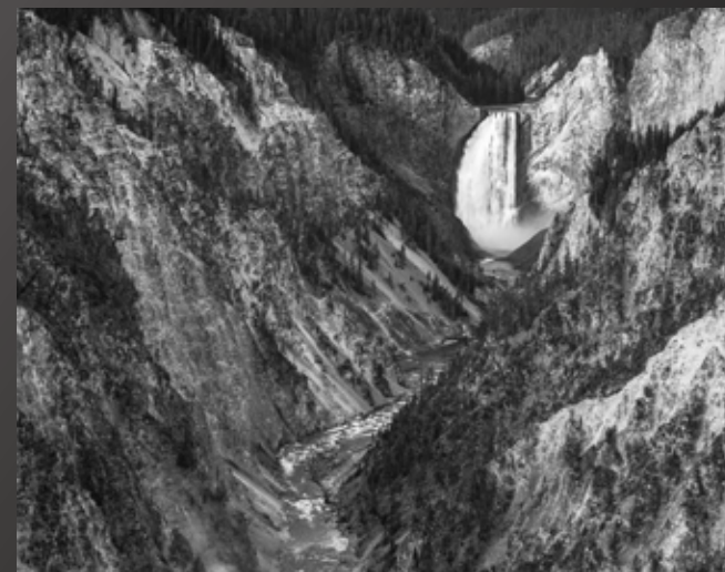
HM - Cathy Hockel "Upper Yellowstone Falls"