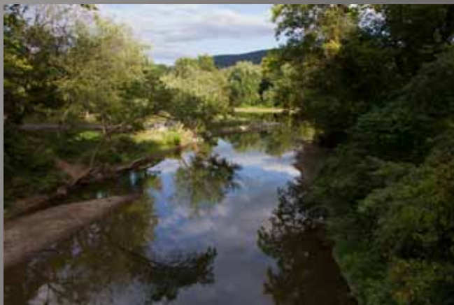
2nd Place - Jackie Colestock "15 Mile Creek"