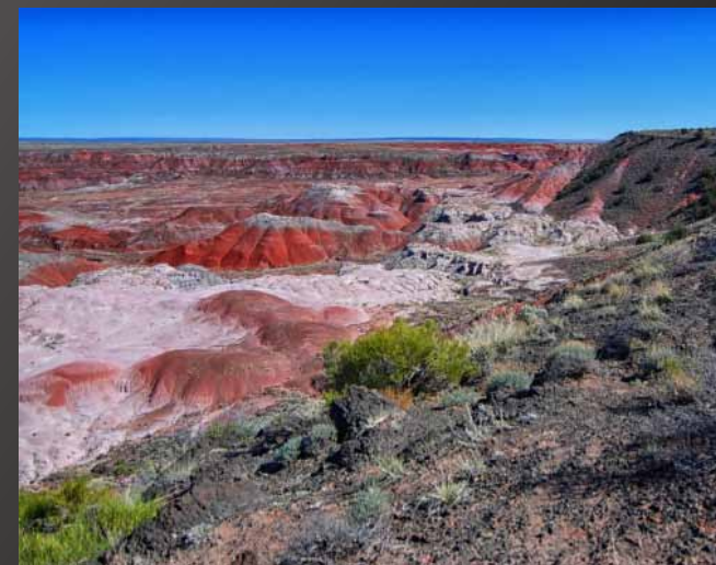
HM Cathy Steele "Painted Desert"