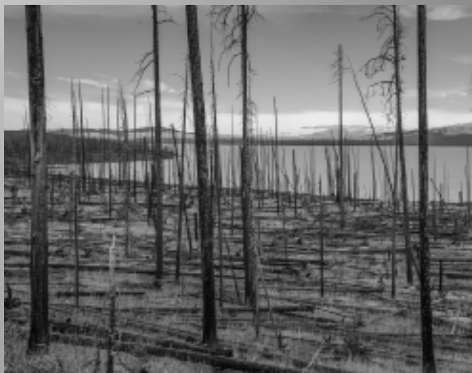
2nd Place - Greg Hockel "Burned Out Forest"