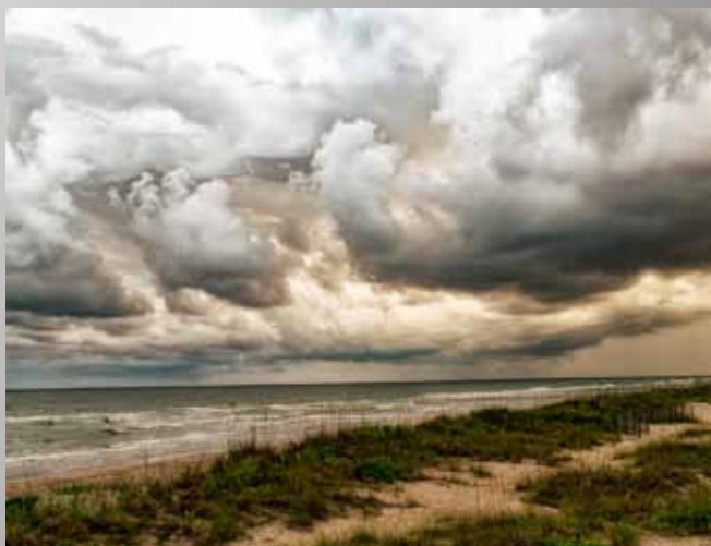
1st Place - Cathaleen Ley "Ocean Clouds"