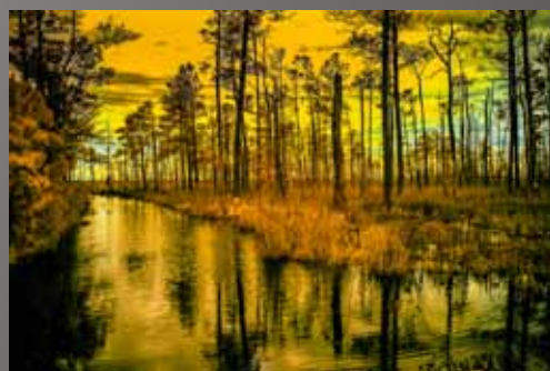
HM - Ron Peiffer "Blackwater Dusk"