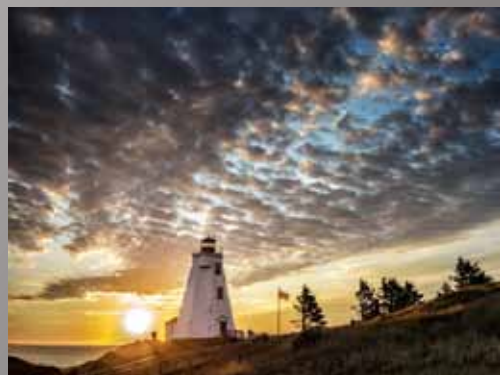
4th Place - Leigh Penfield "Swallow Point Light"