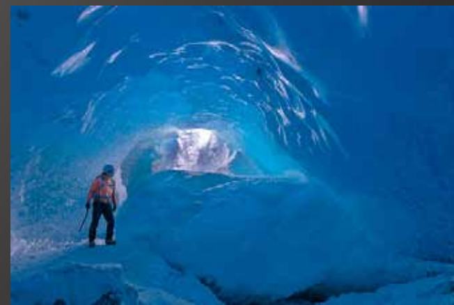
HM - Chuck Gallegos "Under The Ice"