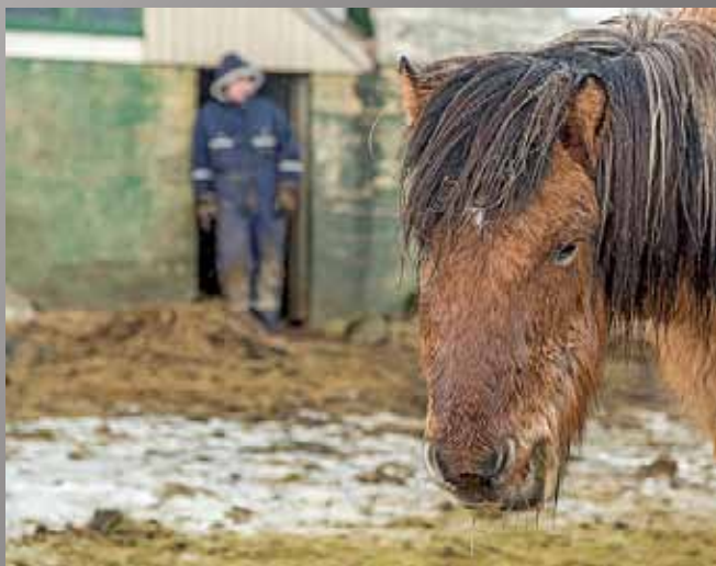
4th Place - Chuck Gallegos "Harsh"