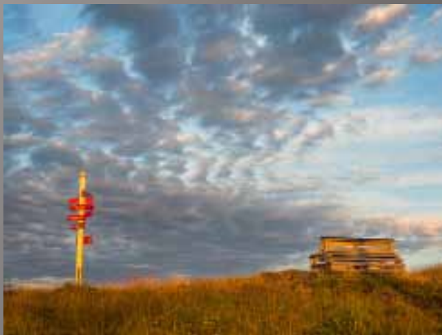
2nd Place - Leigh Penfield "Sunrise Bench"