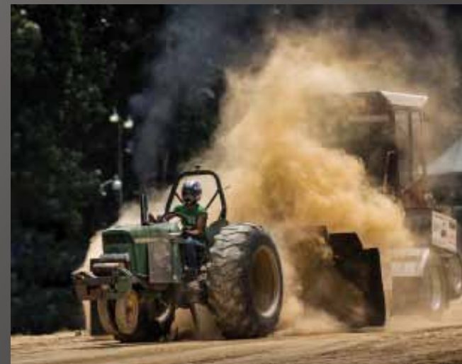
3rd Place - Ron Peiffer "Tractor Pull"