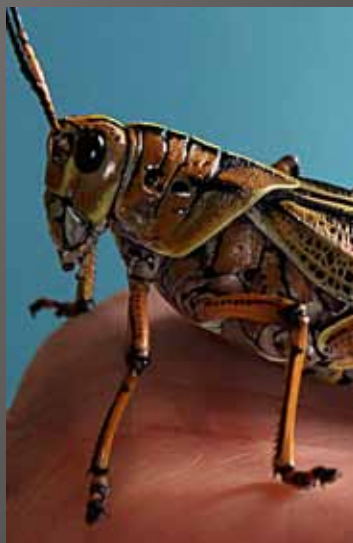
HM Susan Webber "Grasshopper"