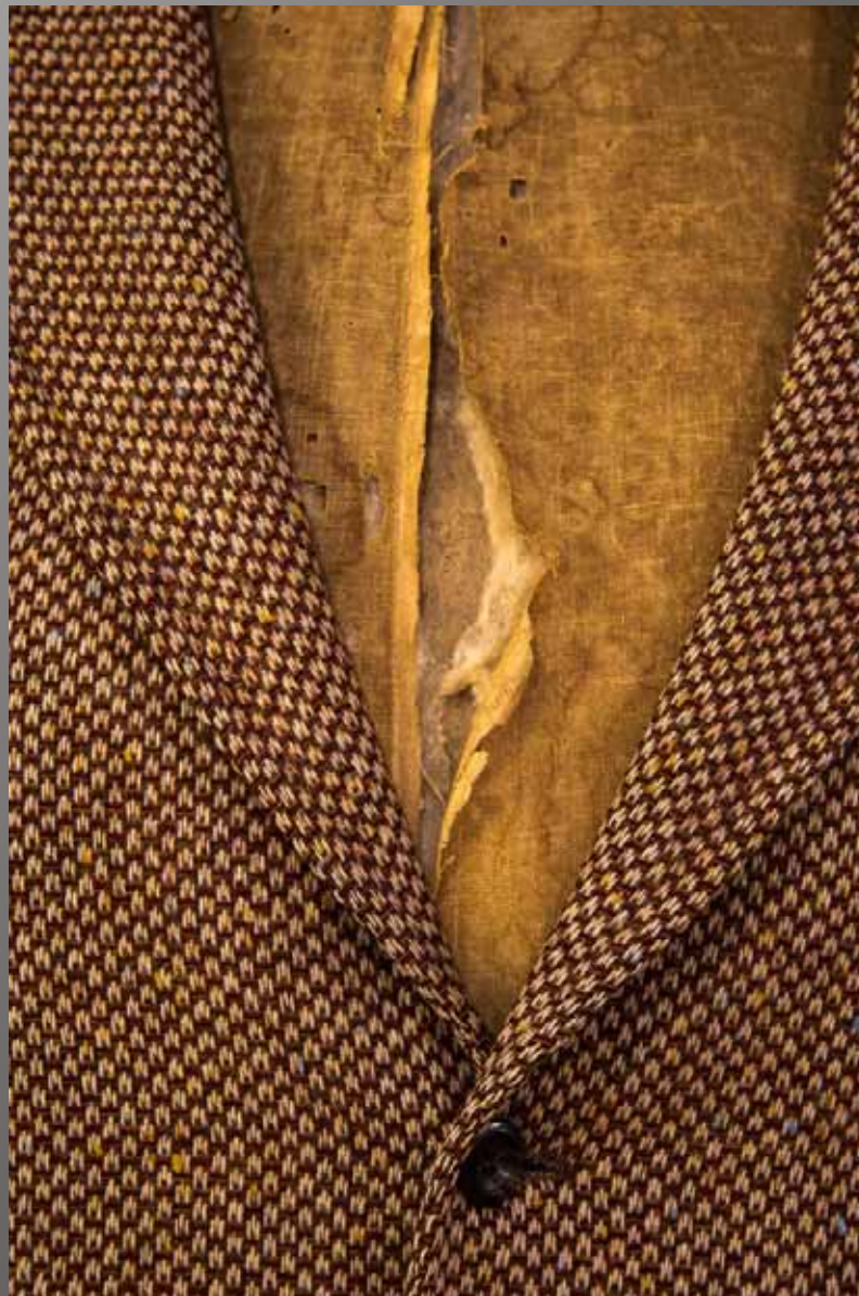
Greg Hockel "Best Dressed"