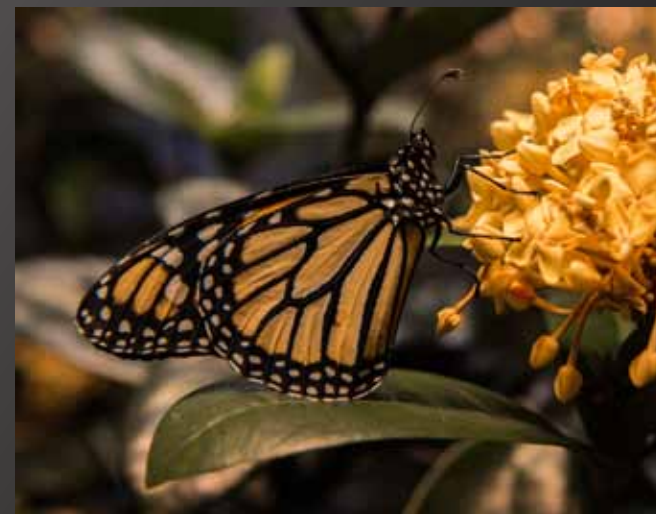
HM Cathy Hockel "Insect & Butterfly"