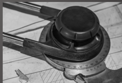
HM Cathy Hockel "Drafting Tool"