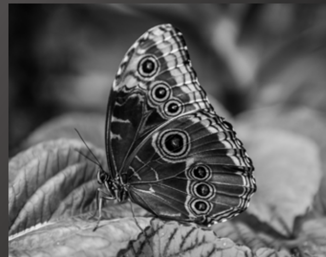
HM Cathy Hockel "Insect Butterfly"