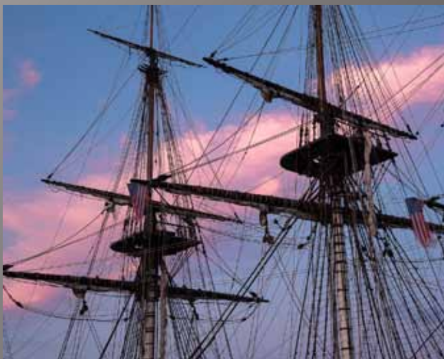
2nd Place Greg Hockel "Rigging"