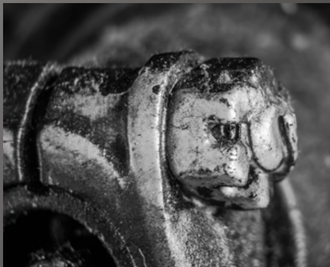
4th Place Greg Hockel "Meow"