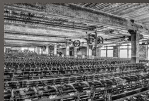
HM Greg Hockel "Lonaconing Silk Mill - Can You Hear"