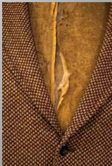
1st Place Greg Hockel "Best Dressed"