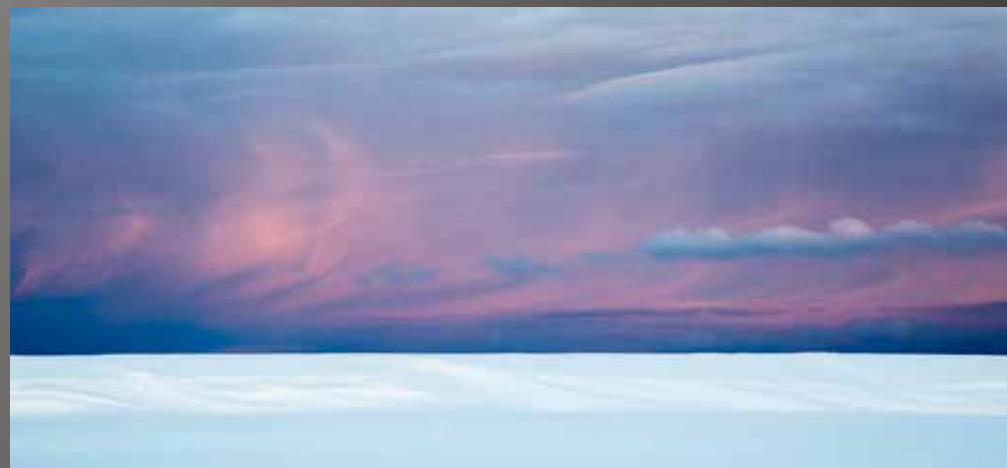
2nd Place Chuck Gallegos "Fire and Ice"