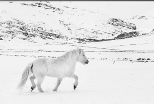
HM Chuck Gallegos "White on White"