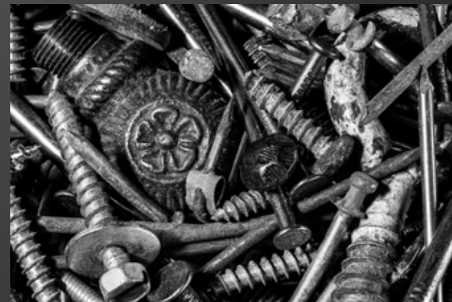
HM Ron Peiffer "The Flower"