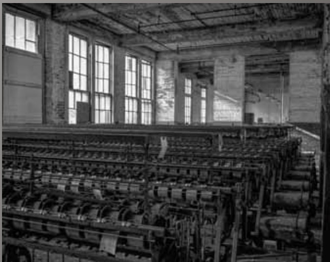
2nd Place Cathy Hockel "Abandoned Silk Mill"