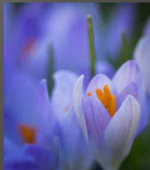
HM Louis Sapienza "Blue Crocus"