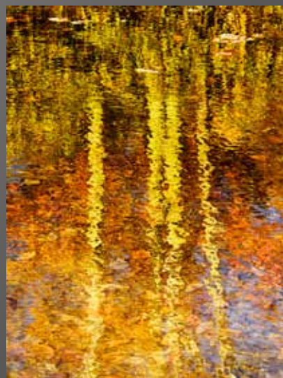
HM Charlie Floyd "Monet in the Blue Ridge"