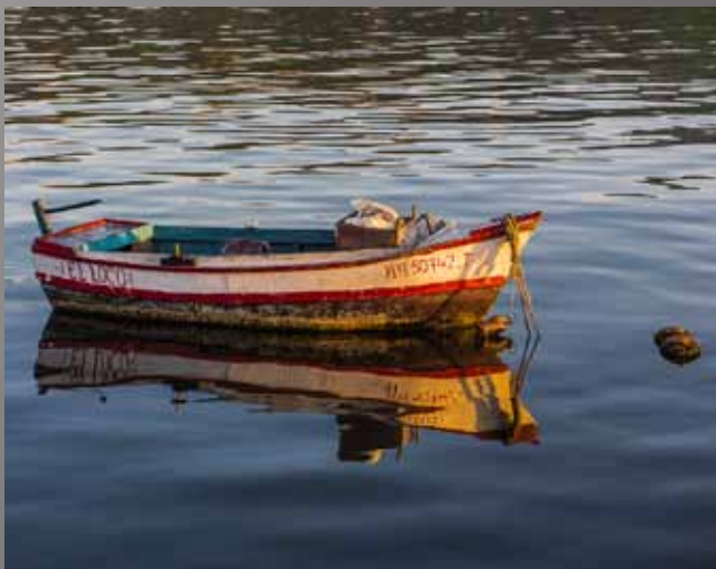
2nd Place Cathy Hockel "El Loco"