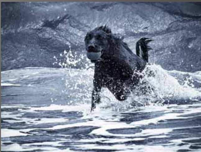
HM Charlie Floyd "Demon of the Deep"