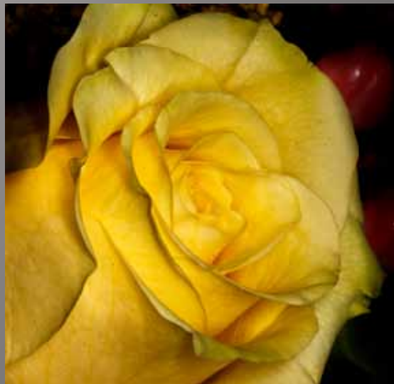
2nd Place Louis Sapienza "Yellow Rose"