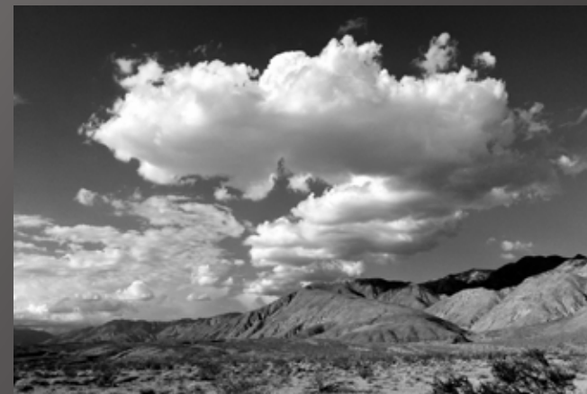
3rd Place Chip Bulgin "Cloud Cover"