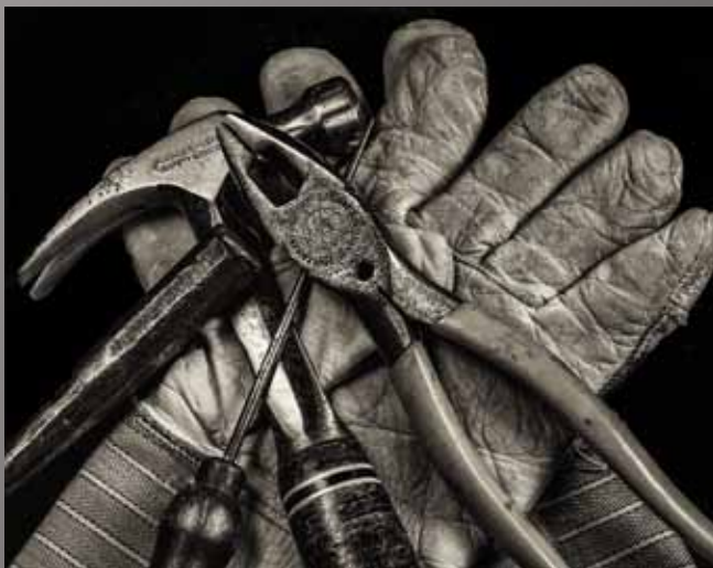
2nd Place Ron Peiffer "Dad's Tools"