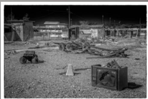
4th Place Greg Hockel "Apocalypse"