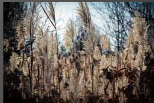
HM James Mumper "Morning Light"