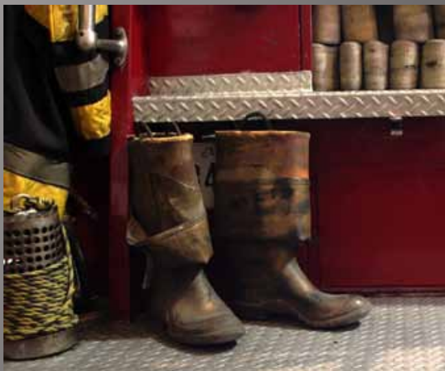
2nd Place Sue Webber "Boots"