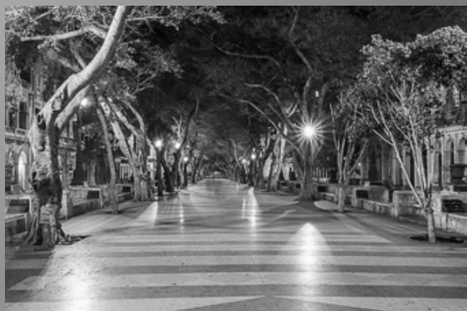
4th Place Cathy Hockel "The Boulevard"