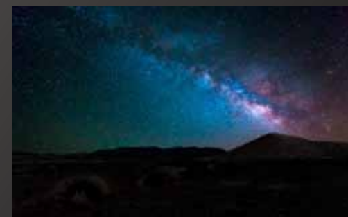
HM Chip Bulgin "Joshua Tree"