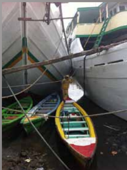
HM Glenn Strachen "Man on Watch"