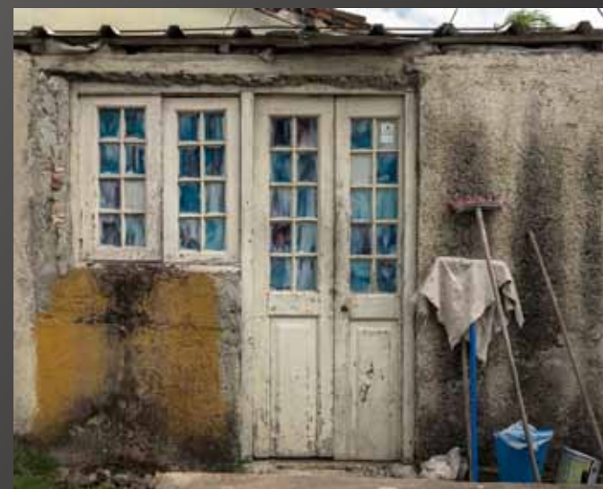
4th Place Greg Hockel "There is still work to be done"