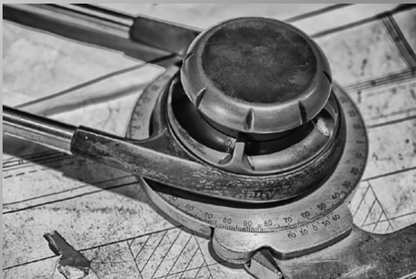
HM Cathy Hockel "Drafting Tool"