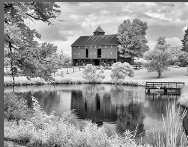
3rd Place Chuck Gallegos "Lazy Daze"