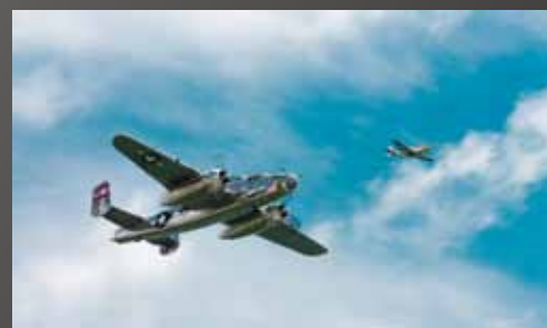
HM Chip Bulgin "Escort"