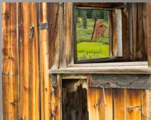
4th Place Chuck Gallegos "Through the Window"