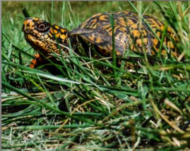
2nd Place Ron Peiffer "Box Turtle Crossing"