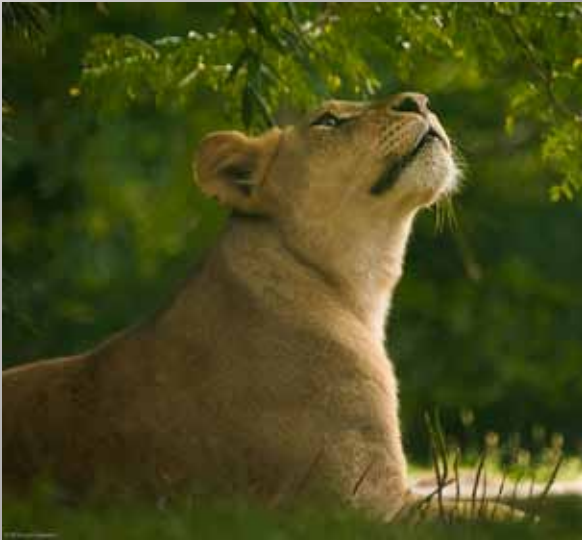
1st Place Louis Sapienza "Lion"