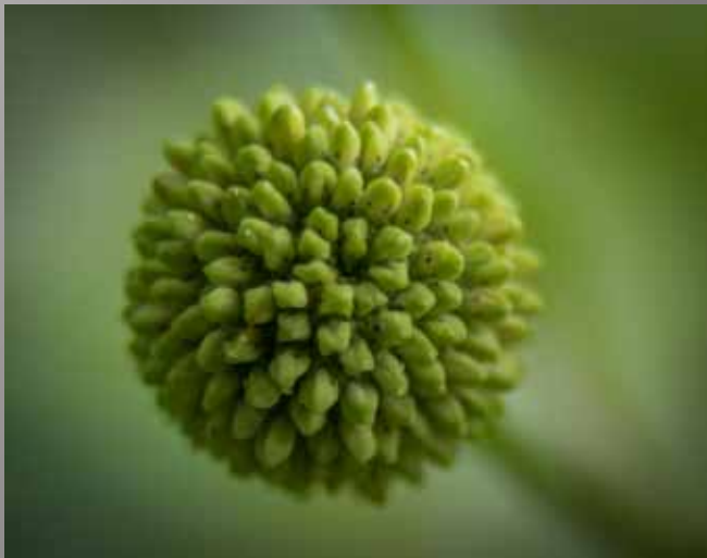
4th Place Greg Hockel "Green Thing"