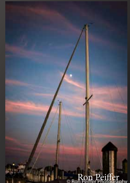
Ron Peiffer © Ron Peiffer Photography