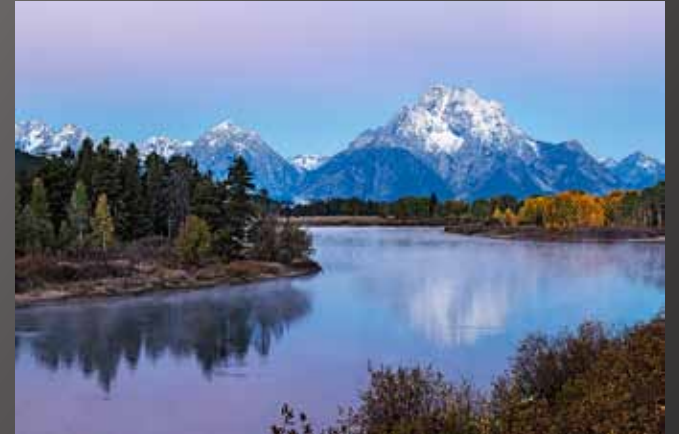
3rd Place Chuck Gallegos "Teton Pastel"