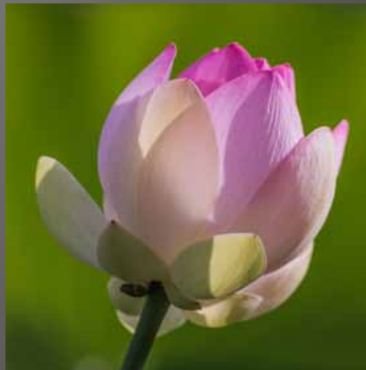
HM Cathy Hockel "Blooming Lotus"