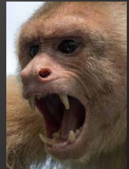
HM Greg Hockel "Don't Mess with Me"