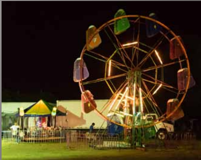
2nd Place Charlie Floyd "Sound and Light"