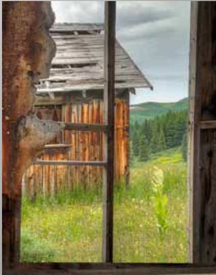
1st Place Chuck Gallegos "Room with a View"