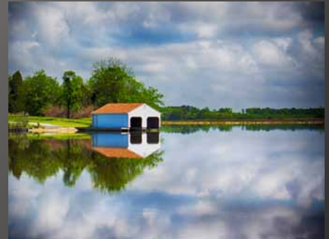
3rd Place Charlie Floyd "Blackwater Boathouse"