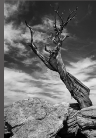
3rd Place Ron Peiffer "Mesa Tree #7"