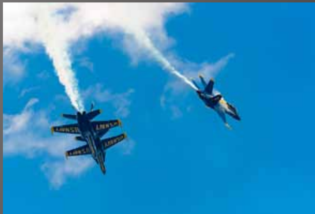
HM Chip Bulgin "Breaking Right"