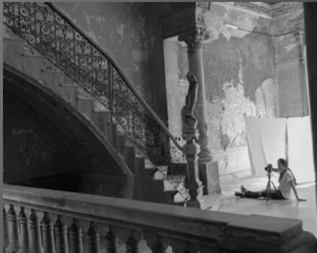
HM Greg Hockel "Photographer at Work"