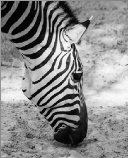
4th Place Louis Sapienza "Zebra"