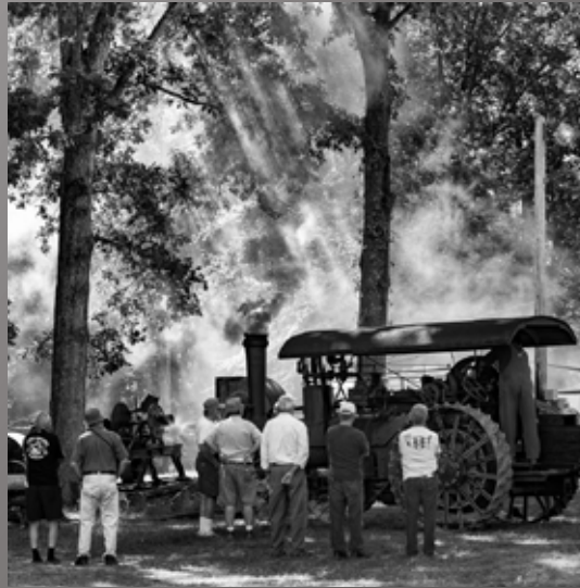
2nd Place Ron Peiffer "The Church of Steam"