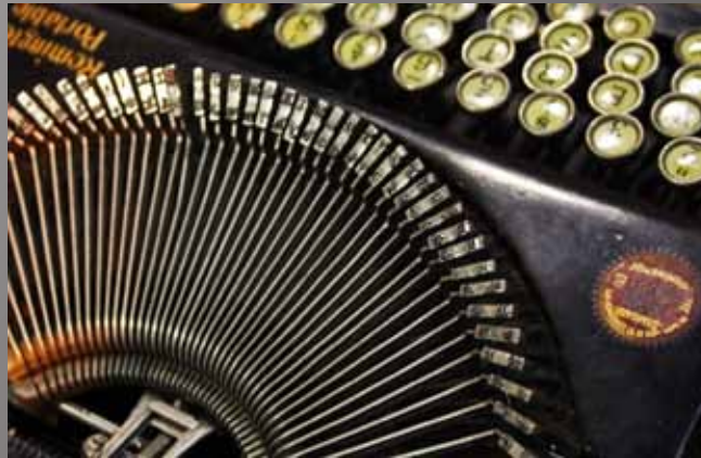
2nd Place Chuck Gorum "Type"