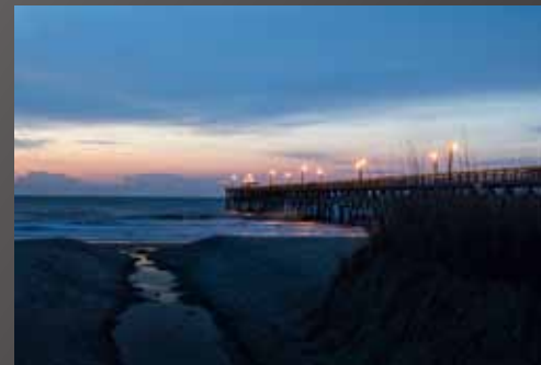
HM Fred Venecia "Surfside SC"