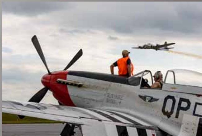
4th Place Chip Bulgin "Waiting On The Heavies"