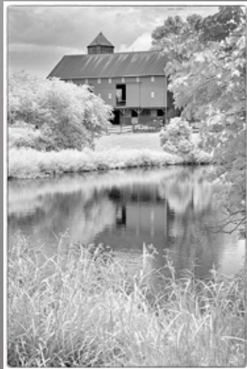
4th Place Chuck Gallegos "Rural Tranquility"