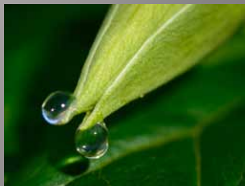
Example of Macro Photography by Chip Bulgin

The geometric shape/pattern can be made of anything. Lines, circles, squares, triangles, etc. Abstract works are not allowed, the geometric shape must be something present in the real world, something that we've seen and shot. It must be a characterizing element of the picture, but doesn't need to be the only subject of it. The trick is in learning to find objects with appealing shapes and to capture them in an equally appealing way. Organic shapes occur frequently in nature (hence the name). They include curves, such as those you might see in the petal of a flower, and irregular shapes such as those you might see on a rock face. Geometric shapes, on the other hand, are straight