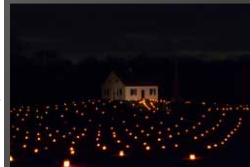
Example of Night Photography by Jackie Colestock

Street photography is photography that features the human condition within public places. Framing and timing can be key aspects of the craft with the aim of some street photography being to create images at a decisive or poignant moment. Street photography can focus on emotions displayed, thereby also recording people's history from an emotional point of view. Click here for examples of Street Photography .