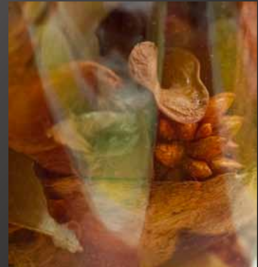
HM Jackie Colestock "Under Glass"