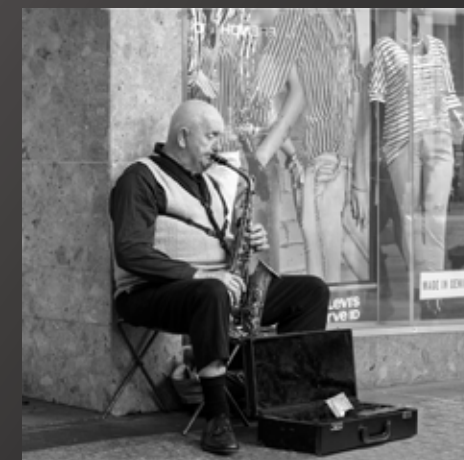
Example of Street Photography by Graham Williams