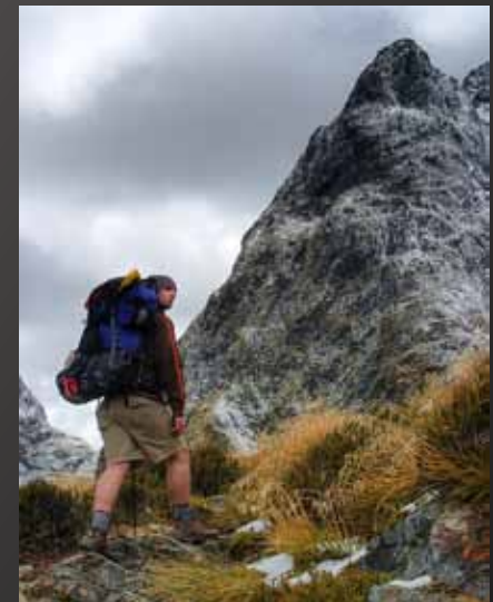
HM Chuck Gallegos "Miles To Go"