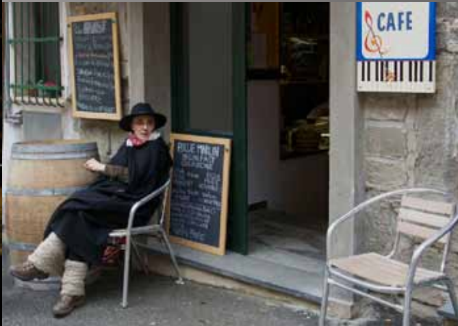
2nd Place Alan Hammerstrom "Italian Lady With No Customers"