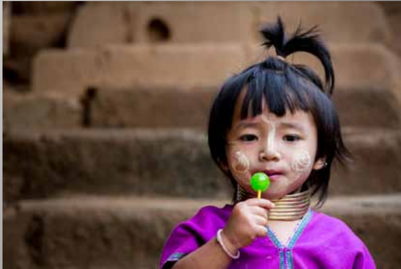
1st Place Brian Flynn "Thailand Mountain Village Girl"