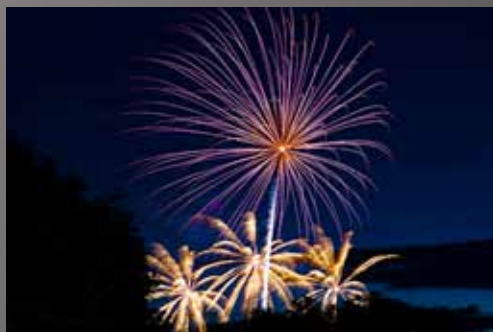
HM Cliff Culp “Palm Like Fireworks”