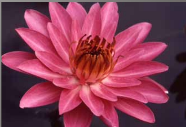
Dick Fairhurst 3rd Place "Pretty in Pink"