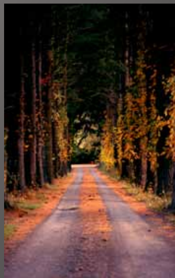
Dick Fairhurst 2nd Place "Trails End"