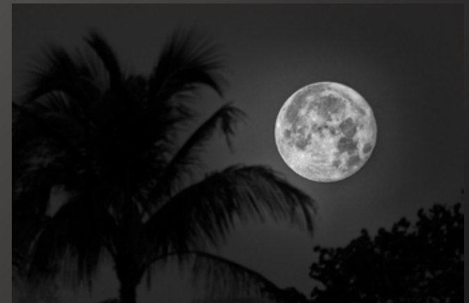
HM Cliff Culp Island “Super Moon”