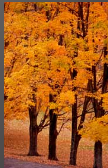
Dick Fairhurst 2nd Place "Shawnee"