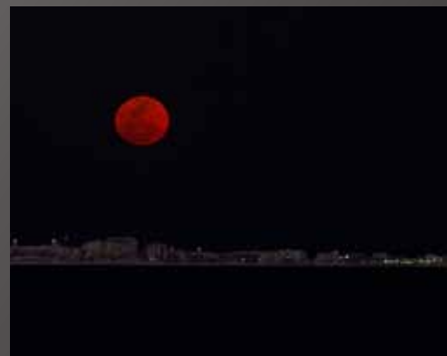
HM Cliff Culp “Super Moon - Sanibel”