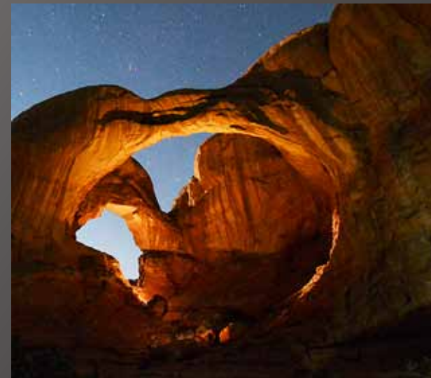
3rd Place Alan Hamerstrom “Light Painted Double Arch at Night”