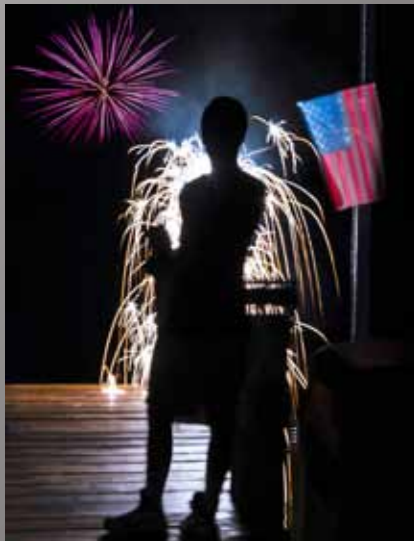
4th Place Cliff Culp “Competing Fireworks”