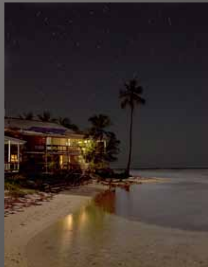
HM Chuck Gallegos “Caribbean Star Trails”