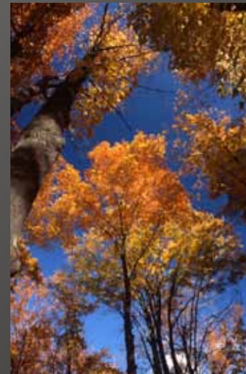
Dick Fairhurst 3rd Place "Tall Gold"