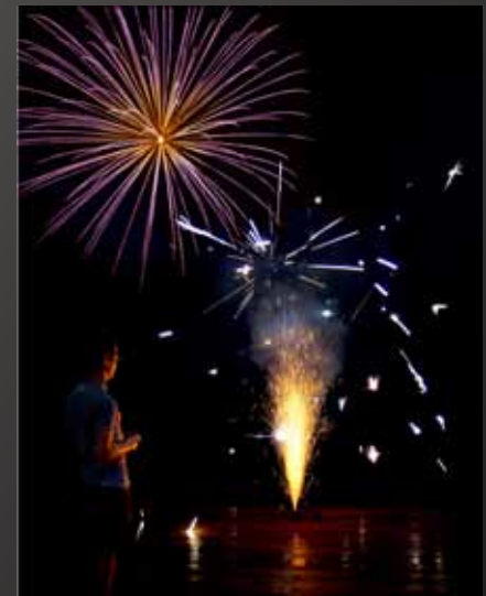
HM Cliff Culp “Between the Flashes”