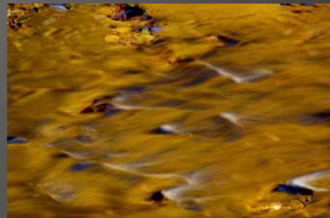
Dick Fairhurst HM “River of Gold”