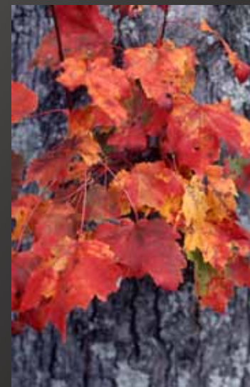
Dick Fairhurst 2nd Place "Fall in the Woods"