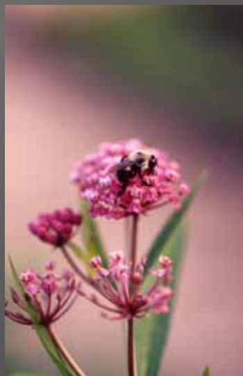
Dick Fairhurst HM “Good View From Here”