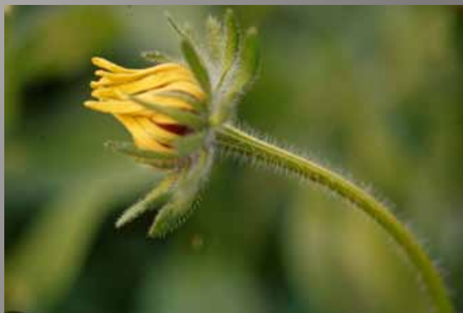
Dick Fairhurst 4th Place "Pucker Up"