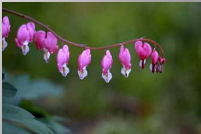
Dick Fairhurst 2nd Place "Just Hanging Around"