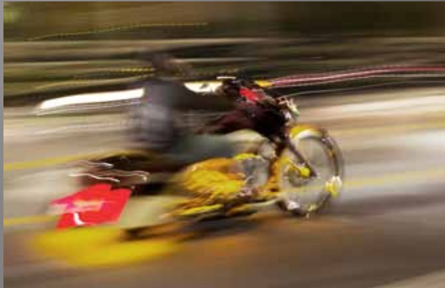
2nd Place Charlie Floyd “Sound and Light”