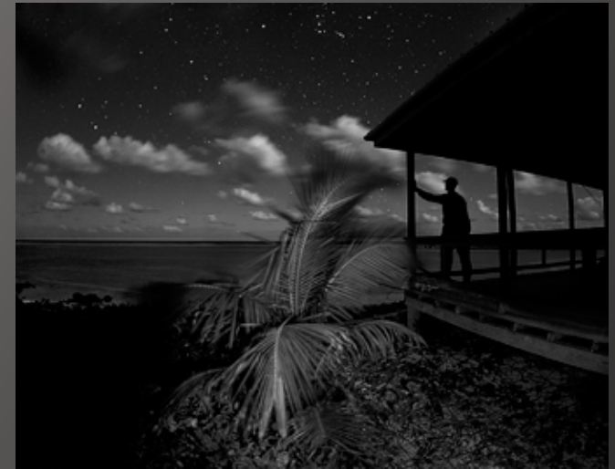
3rd Place Chuck Gallegos “Star Struck”