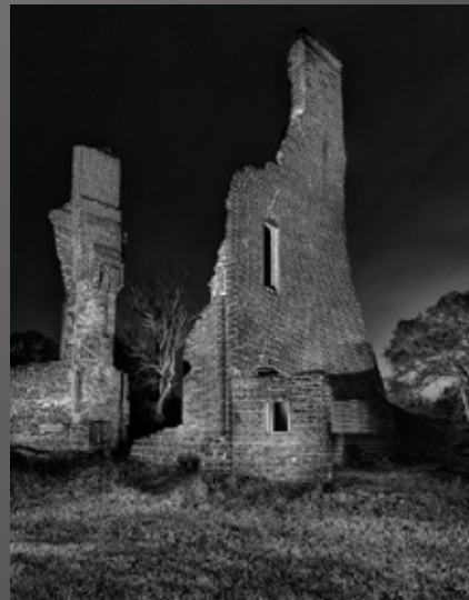
HM Chuck Gallegos “Amidst Ruins”