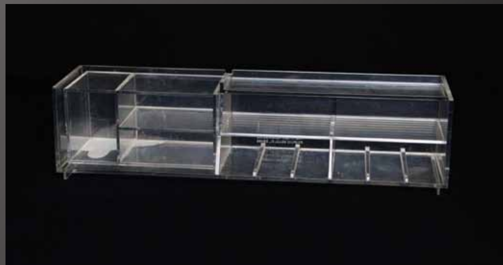
Pretty Neat Cosmetic Organizer You have to see it to truly appreciate it!