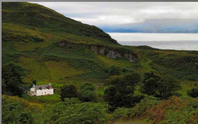
2nd Place Chuck Gallegos “Good Neighbors”