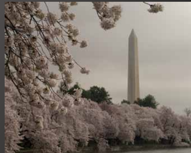
Sunny Frank 3rd Place "Grey Day in DC"