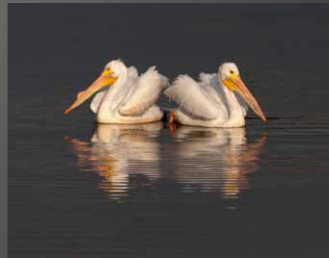
3rd Place Dawn Grannas “White Pelicans”