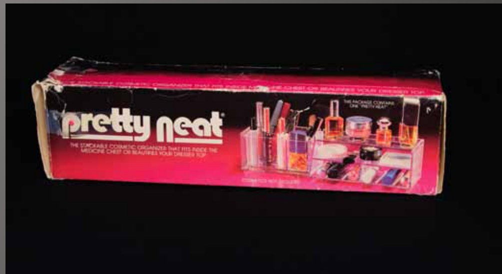
Pretty Neat Cosmetic Organizer in Original Box