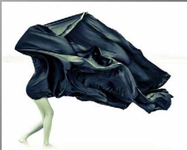
4th Place Chip Bulgin “Windswept”