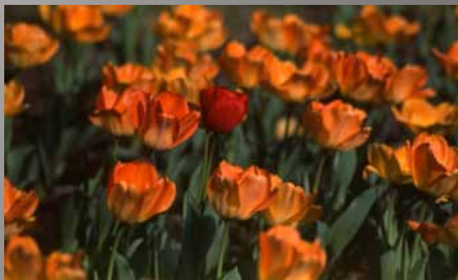
Sunny Frank 2nd Place "One of a Kind"

"The timing is never right to lose such a wonderful lady. All of her future photography will be from a vantage point that we cannot match. She will always be one up on us."