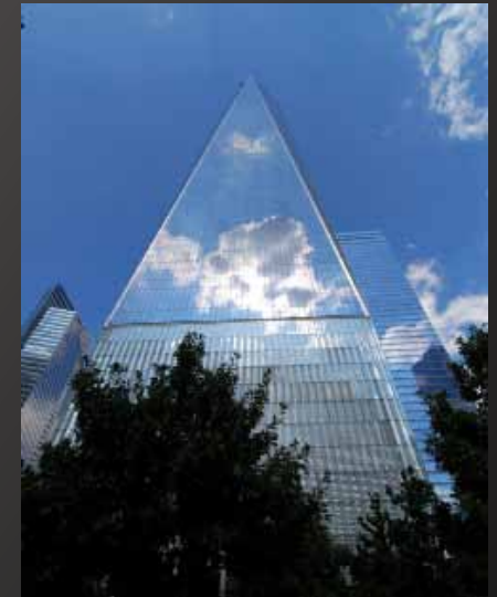
HM Cathleen Steele “Reaching New Heights”