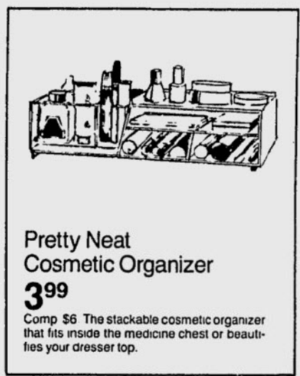
Pretty Neat Cosmetic Organizer Sold for $3.99 in 1983