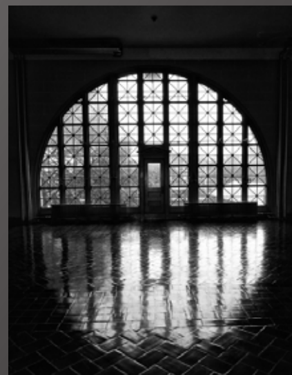
HM Cathleen Steele “Circle of Light”