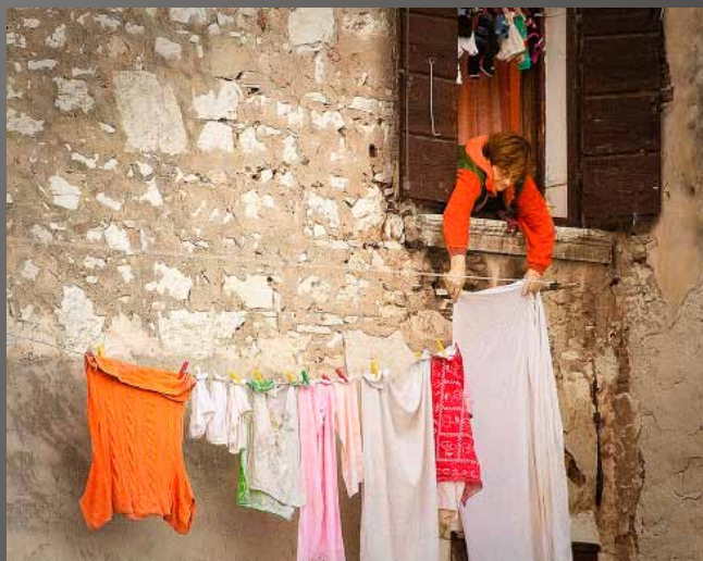
HM Chuck Gallegos “Laundry Day”