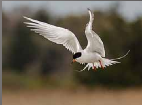
HM Cliff Culp “Looking for a Place to Land”