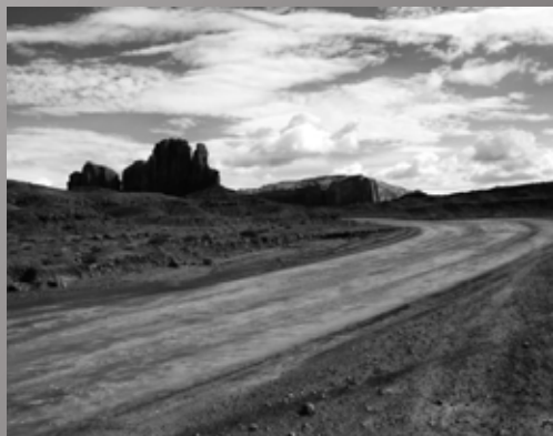
4th Place Cathleen Steele “High Road”