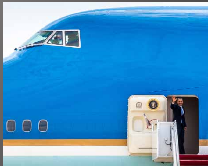
2nd Place Brian Flynn "We're Off"