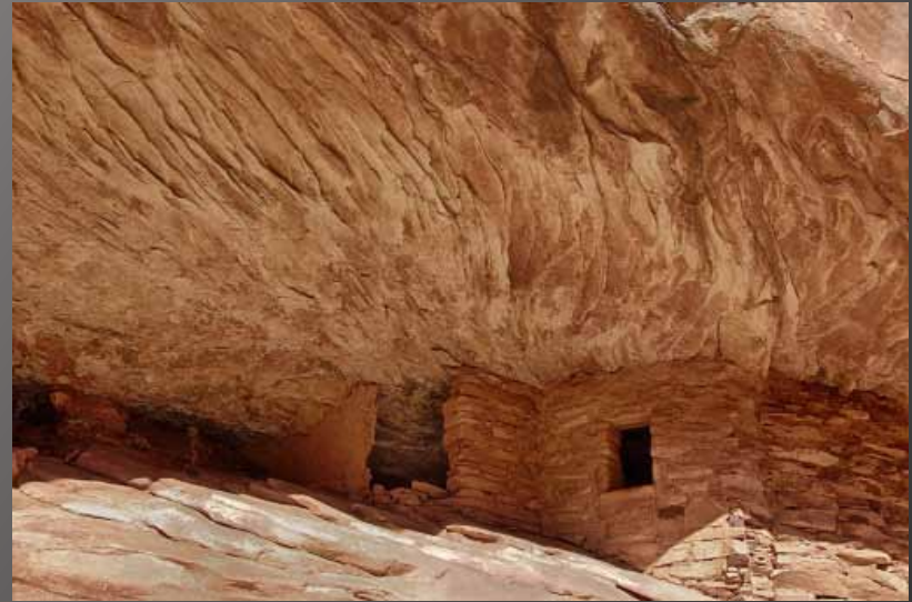
Ron Peiffer "Burning Roof"

makes me pay greater attention to composition and form. When I shoot color images, I am drawn to strong colors and dramatic lighting. However, I try to tiptoe the line between a natural look and a little bit of drama. I have struggled with the brutal dynamic range of light I face in the desert and have found HDR a good compensating tool. If I do use HDR, and the viewer doesn't notice it, I feel I am successful. I am a constant student, so I am exploring infrared, star trails, focus stacking and other techniques, but I am realizing I need to work harder at simply composing a good image.