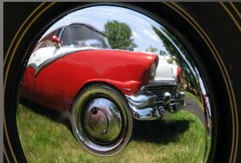
HM Chuck Gallegos "Antique Reflection"