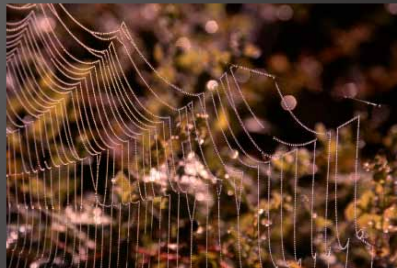
4th Place Dolphy Fairhurst "String of Pearls"