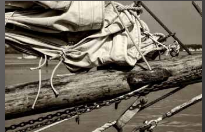
3rd Place Ron Peiffer "Waiting to Sail"