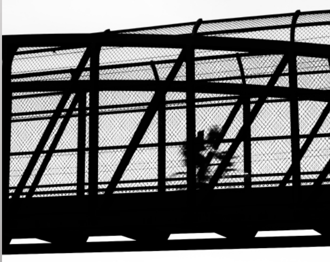
1st Place Charles Floyd "South Bound"