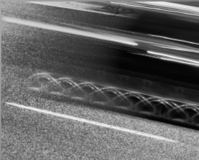
4th Place Charles Floyd "Wheel Patterns"