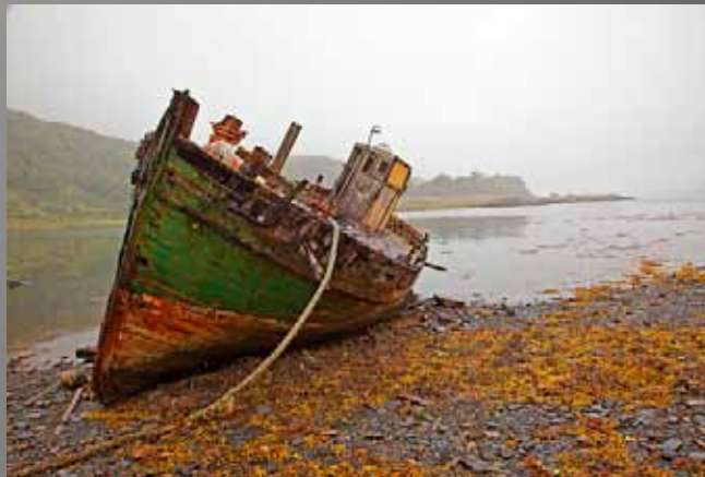
2nd Place Chuck Gallegos "Nowhere Fast"