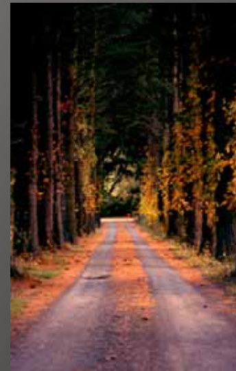
2nd Place Dick Fairhurst "Trails End"