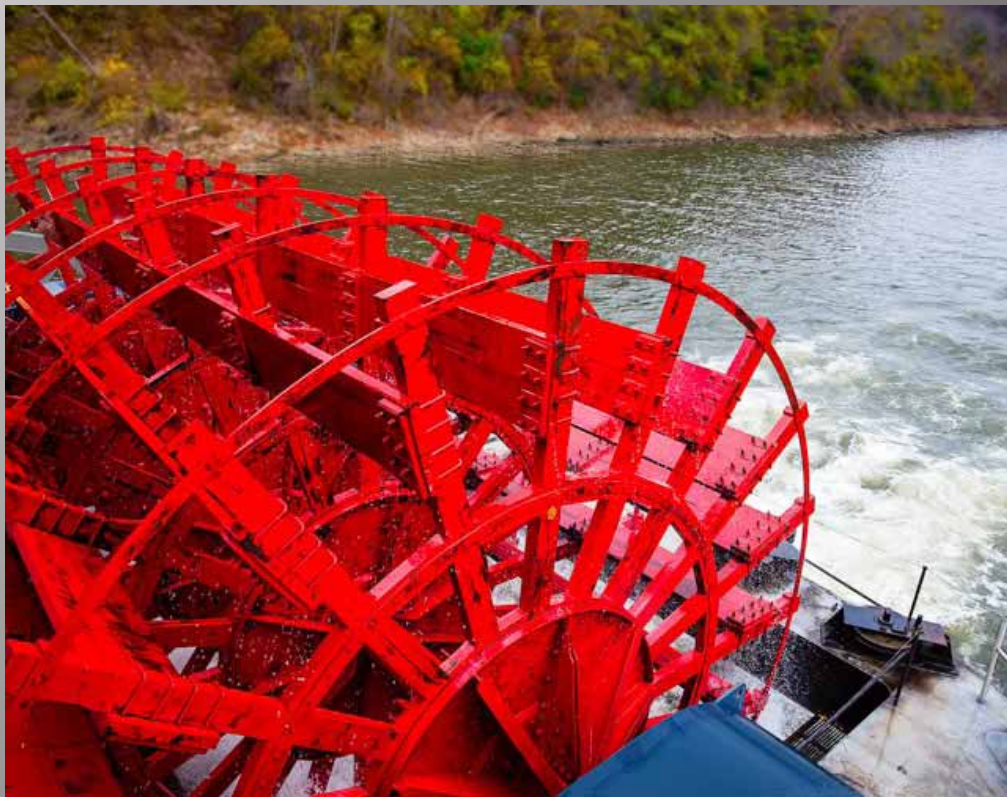
HM Cliff Culp "Old Man River"