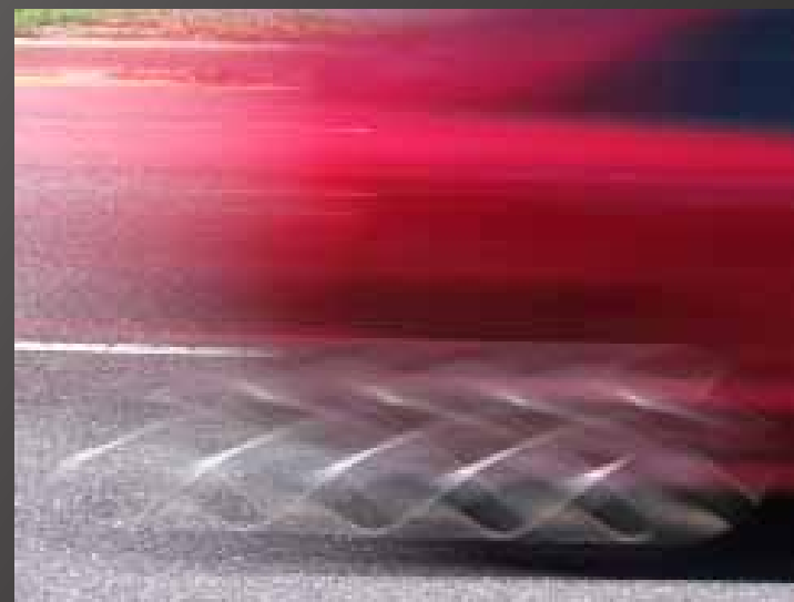
HM Charles Floyd "Hot Wheels"