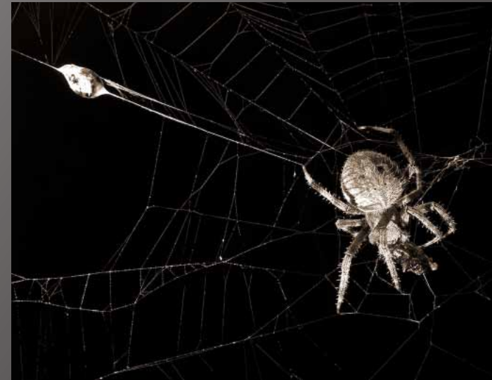
Ron Peiffer Back From Lunch

RP: It used to be spontaneous and almost unintentional—having fun. Something would catch my eye, and I would aim the camera in that direction. I still enjoy stalking spontaneous photos, but I am becoming more intentional. I increasingly plan for good light and often return to a site until the light is right. I used to become infatuated with a singular spectacular element in the frame and overlooked obvious flaws. Now, I try to frame the whole shot more carefully early on so post processing is more often enhancing an image, not repairing it.