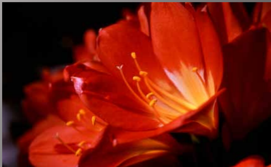
3rd Place Dolphy Fairhurst "Reach for the Sun"