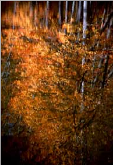
1st Place Dolphy Fairhurst "Reflections"