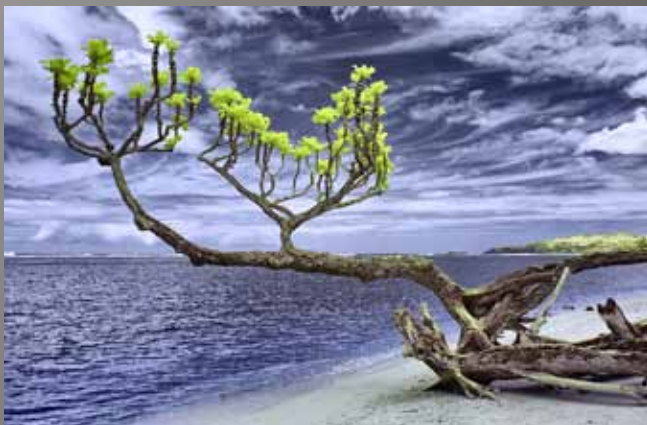
2nd Place Chuck Gallegos "Tropical Beach Tree"