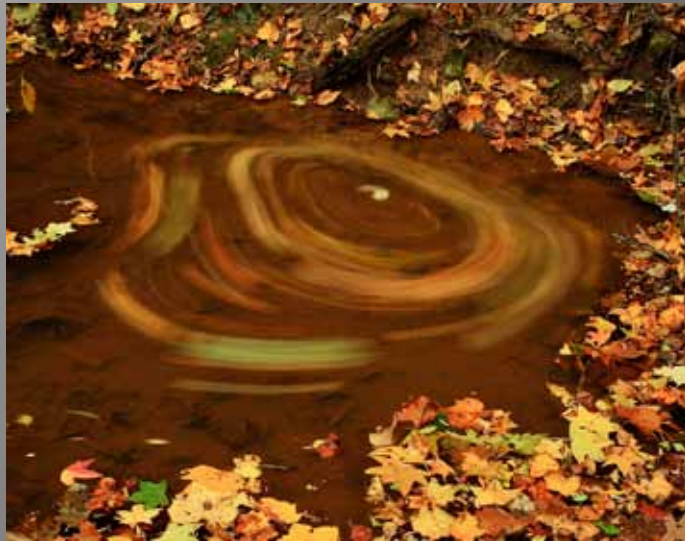
HM Chuck Gallegos "Vorticity"