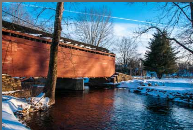
2nd Place Paul Ekstrom "Old Bridge Resurrected"