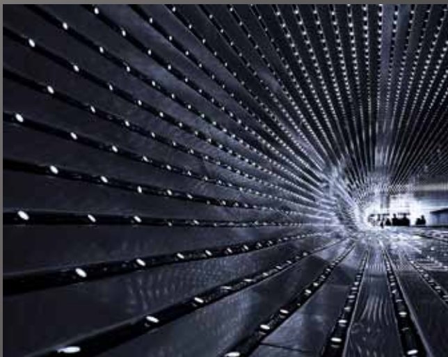
HM Chuck Gallegos "At the End of the Tunnel"