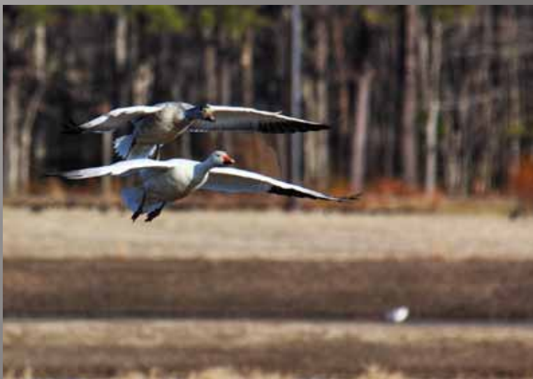
3rd Place Charles Floyd "Final Approach"