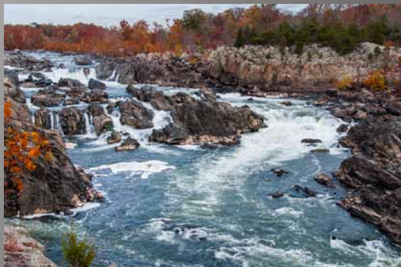
3rd Place Paul Ekstrom "Some Wear and Tear"