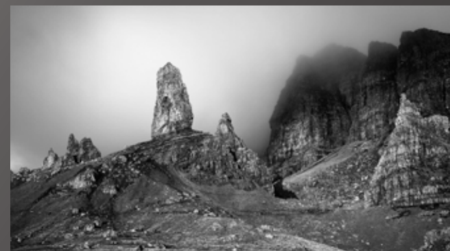
3rd Place Chuck Gallegos "Old Man of Storr"