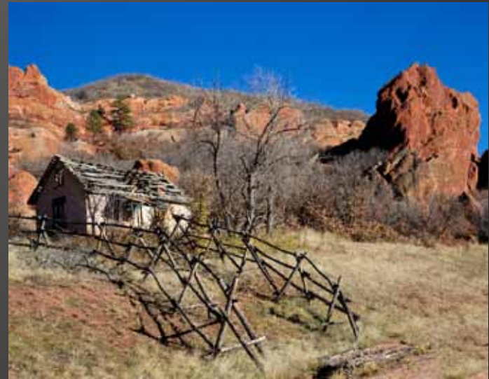
HM Ron Peiffer "Rocky Mountain Fixer Upper"