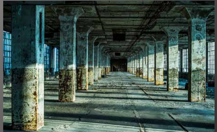
Chip Bulgin Trolley Tracks