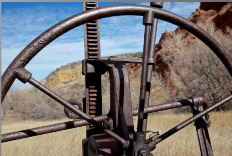
HM Ron Peiffer "Old Plow"