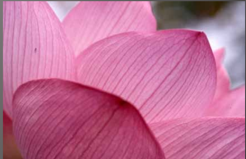
2nd Place Dick Fairhurst "Pink on Pink"