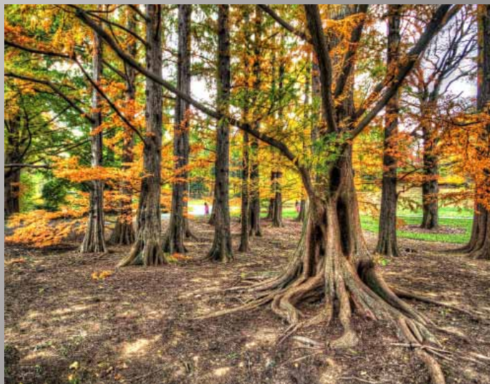
4th Place Donna Neal "Beauty From the Roots up"