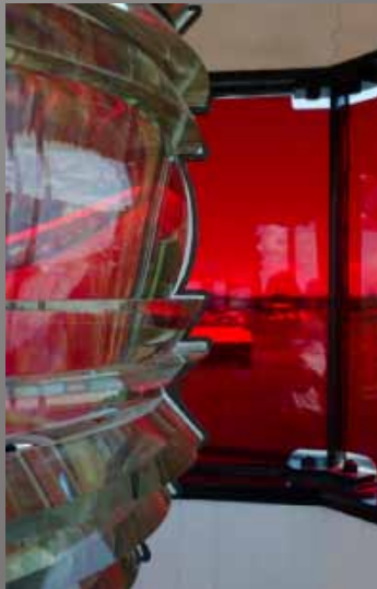
HM Russell Zaccari "The Other Side"