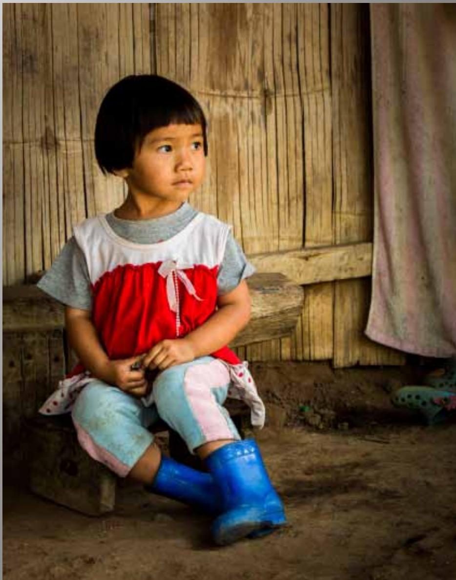
1st Place Brian Flynn "Chinese Village Girl"