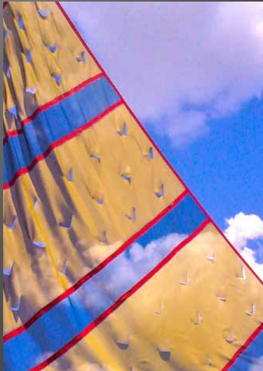
3rd Place Donna Flynn "Day Sail"