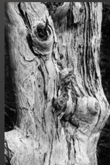
HM Cliff Culp "Knotty Pine"