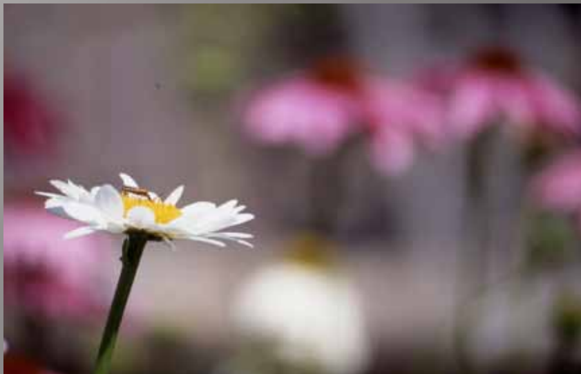
3rd Place Dolphy Fairhurst "Sitting Pretty"