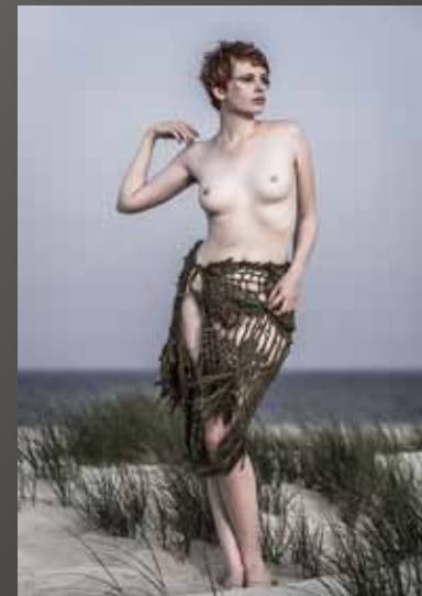
Chip Bulgin Mermaids do Have Legs