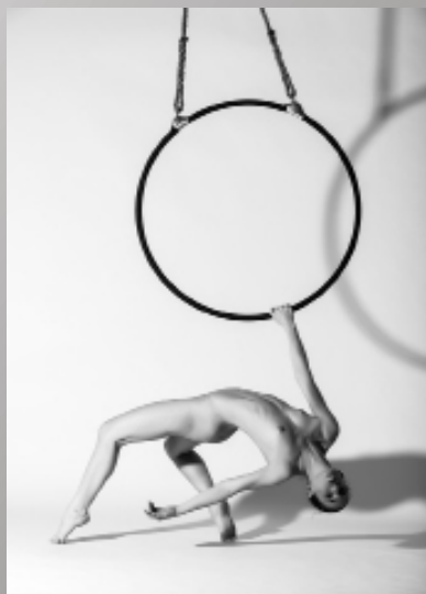
1st Place Chip Bulgin "Bending Over Backwards"