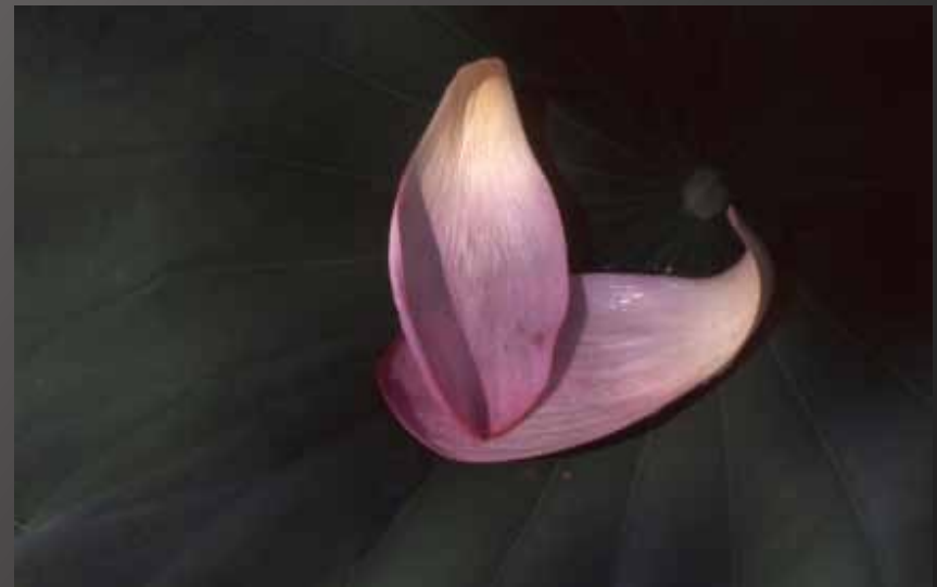
4th Place Dolphy Fairhurst "Hands in Your Lap"