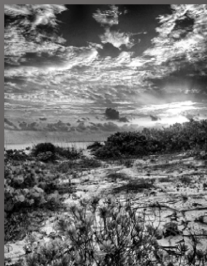
HM Donna Neal "Morning Serenity"