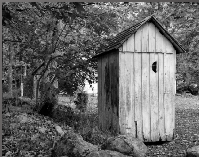
4th Place Vicki Pardoe "Outdoor Plumbing"