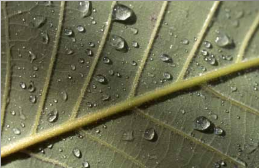
1st Place Dolphy Fairhurst "Dewdrops"