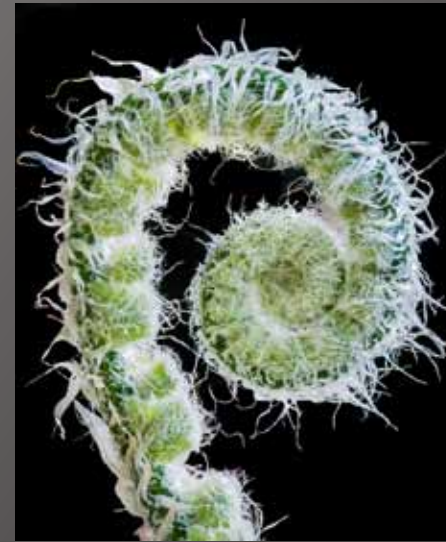
2nd Place Cliff Culp "Springing Open"