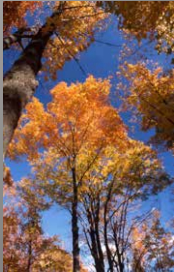
3rd Place Dick Fairhurst "Fall Colors"