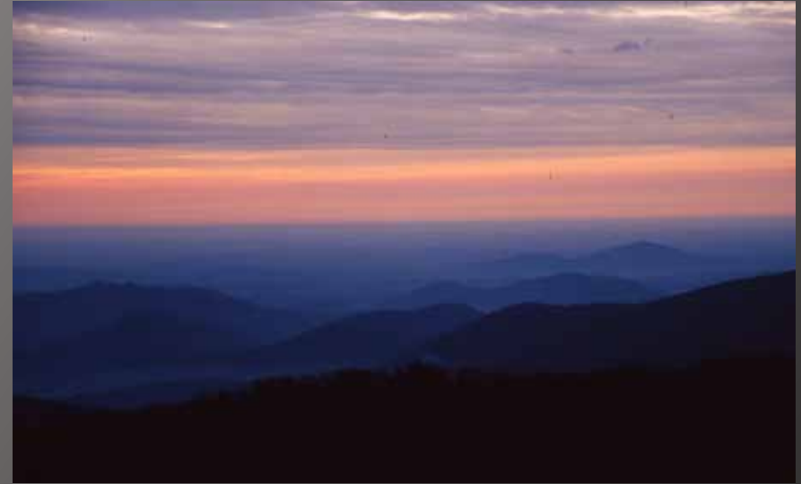
2nd Place Dolphy Fairhurst "Sunrise on the Blue Ridge"