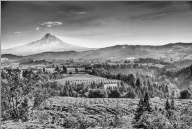
3rd Place Dick Chomitz "Mount Hood"