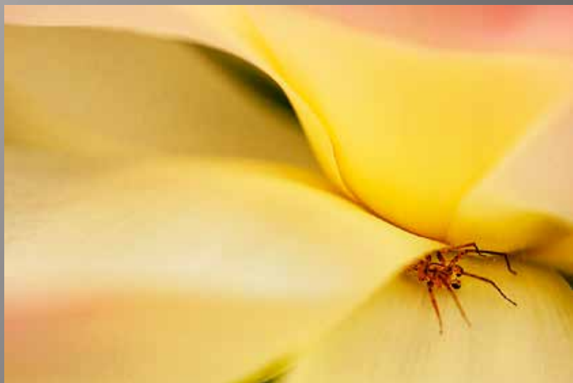
HM Chuck Gallegos "Lotus Position"