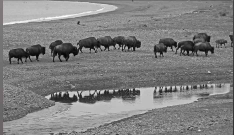
2nd Place Dolphy Fairhurst "On the Move"