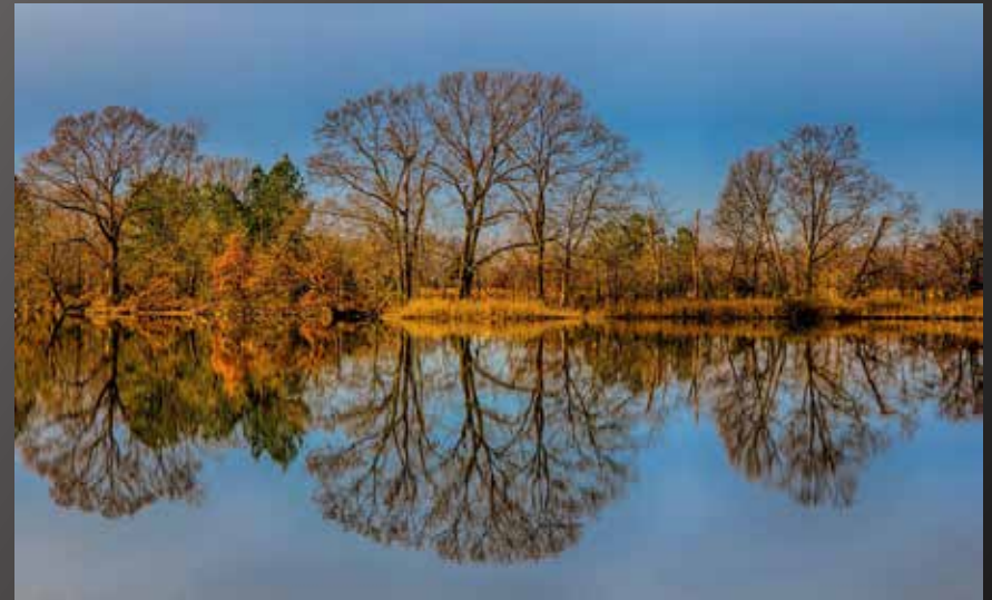
HM Ron Peiffer "Wye Island Cove"