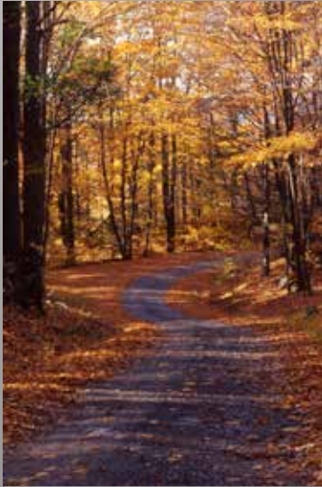
1st Place Dick Fairhurst "Down the Road and Around the Bend"