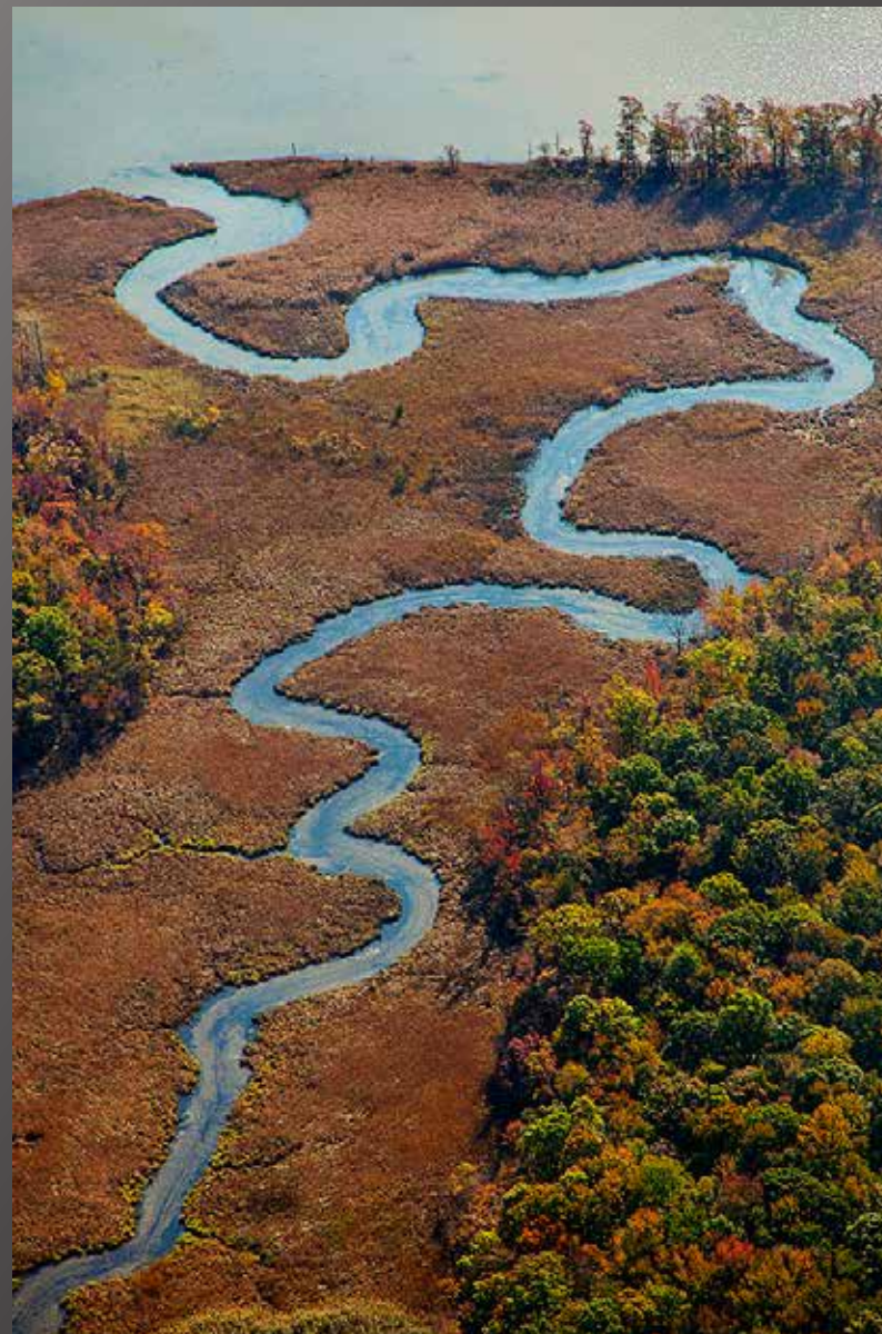
2nd Place Chuck Gallegos "Winding Creek"