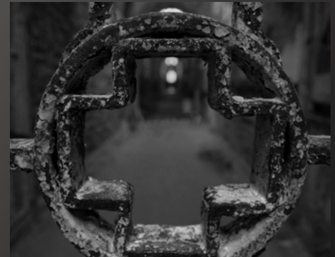
HM Vicki Pardoe "Cell Block 3"