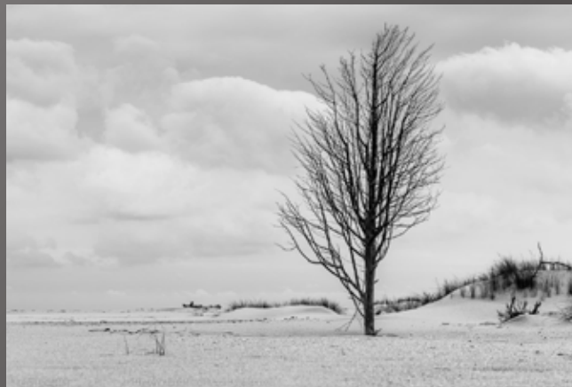
HM Chip Bulgin "Loaner"