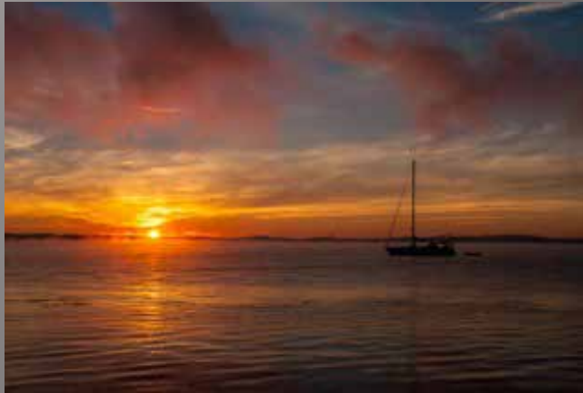
2nd Place Paul Ekstrom "Lazy Morning"