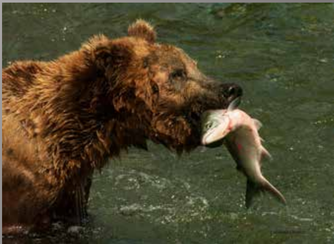
4th Place Dick Chomitz "Wild Salmon"