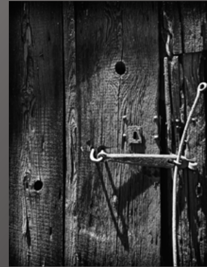
2nd Place Ron Peiffer "Barn Door Latch"