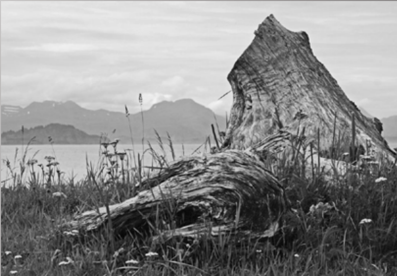
1st Place Dolphy Fairhurst "Stand Your Ground"