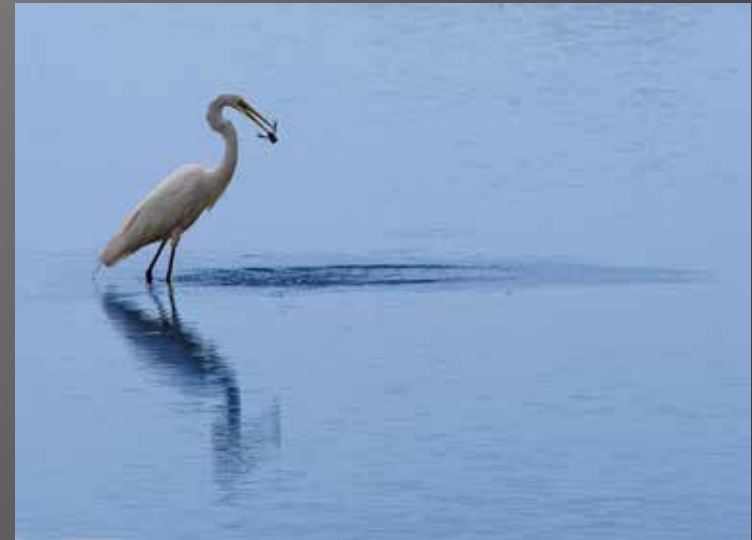
HM Russell Zaccari "Lunch 2"