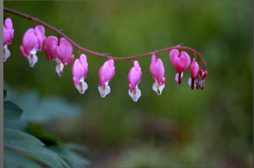
2nd Place Dick Fairhurst "Just Hanging Around"