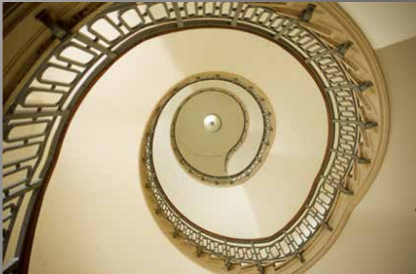
3rd Place Dolphy Fairhurst "Around We Go"