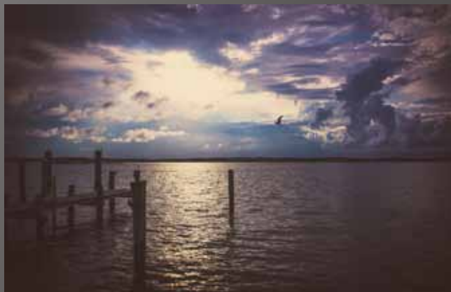
HM Reb Orrell Beep Beep