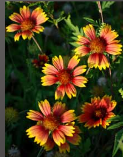
3rd Place Cathleen Steele Late Summer Daisies