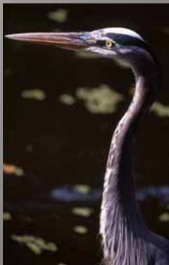
4th Place Chuck Gallegos Its a Stretch