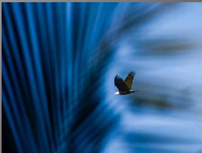
2nd Place Cliff Culp Flying Through the Fronds