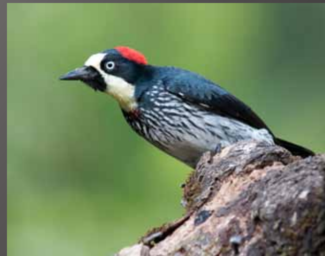
3rd Place Dawn Grannas Acorn Woodpecker