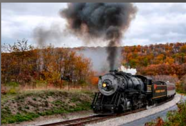
HM Dawn Grannas Helmstetters Curve