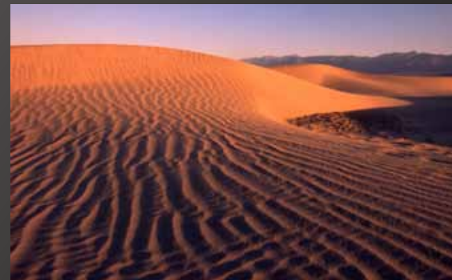
HM Chuck Gallegos Sandscape