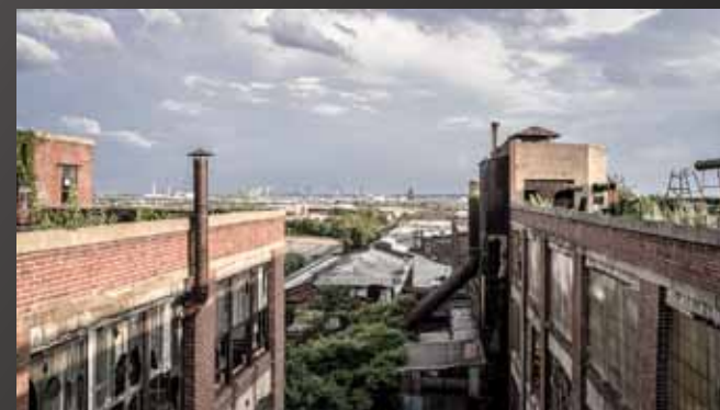
HM Chip Bulgin Reclaimed and Overgrown