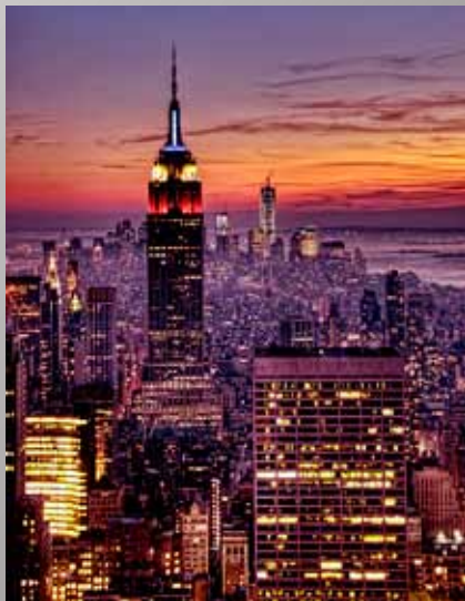
1st Place Reb Orrell Empire State Building at Dusk