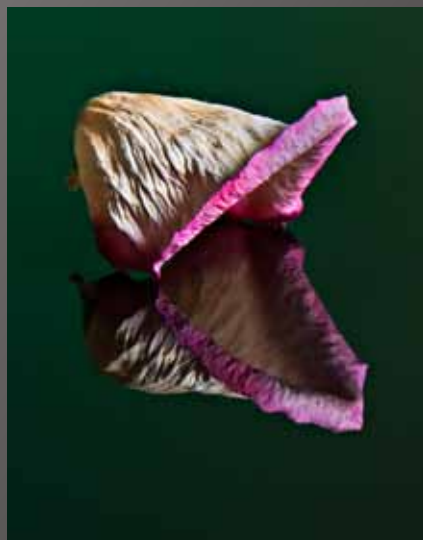
HM Mike Thomas Dying Rose Petal