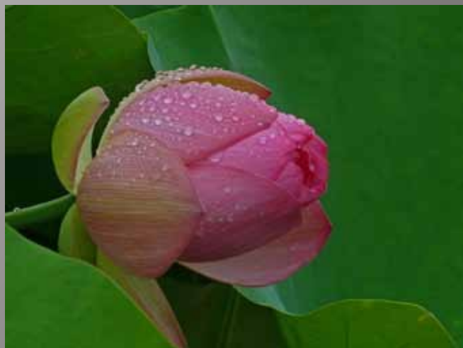
4th Place Dolphy Glendinning After the Shower