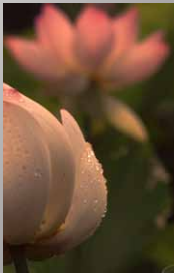
1st Place Chuck Gallegos Morning Dew