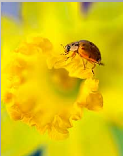
1st Place Chuck Gallegos Convolutud Path