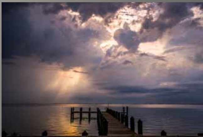
2nd Place Chip Bulgin Clearing Storm at Sunrise