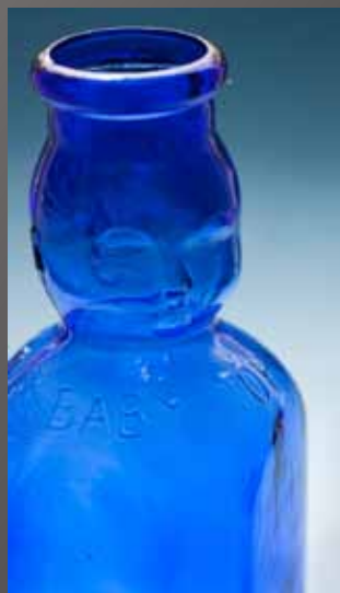
HM Mike Worsham Baby Top Blue Bottle