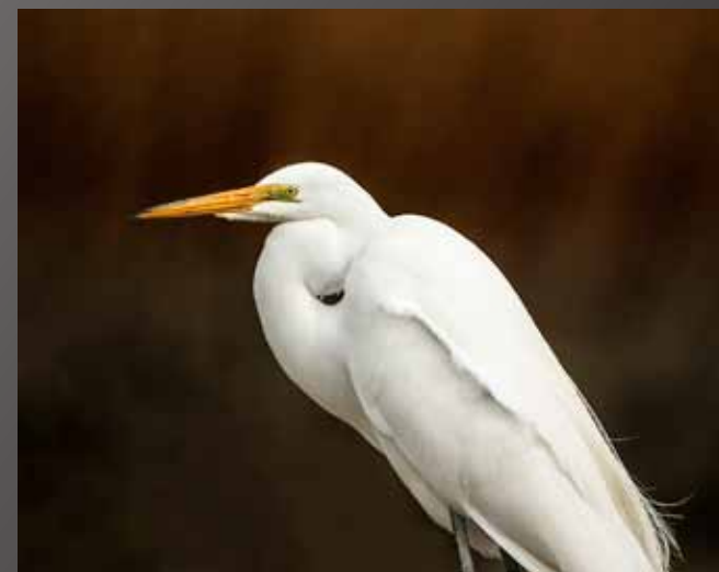
3rd Place Dawn Miller Egret Morning