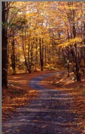
2nd Place Dick Fairhurst Down the Road and Around the Bend