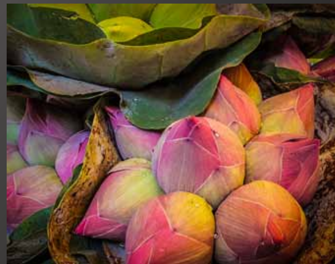
HM Donna Flynn The Lotus Market