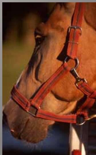
4th Place Dick Fairhurst Ready for Work