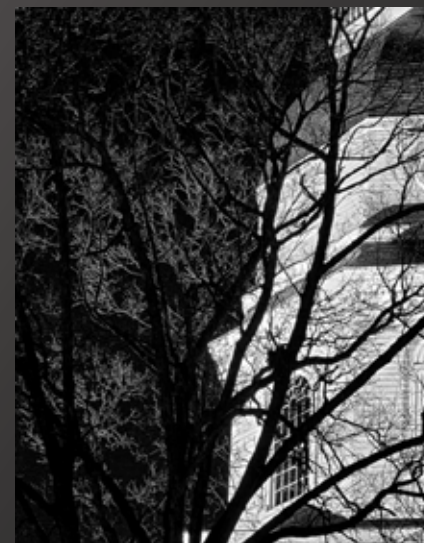
HM Ron Peiffer Statehouse at Night