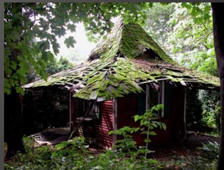
HM Chuck Gorum Green Garden Shed