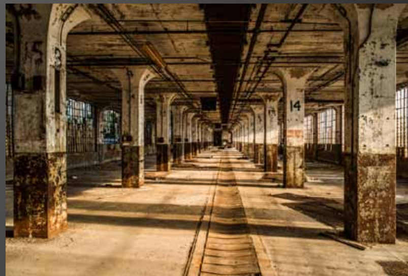
3rd Place Chip Bulgin Conveyor