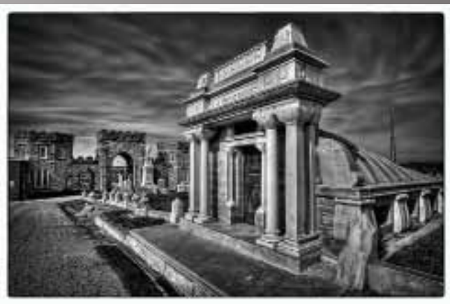
4th Place Reb Orrell Final Resting Place