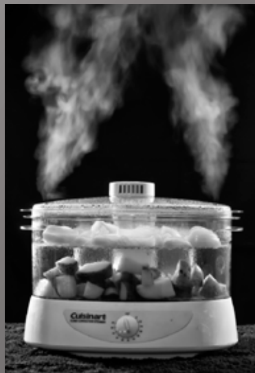
2nd Place Reb Orrell Steamed Potatoes and Onions