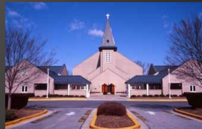
HM Charles Graf Hopi Lodge