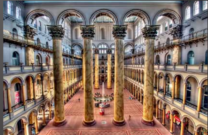
4th Place Reb Orrell National Building Museum