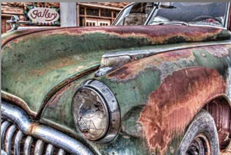
HM Ron Peiffer Cal Canyon Buick