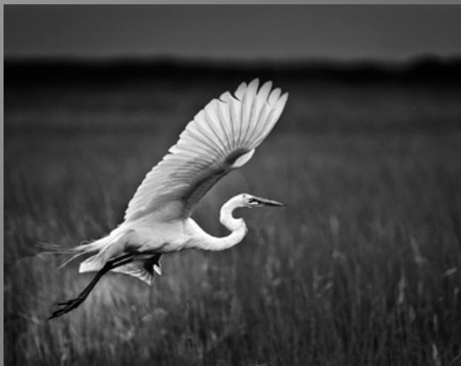
2nd Place Chuck Gallegos Egret Lift Off