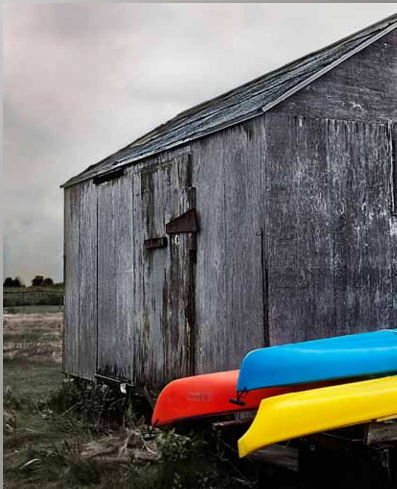
1st Place Chuck Gallegos CYM