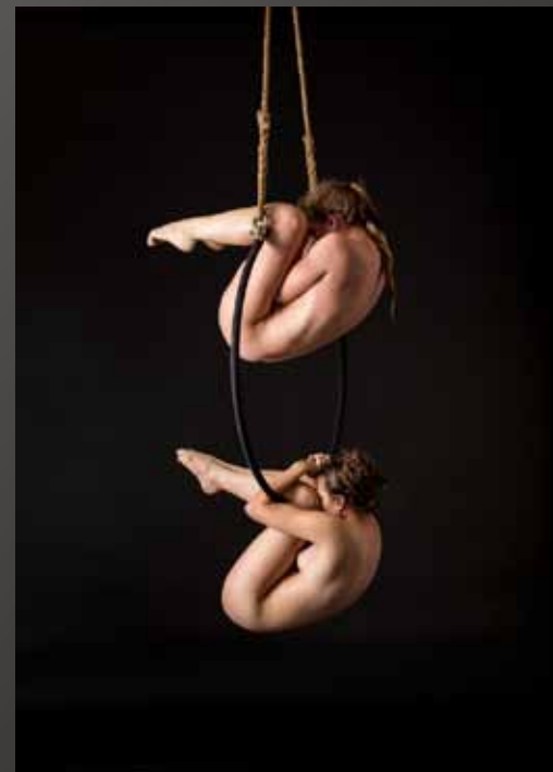
HM Chip Bulgin Synchronized