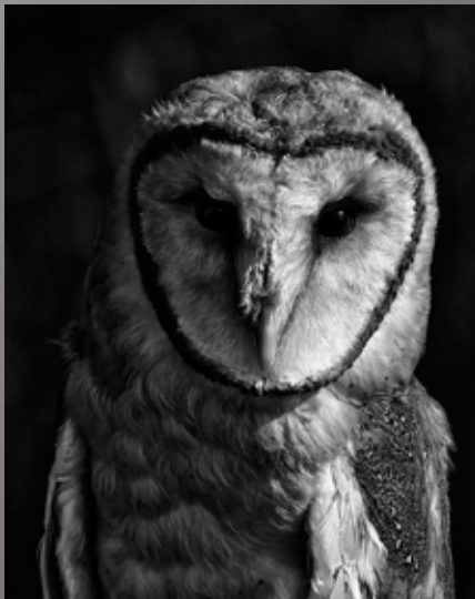
3rd Place Dawn Miller Barn Owl View