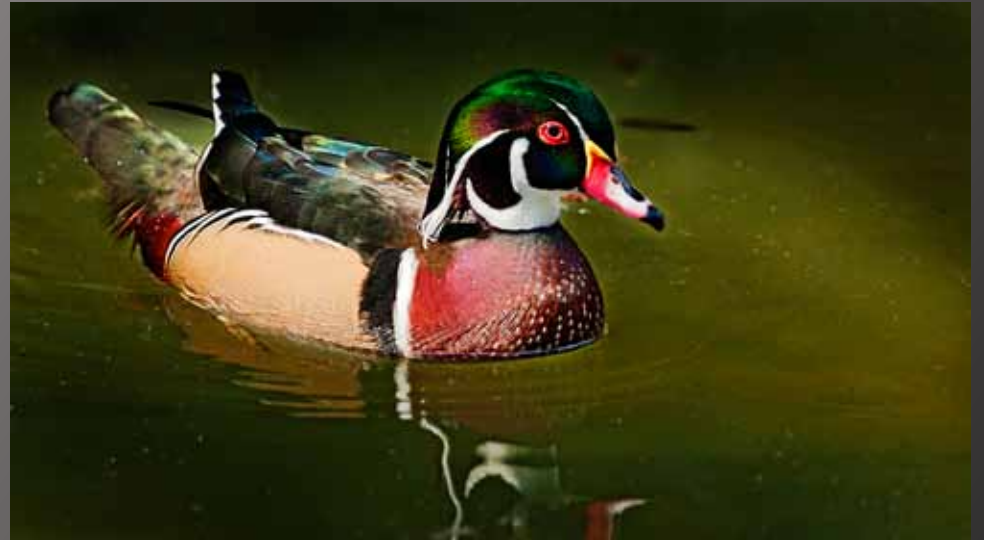
HM Chuck Gallegos Sylvan Wood Duck