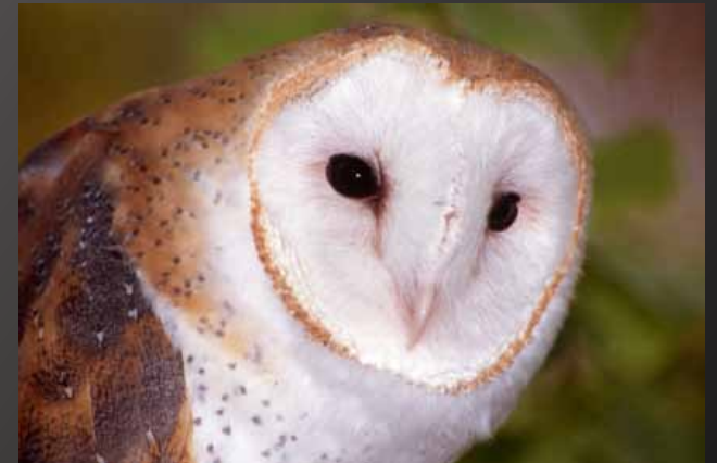
HM Sunny Frank Barn Owl