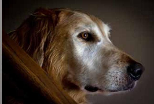
2nd Place Ken Claytor Lucky Dog