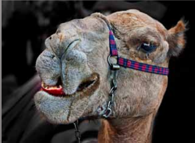
2nd Place Ernest Swanson Snack Time