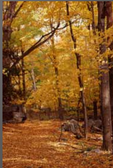
HM Dick Fairhurst Yellow Trail