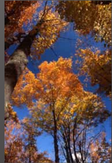
3rd Place Dick Fairhurst Tall Gold