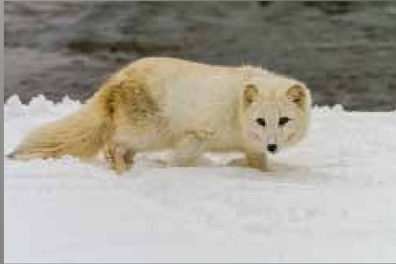
1st Place Dick Chomitz Thick Coat