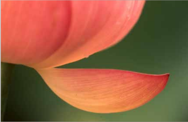
1st Place Chuck Gallegos Lotus Lines