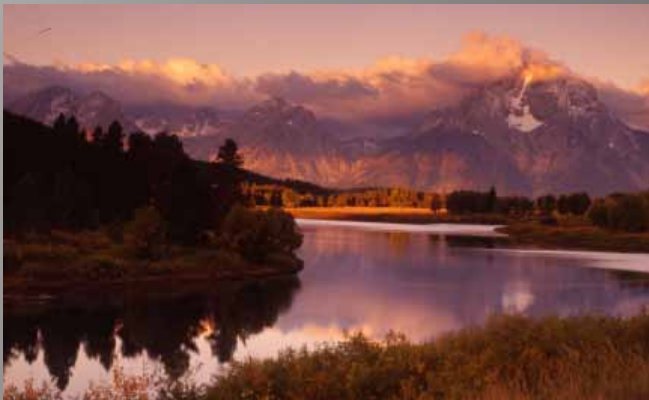
4th Place Chuck Gallegos First Light Mount Moran