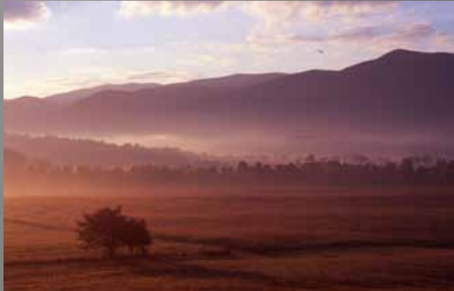
2nd Place Charles Graf Cades Cove Morning