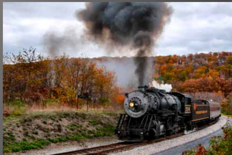
2nd Place Dawn Grannas Helmstetter's Curve