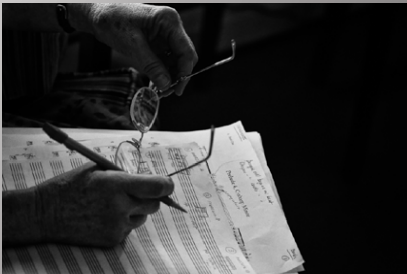
1st Place Brian Flynn Prelude 4