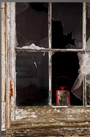
HM Chuck Gallegos Shattered