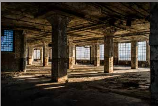
2nd Place Chip Bulgin Condemned