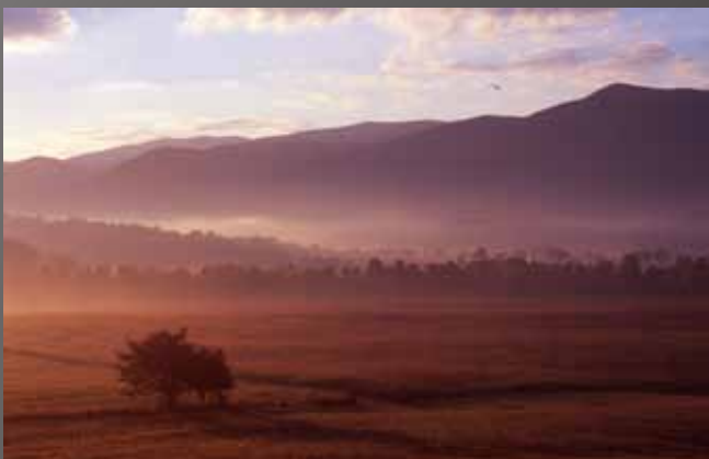
HM Charles Graf Cade's Cove Morning