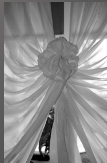
2nd Place Cathy Steele Curtain Art