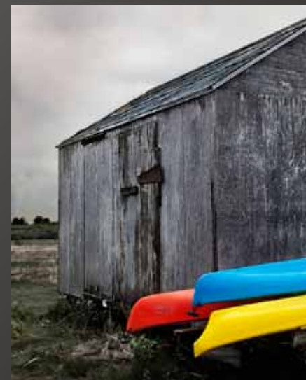
HM Chuck Galegos CYM