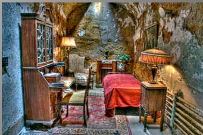
3rd Place Reb Orrell Big Al Slept Here