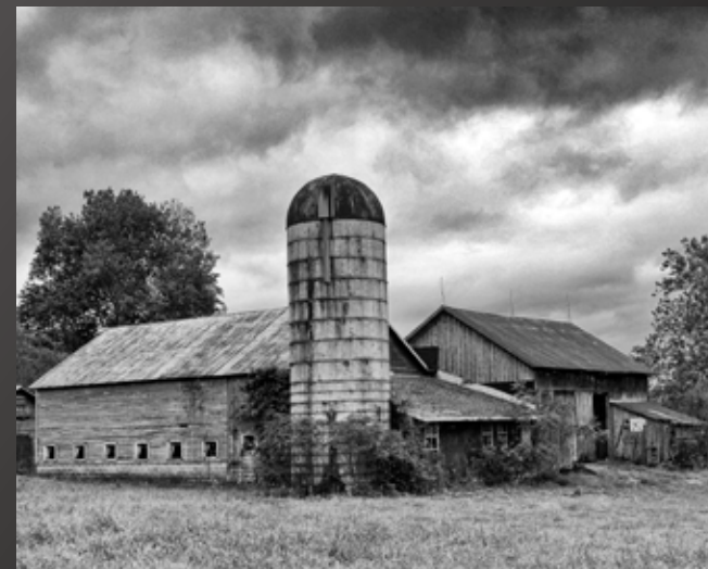
HM Vicki Pardoe Old Barn