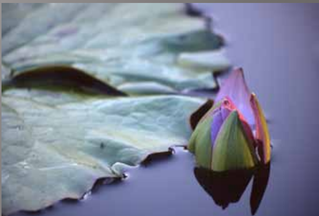
2nd Place Dolphy Glendinning Feed Me