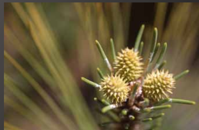
HM Dolphy Glendinning Pine Cone Explosion