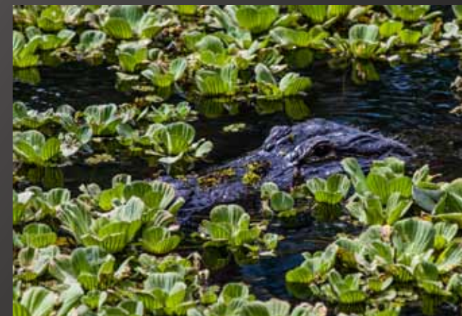
HM Cliff Culp Danger in the Pads