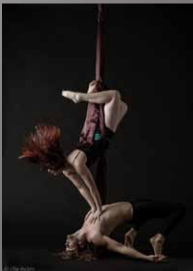
HM Chip Bulgin Lover's Leap