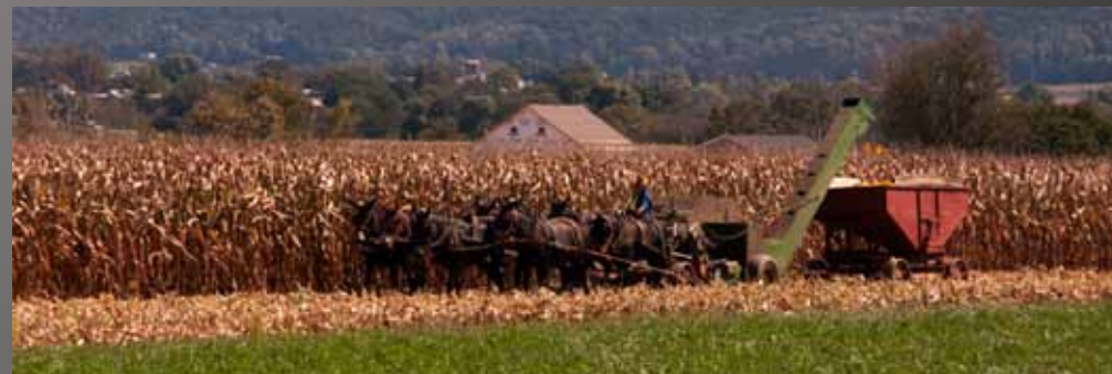
4HM Dawn Grannas Amish Harvest