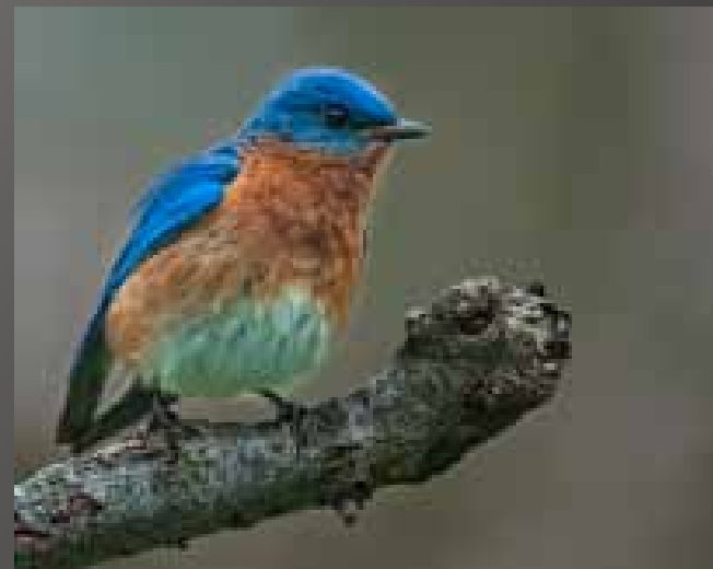
3rd Place Dawn Miller "Eastern Bluebird (Male)"