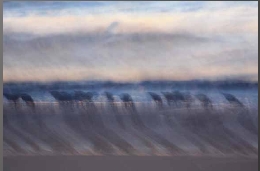
2nd Place Molly Balog "Ghost Pipers"