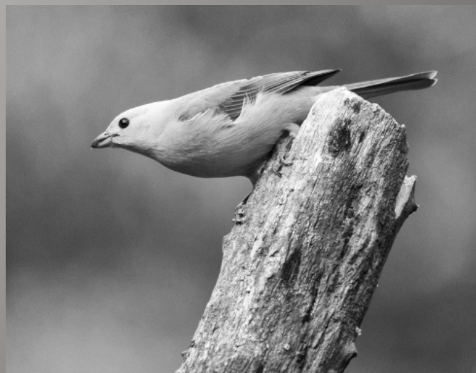
HM Dawn Grannas "Blue Grey Tanager"