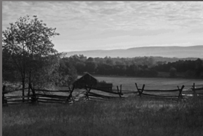
4th Place Dolphy Glendinning "Early Morning Farm"