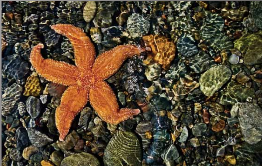
3rd Place Brian Flynn "Rock Star"