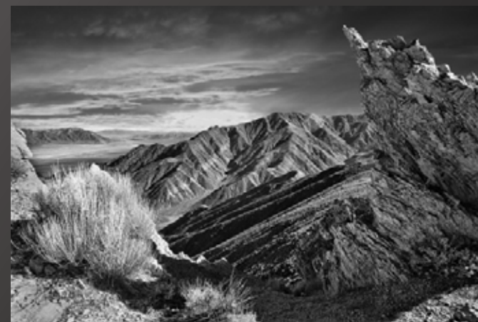
HM Chuck Gallegos "Aquereberry Point"