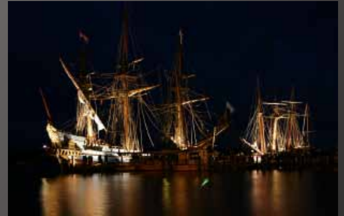
3rd Place Jackie Colestock "Downrigging Display"