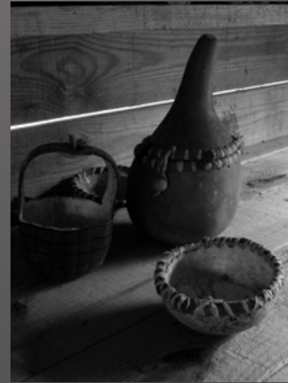
2nd Place Dolphy Glendinning "Gourd Work"