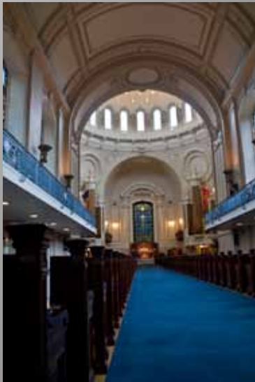
1st Place Dolphy Glendinning "Chapel"