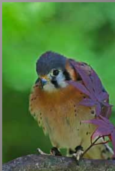
4th Place Dolphy Glendinning "Bad Hair Day"