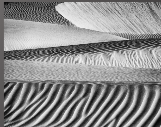
3rd Place Chuck Gallegos "Ripples"