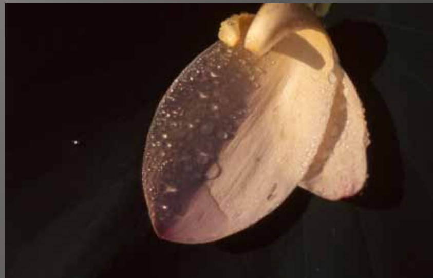
2nd Place Dolphy Glenndinning "Morning Bath"