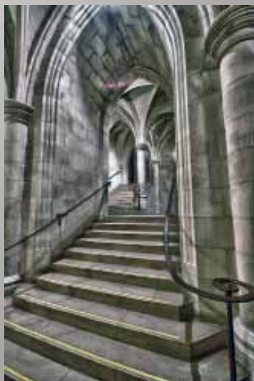
1st Place Reb Orrell "National Cathedral Staircase"