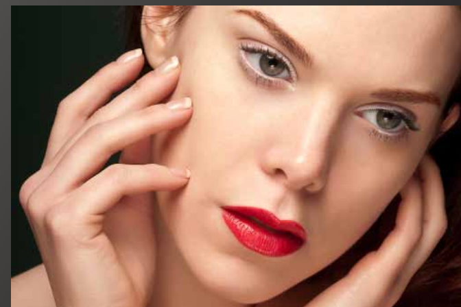
HM Chip Bulgin "Vaunt"