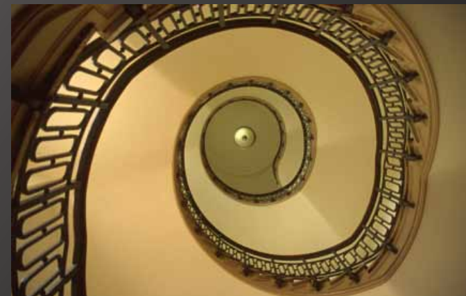
HM Dolphy Glendinning "Round & Round We Go"