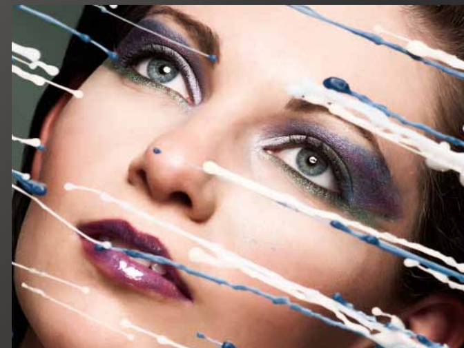
HM Chip Bulgin "Melt"