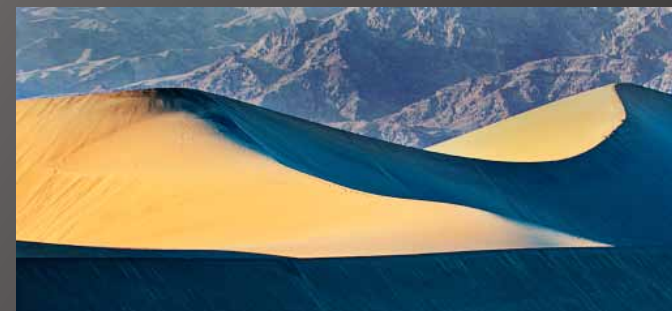
3rd Place Chuck Gallegos "Mesquite Dunes Sunset"