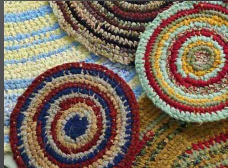
4th Place Dolphy Glendinning "Circles of Color"