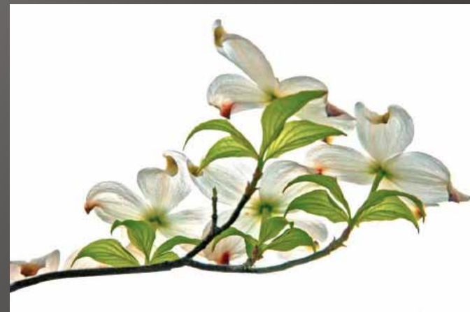
3rd Place Ernie Swanson "Spring"