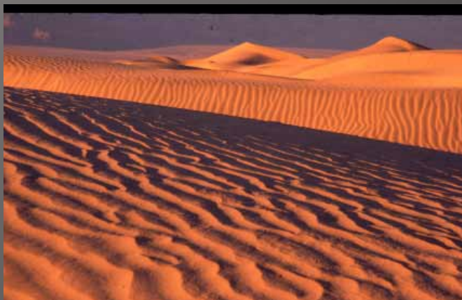
4th Place Chuck Gallegos "Dunescape"