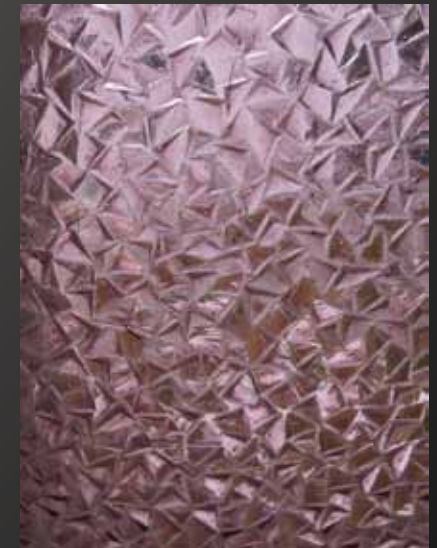
HM Dawn Grannas - "Pink Glass"