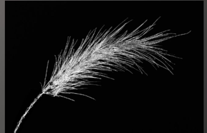
3rd Place Chuck Gallegos - "Winter Grain"