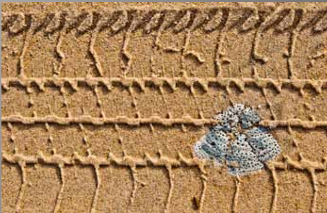
4th Place Chip Bulgin - "Road Kill"