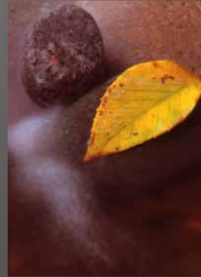
2nd Place - Chuck Gallegos - "Stream Side"