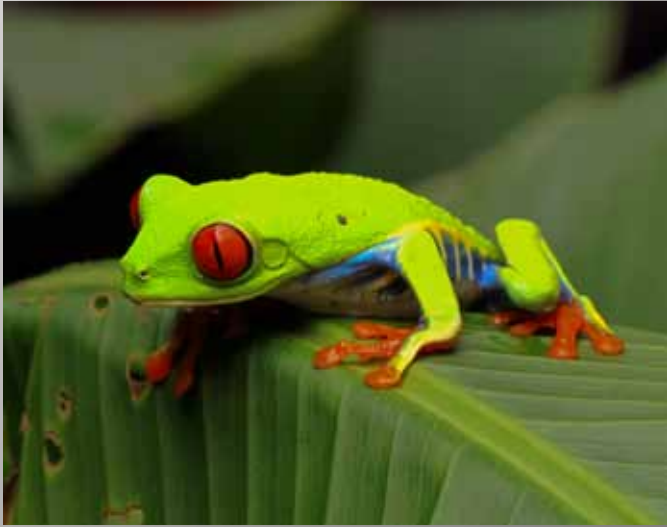
1st Place Dawn Grannas "Red Eyed Tree Frog"