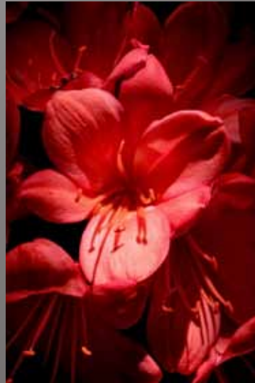
2nd Place Reb Orrell - "Soft Light"