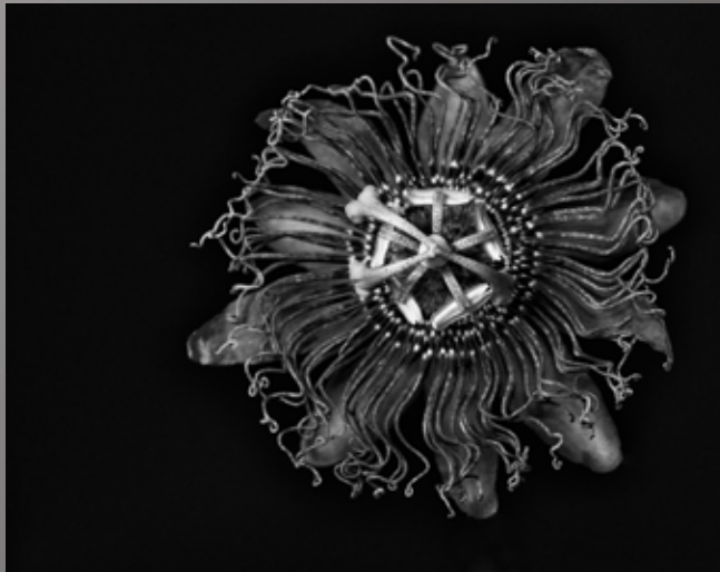
2nd Place Dawn Grannas - "Passion Flower"