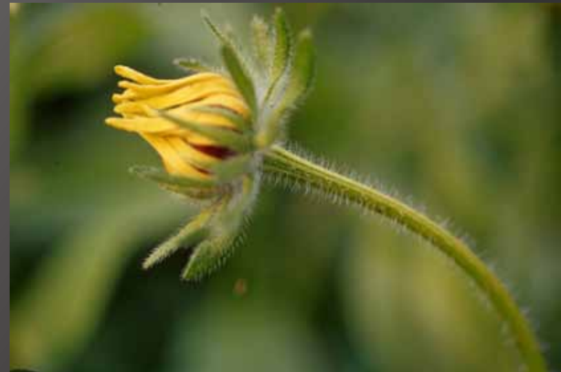
4th Place - Dick Fairhurst - "Pucker Up"