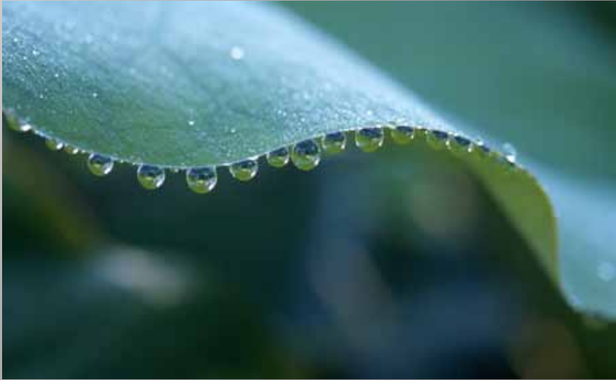
1st Place - Dolphy Glendinning - "Drops on the Edge"