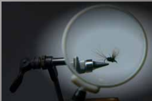
4th Place Dick Chomitz - "Haystack Under Glass"