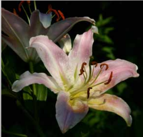
1st Place Jackie Colestock - "Day Lily in Sunlight"