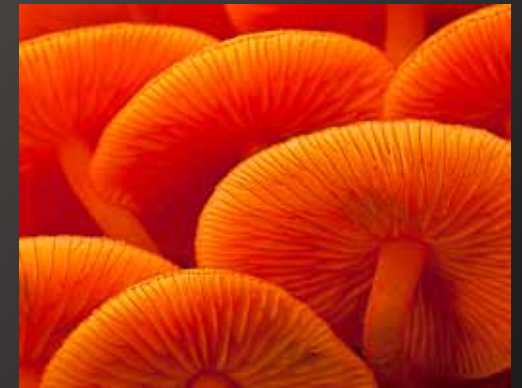
HM Chuck Gallegos "Orange Canopy"