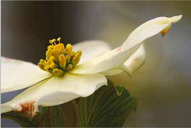
1st Place Chuck Gallegos - "Fresh Blossom"