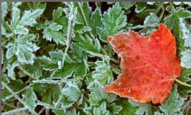
HM Dolphy Glendinning - "Jack's Work"