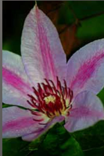
HM Randall Griffin - "Brookside Flower"