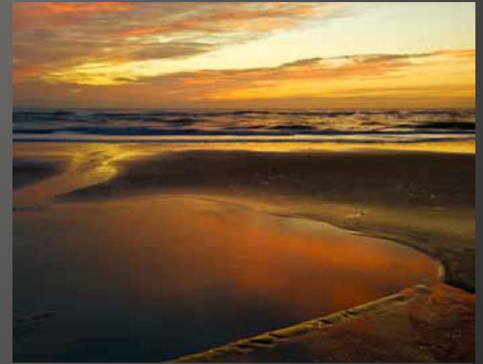
3rd Place Bob Miller - "First Light Ocean Tidal Pool"