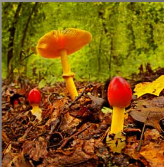
2nd Place Chuck Gallegos - "Emergence"