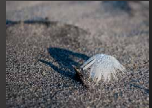
HM Chip Bulgin - "Feather on the Beach"