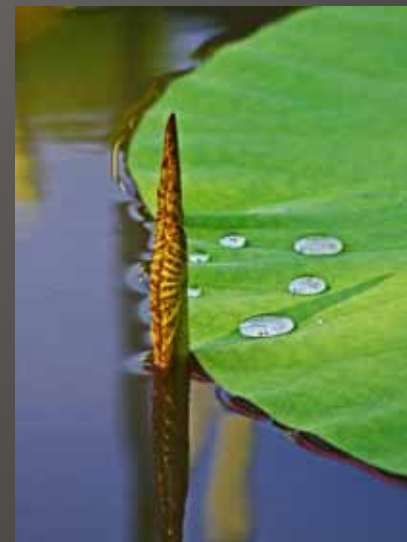
3rd Place Dolphy Glendinning - "Up From the Water"