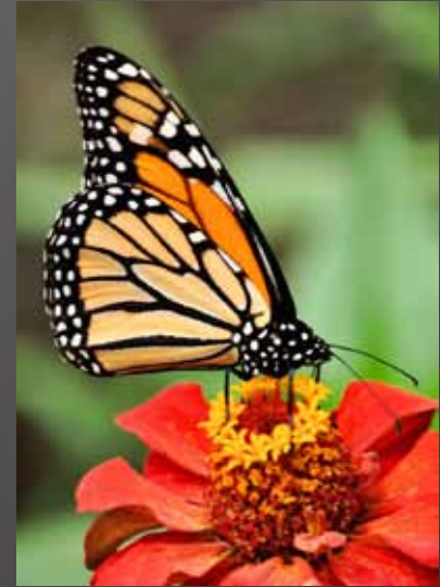
3rd Place Reb Orrell - "Brookside Butterfly"