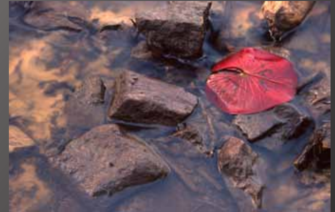
3rd Place Chuck Gallegos - "Lily Leaf"