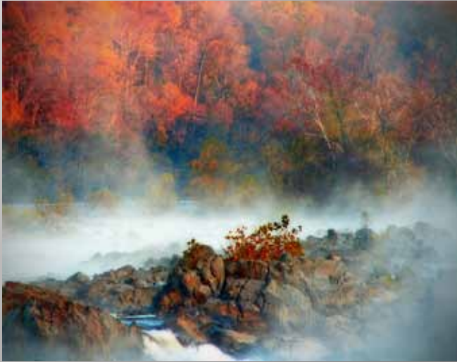
1st Place Randall Griffin - "Morning at Great Falls"