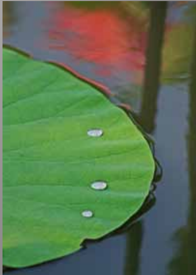
4th Place Dolphy Glendinning - "Morning Dew"