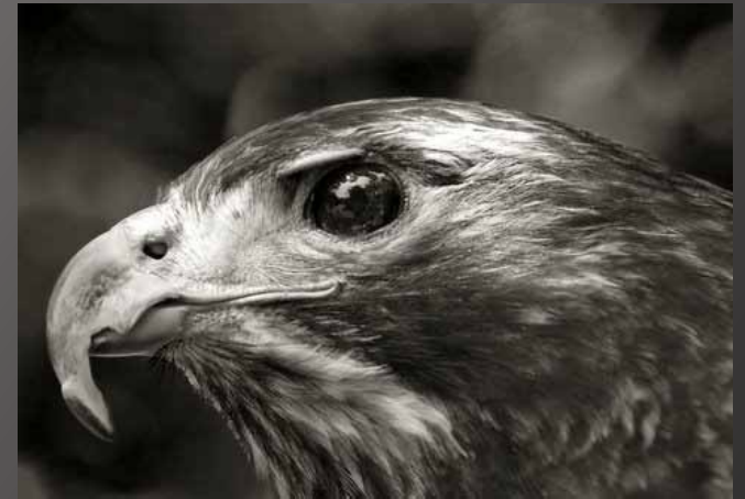
3rd Place Tim Champney - "Bird's Eye View"