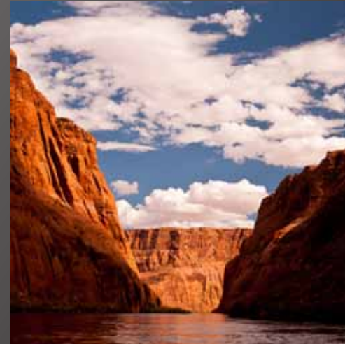
HM Chip Bulgin - "Boxed In"