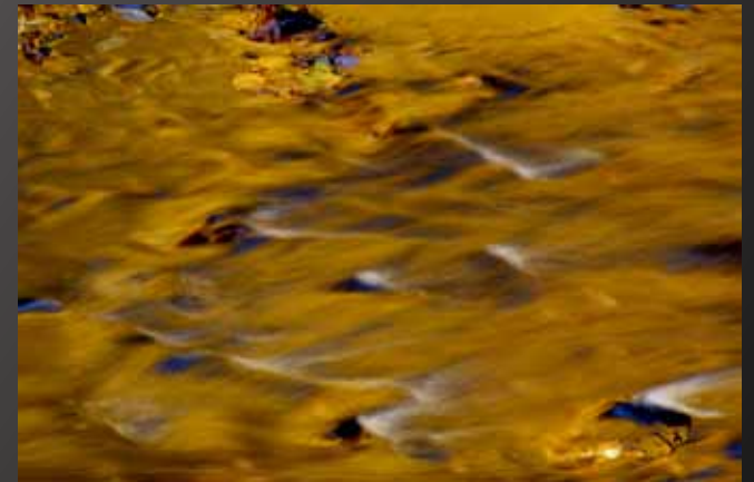
HM Dick Fairhurst - "River of Gold"