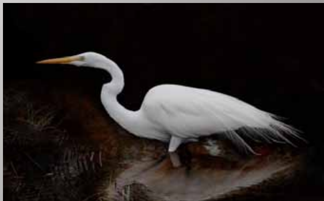
1st Place Cliff Culp - "Night Stalker"