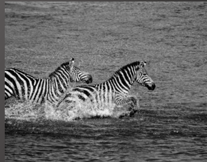
4th Place Dawn Miller - "Dangerous Crossing"