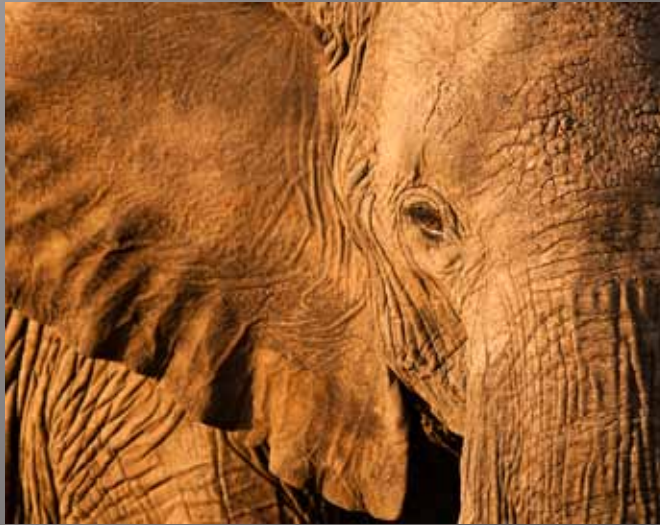
2nd Place Dawn Miller - "African Evening"