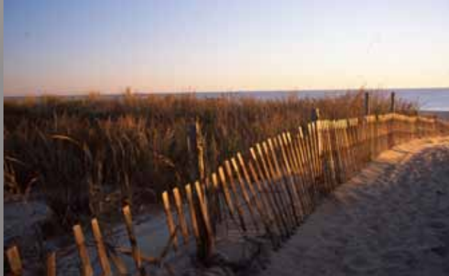
2nd Place Dolphy Glendinning - "Down to the Beach"