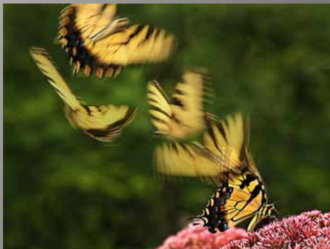
4th Place Chuck Gallegos - "Lift Off"