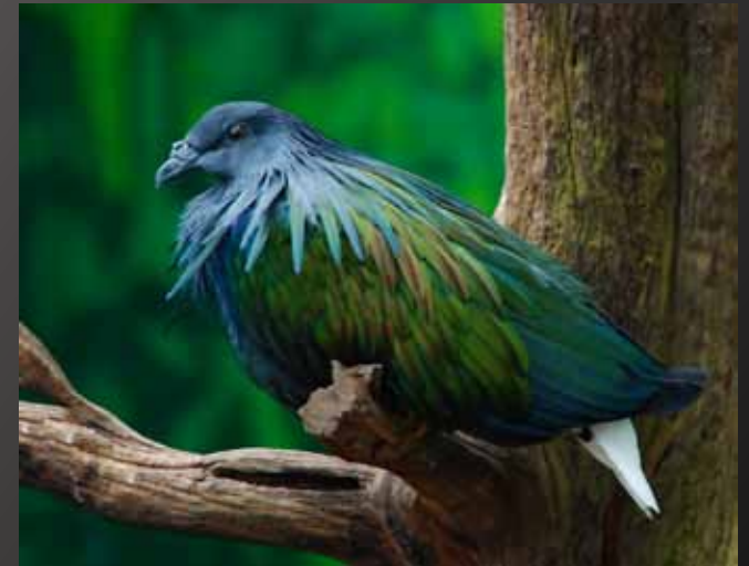
HM Dawn Grannas - "Nicobar Pigeon"