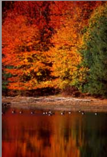
4th Place Dick Fairhurst - "Honkers Heaven"