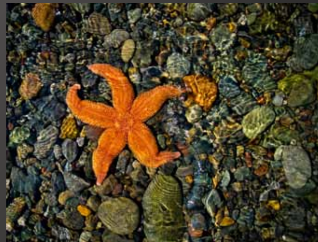
HM Brian Flynn - "Rock Star"