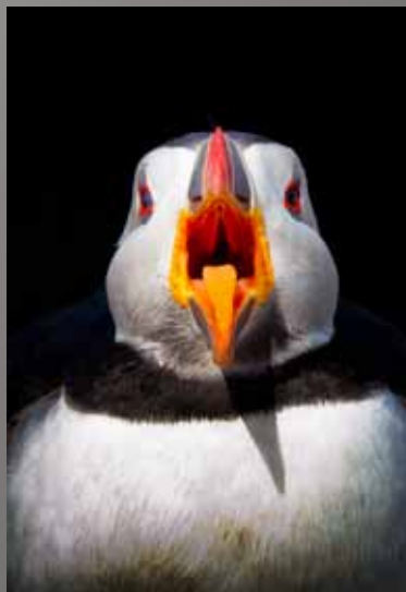
2nd Place Brian Flynn - "Pissed off Puffin"