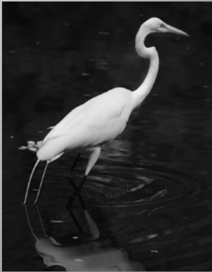
1st Place Chuck Gallegos - "The Egret's Walk"