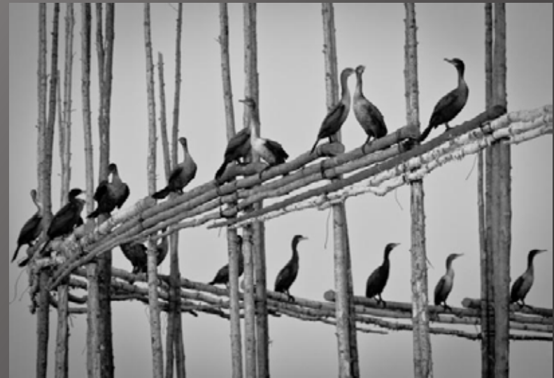
2nd Place Brian Flynn - "Bird on a Weir"