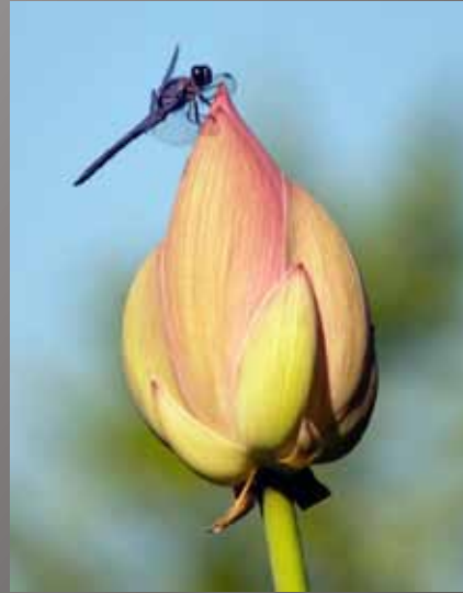
2nd Place Dawn Grannas - "Dragonfly on Lotus"