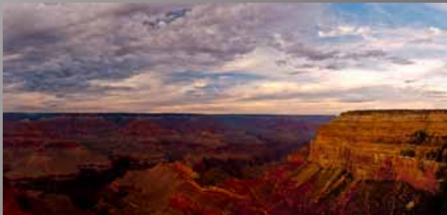
4th Place - Chip Bulgin - "Last Light on the South Rim"