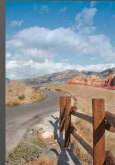
3rd Place - Dennis Balog - "Go Tell it on the Mountain"