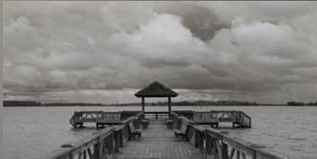
2nd Place - Randall Griffin - "Summer Storm"