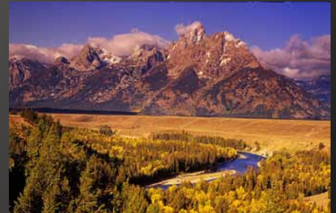
HM - Chuck Gallegos - "Snake River Overlook"