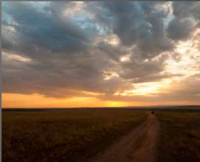
HM - Dawn Miller - "African Gold"