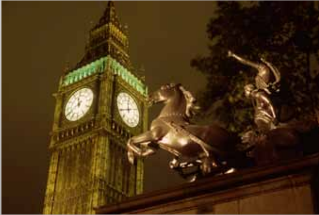
2nd Place - Reb Orrell - "Big Ben"