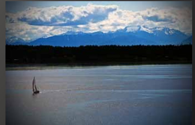
HM - Randall Griffin - "Sailing from Olympus"