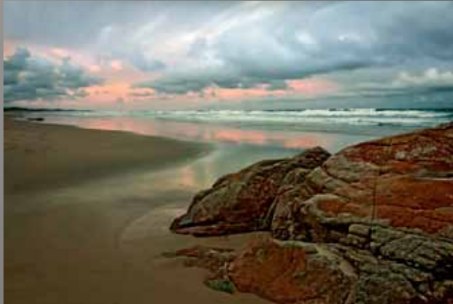
2nd Place - Bob Miller - "Coolum Beach II"