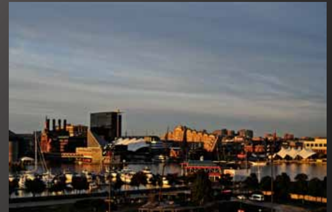
HM - Paul Ekstrom - "Gold Waterfront"