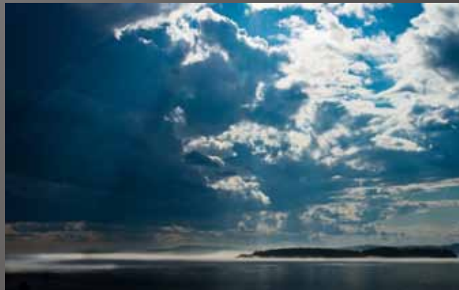
HM - Brian Flynn - "Burning off the Fog"