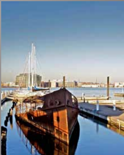
4th Place - Ron Peiffer - "Rusted"