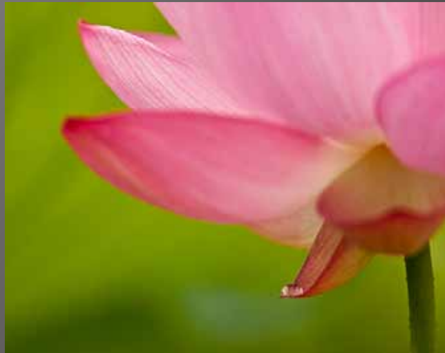
HM - Chuck Gallegos - "Lotus Drop"