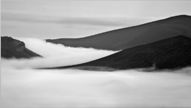
1st Place - Chuck Gallegos - "River of Fog"