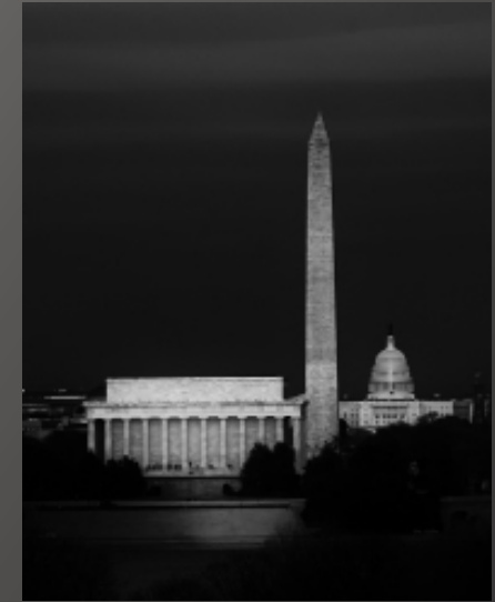
3rd Place - Dawn Grannas - "Capitol at Night"