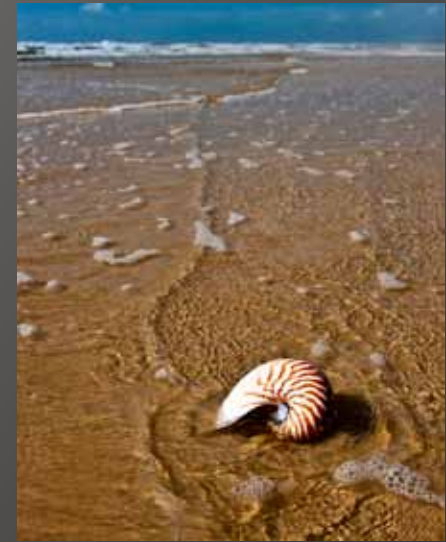
3rd Place - Dawn Miller - "On the Beach"