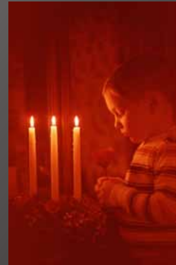
3rd Place - Reb Orrell - "Soft Light"