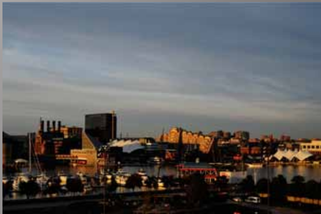
4th Place - Paul Ekstrom "Late Afternoon"