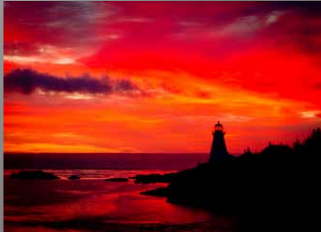
2nd Place - Brian Flynn - "Sailor's Warning"