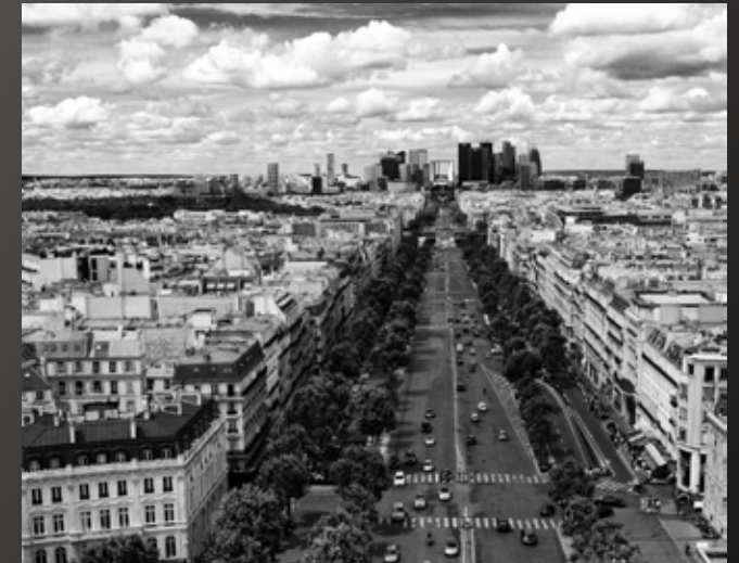
HM - Dawn Miller - "View of Paris"