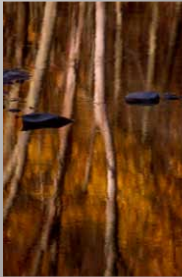
1st Place - Dick Fairhurst - "Rocks and Reflections"