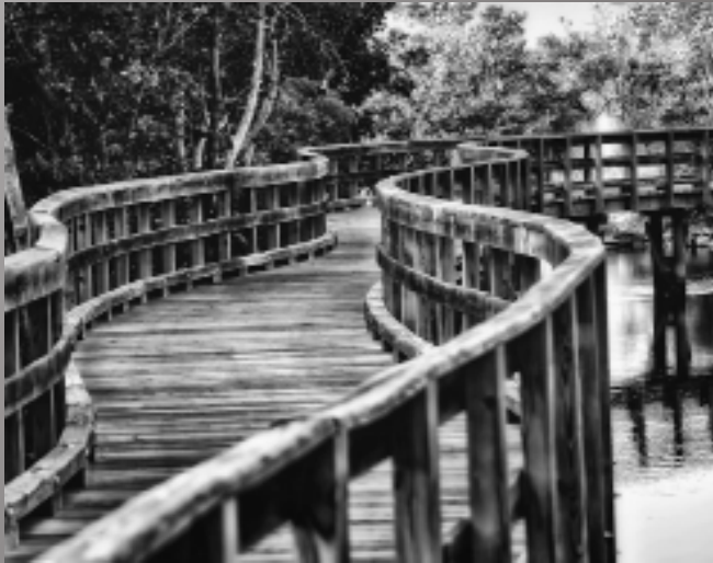
4th Place - Dawn Grannas - "Marsh Boardwalk"