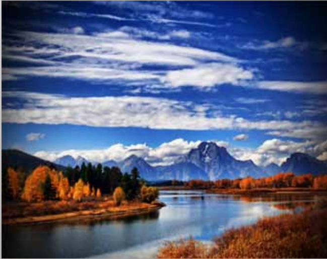
1st Place - Randall Griffin - "Tetons"