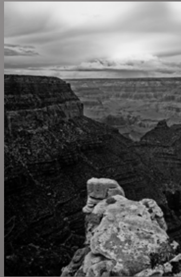
2nd Place - Chip Bulgin - "Outcrop"