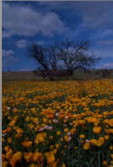
4th Place - Tom Henderson - "Desert Bloom"