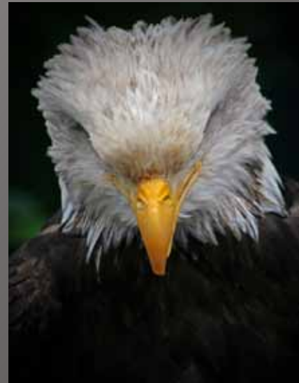
3rd Place - Randall Griffin - "Eagle Bow"