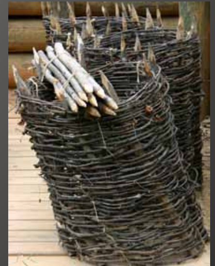
4th Place - Jackie Colestock - "Gabions"