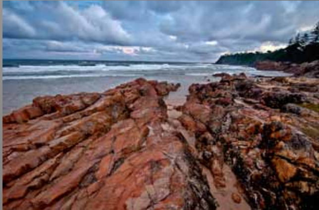
2nd Place - Bob Miller - "Coolum Beach, Australia"