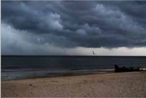
1st Place - Paul Ekstrom - "Summer Storm"