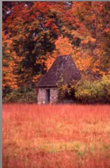
4th Place - Dolphy Glendinning - "Anyone Home?"