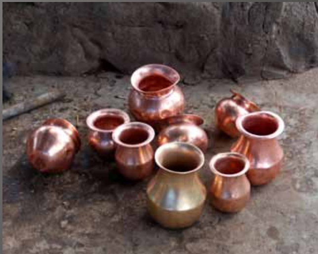
HM - Cathleen Steele - "Vessels at Rest"