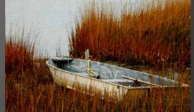
3rd Place - Sara McNeely - "Chincoteague Dinghy"