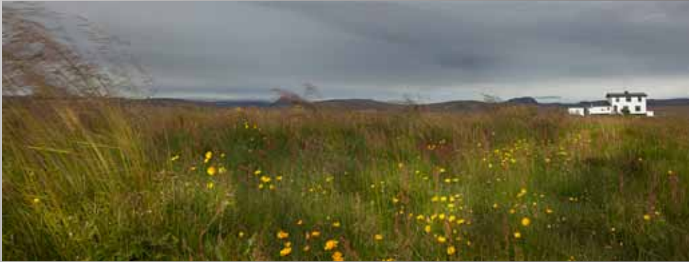
1st Place - Chuck Gallegos - "Windswept Farm"