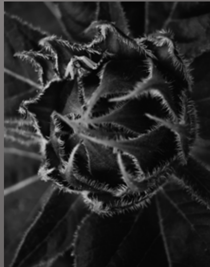
HM - Dawn Grannas - "Spider on Sunflower Bud"