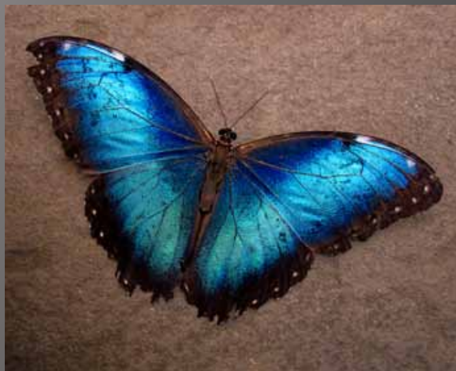
HM - Dawn Grannas - "Blue Morpho"