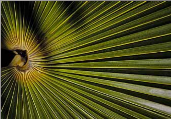
4th Place - Ernest Swanson - "Fan"