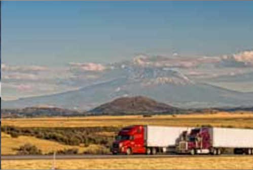
2nd Place - Dick Chomitz - "Truck Race"