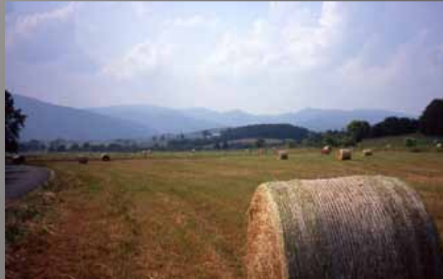
2nd Place - Chip Bulgin - "Mountain Hayfield"