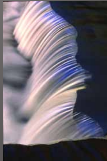
HM - Chuck Gallegos - "Water Ribbons"