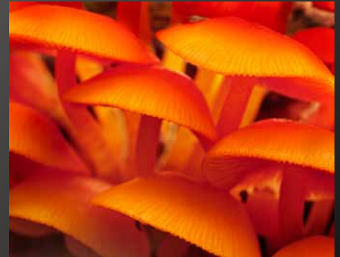
HM - Chuck Gallegos - "Caps"