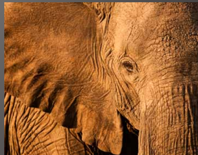
3rd Place - Dawn Miller - "African Evening"