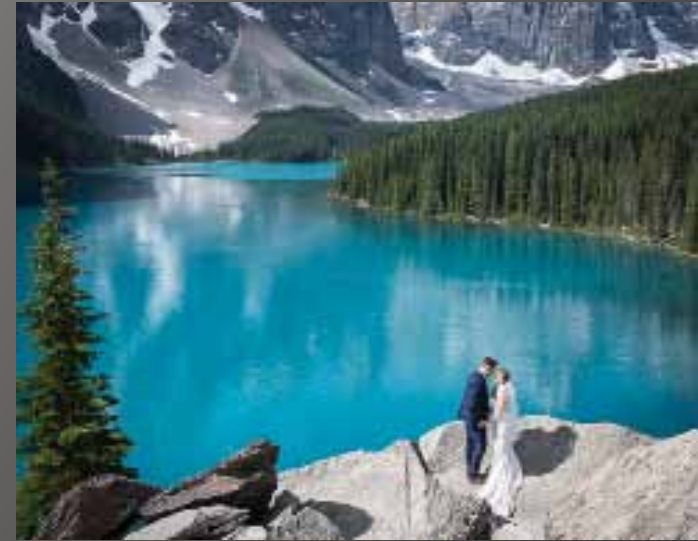
HM - Cathy Hockel "Wedding at Marain Lake"