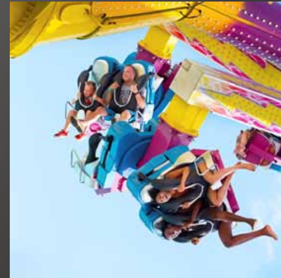
HM - Ernie Swanson "Fun"