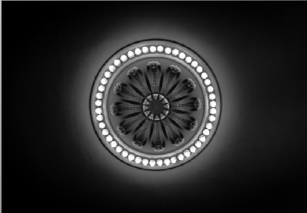
2nd Place - Jackie Colestock "Meditation"