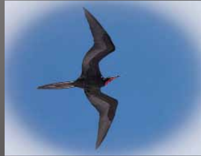
2nd Place - Cathy Hockel "Male Frigate in Flight"