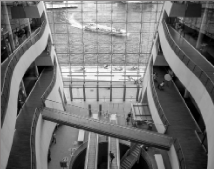
HM - Greg Hockel "Speeding Tour Boat"