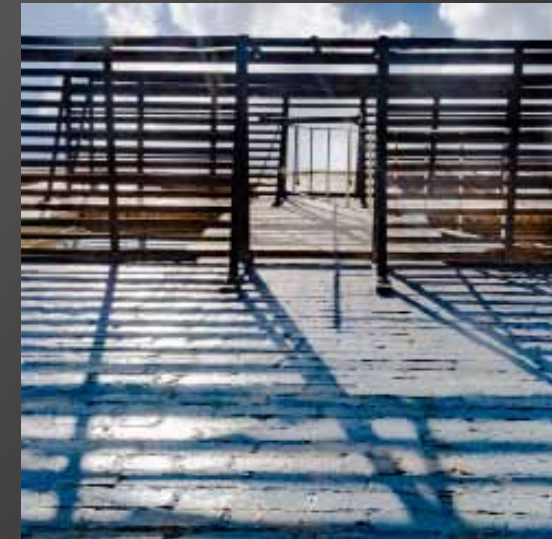
4th Place - Greg Hockel "Fire Escape"