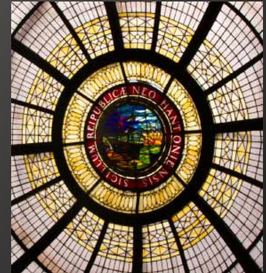
HM - Jackie Colestock "Hidden Gems"