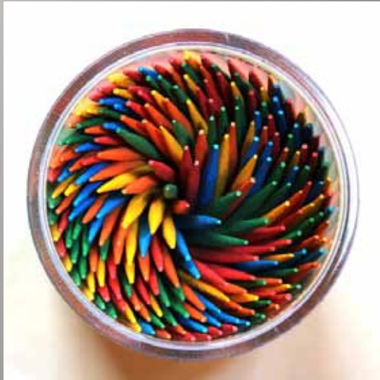
4th Place - Bob Webber "228 Tooth Picks"