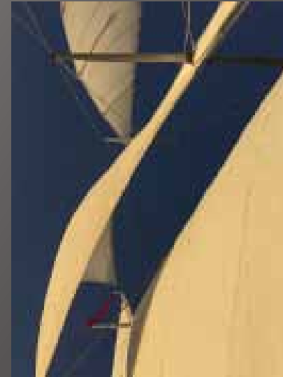
2nd Place - Cheryl Kerr "Sunset Sails"