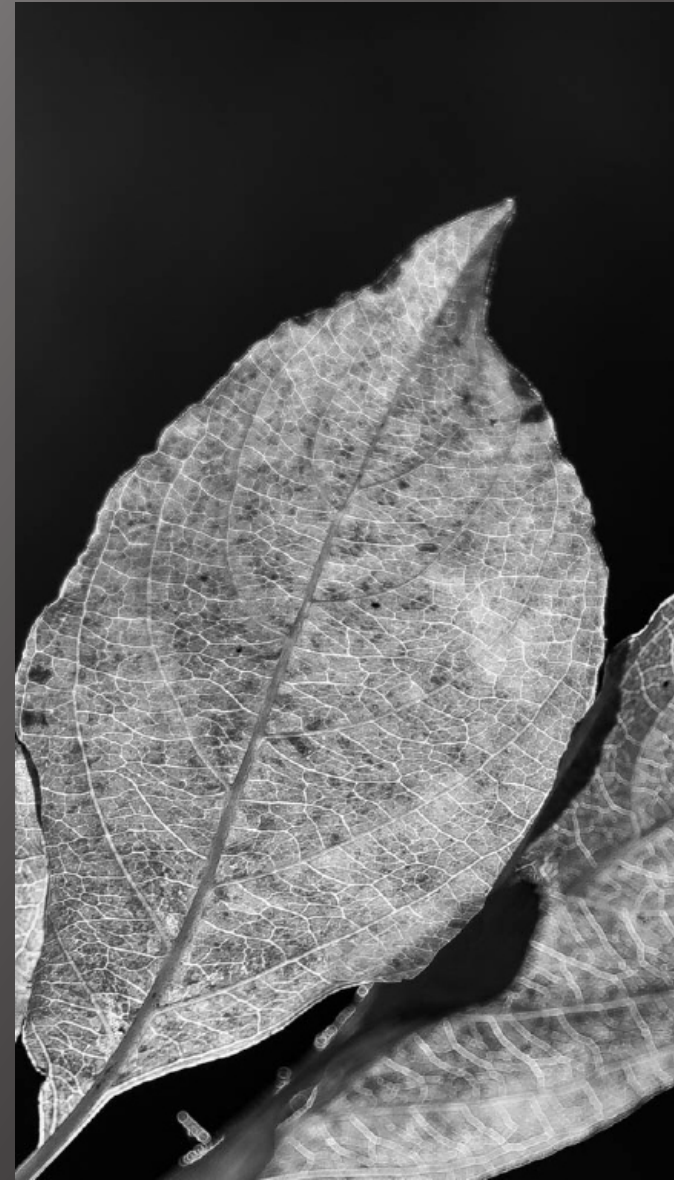
3rd Place - Louis Sapienza "Leaf Veins"