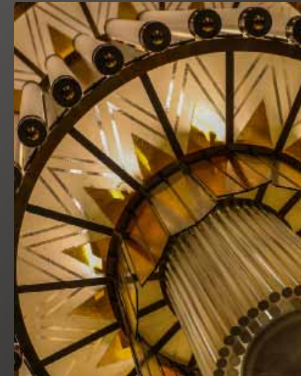
HM - Ron Peiffer "New Yorker Hotel Lobby Light"