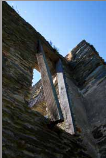
3rd Place - Jackie Colestock "Ruin"