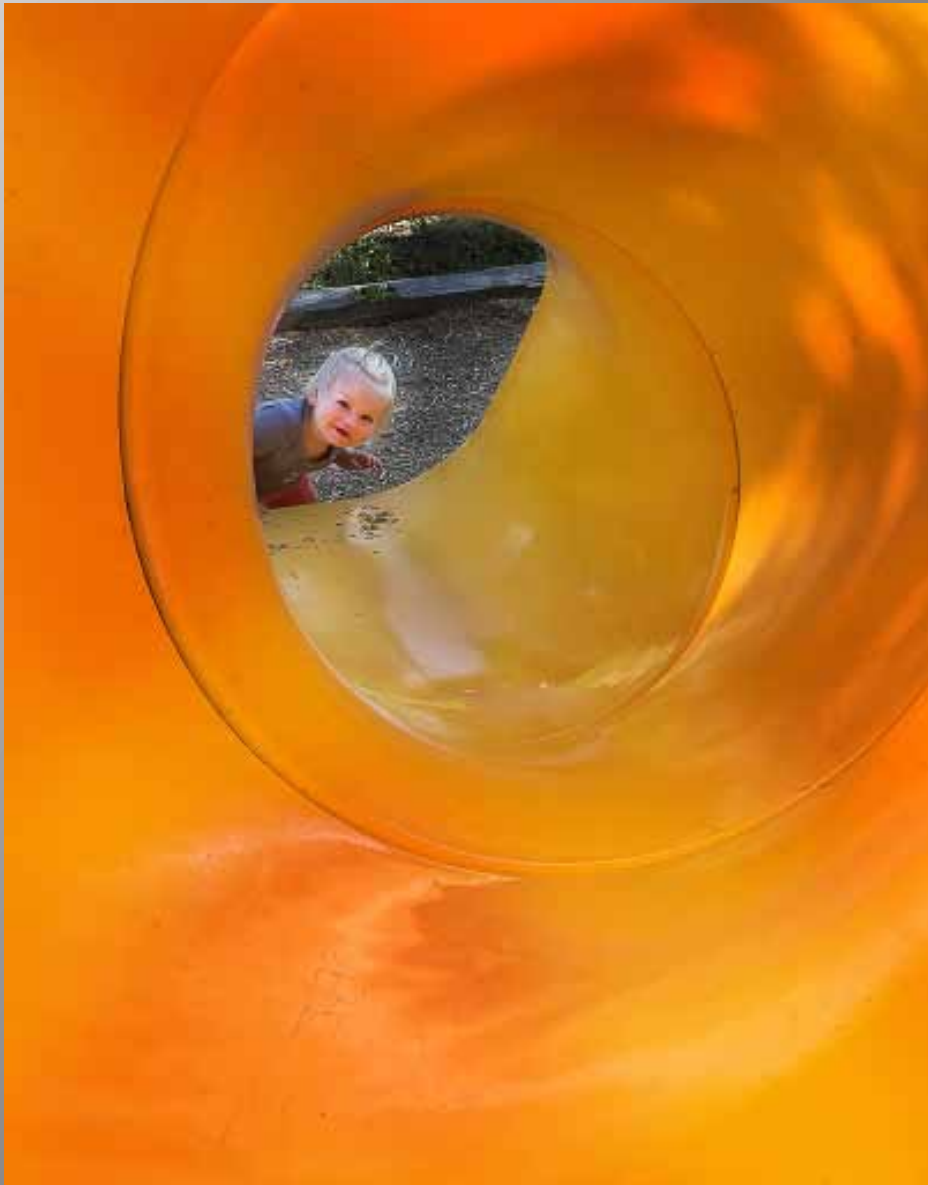
1st Place - Chuck Gallegos "Down the Tube"