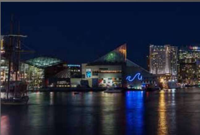
HM Cathy Hockel “Inner Harbor Night”