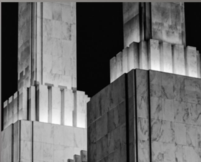
2nd Place Greg Hockel "The Two Towers"