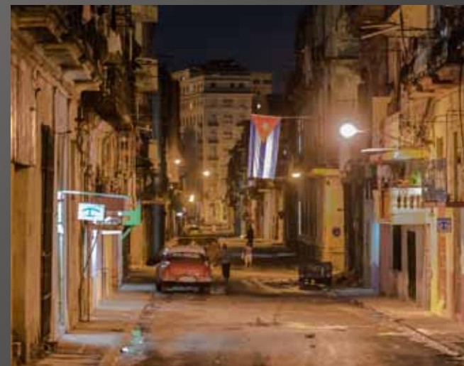
3rd Place Greg Hockel “The Wrong Side of Town”