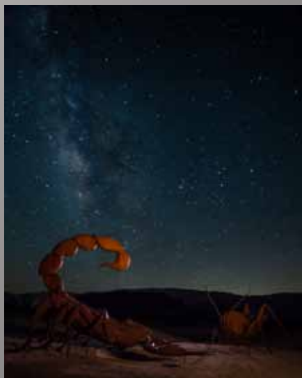
4th Place Chip Bulgin "Scorpio"