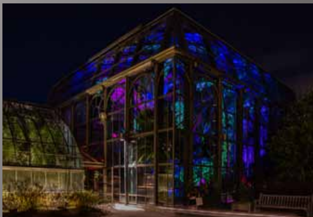
2nd Place Ron Peiffer "Night Glow"