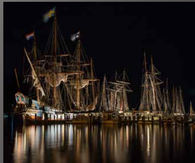
2nd Place Ron Peiffer “Harbor Lights”