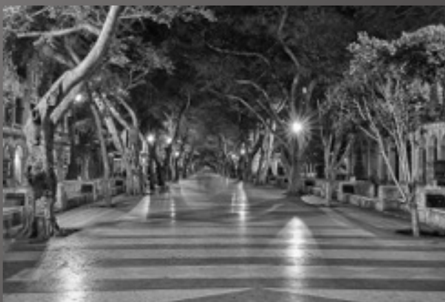
HM Cathy Hockel "The Boulevard"