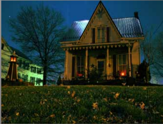
2nd Place Bob Webber "House by Moon Light"