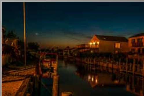
4th Place Paul Eckstrom "Bay Canal"