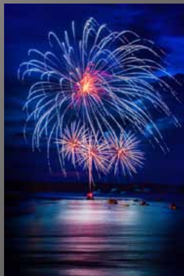
HM Brian Flynn "July 4th Celebration"