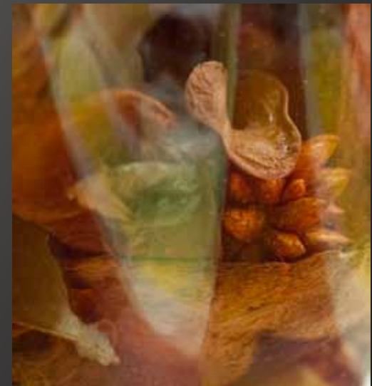
HM Jackie Colestock "Under Glass"