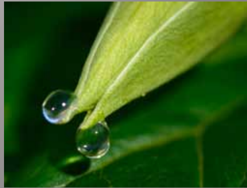
Example of Macro Photography

The geometric shape/pattern can be made of anything. Lines, circles, squares, triangles, etc. Abstract works are not allowed, the geometric shape must be something present in the real world, something that we've seen and shot. It must be a characterizing element of the picture, but doesn't need to be the only subject of it. The trick is in learning to find objects with appealing shapes and to capture them in an equally appealing way. Organic shapes occur frequently in nature (hence the name). They include curves, such as those you might see in the petal of a flower, and irregular shapes such as those you might see on a rock face. Geometric shapes, on the other hand, are straight