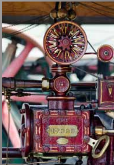
4th Place Russ Zaccari "Contraption"