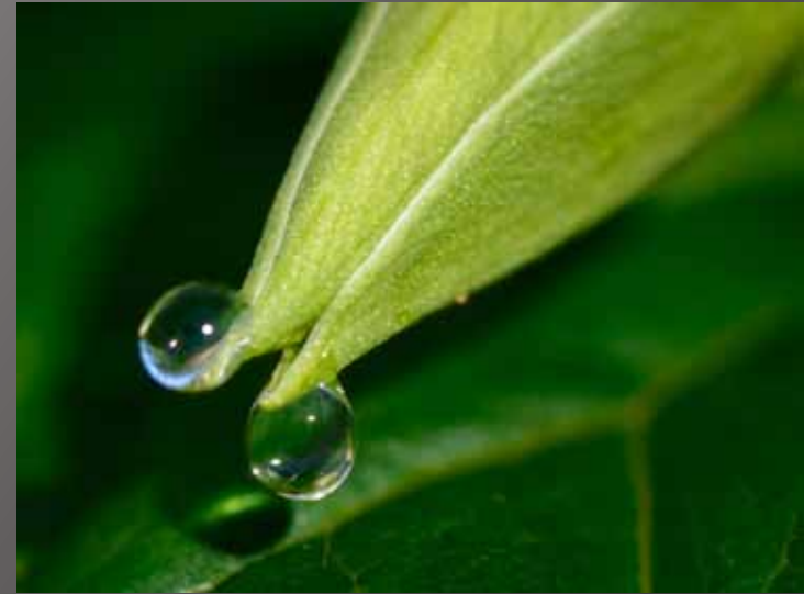
HM Place Chip Bulgin "Dewdrops?"