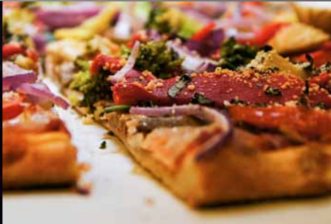
2nd Place Fred Venecia "Pizza Night"