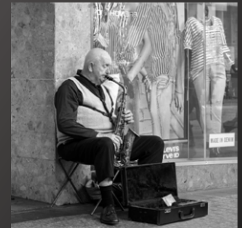
Example of Street Photography by Graham Williams