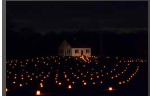
Example of Night Photography by Jackie Colestock

Street photography is photography that features the human condition within public places. Framing and timing can be key aspects of the craft with the aim of some street photography being to create images at a decisive or poignant moment. Street photography can focus on emotions displayed, thereby also recording people's history from an emotional point of view. Click here for examples of Street Photography .