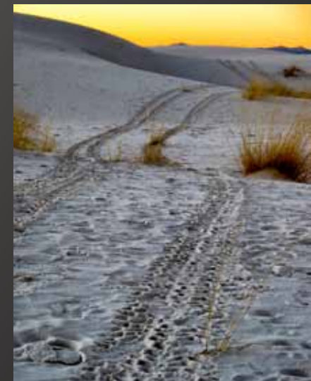
HM Dawn Grannas “Tracks to Nowhere”