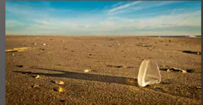
3rd Place Chip Bulgin "Monolith"