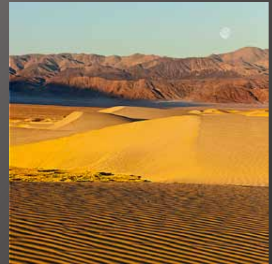
3rd - Chuck Gallegos "Mesquite Dunes moon Set"