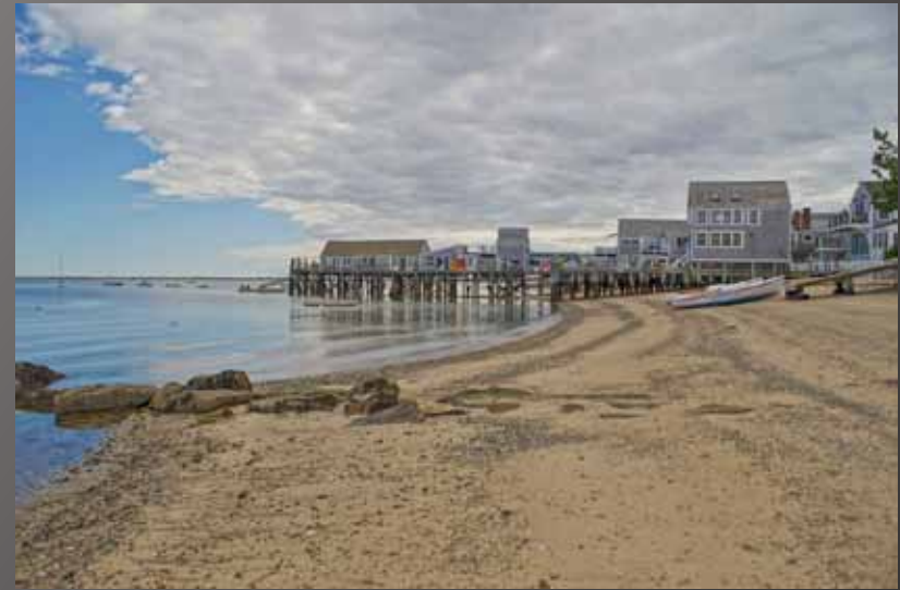
HM - Larry Crow "Provincetown Beach"