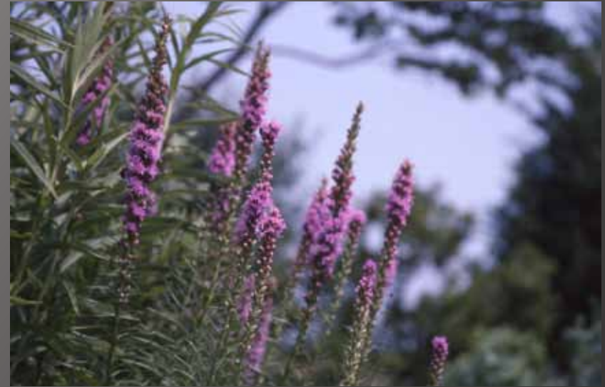
2nd - Christine Metzgar "Purple Diagonal"