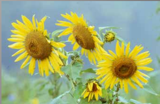
3rd - Chuck Gallegos "Foggy Sunrise"