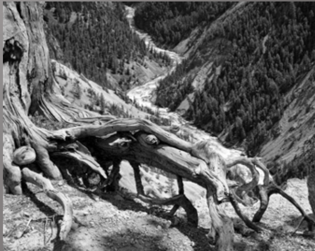
2nd - Vicki Pardoe A River Runs Through It