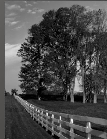
3rd - Jackie Colestock Autumn Day