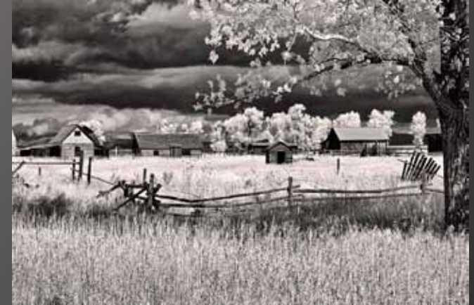
3rd - Chuck Gallegos Weathered Barns