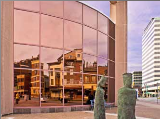
2nd Place Graham Williams “Looking at the Other Side of Town”