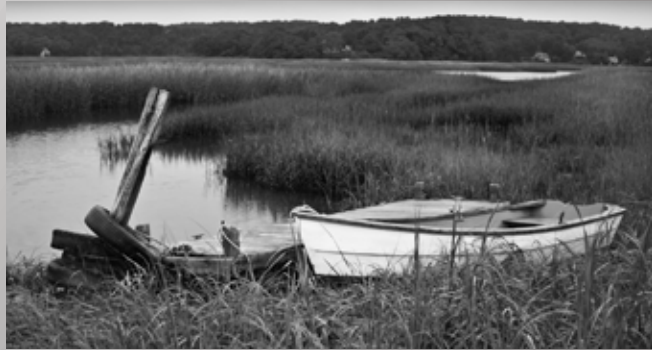
1st - Mike Worsham Great Island Cape Cod