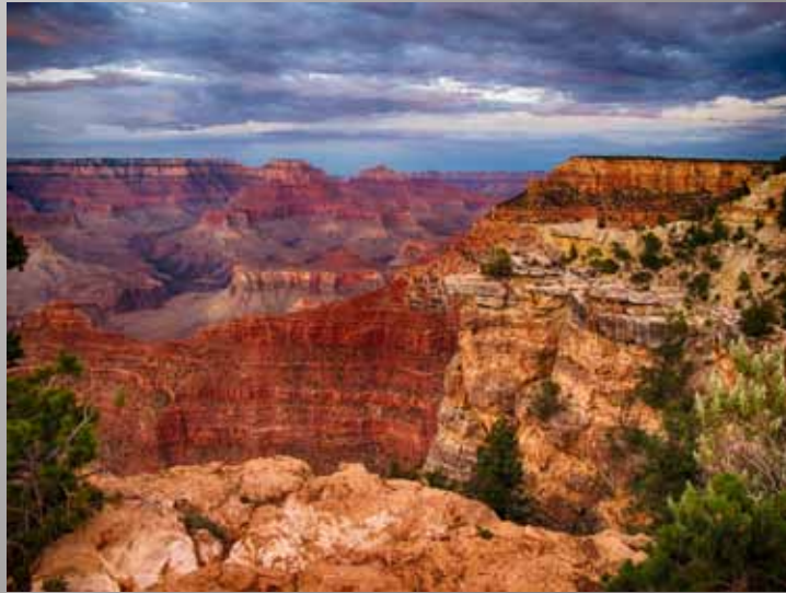
1st - Dawn Grannas "Grand Canyon"