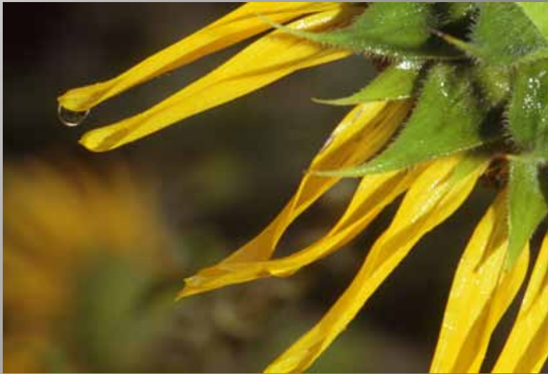
1st - Chuck Gallegos "Sundrop"