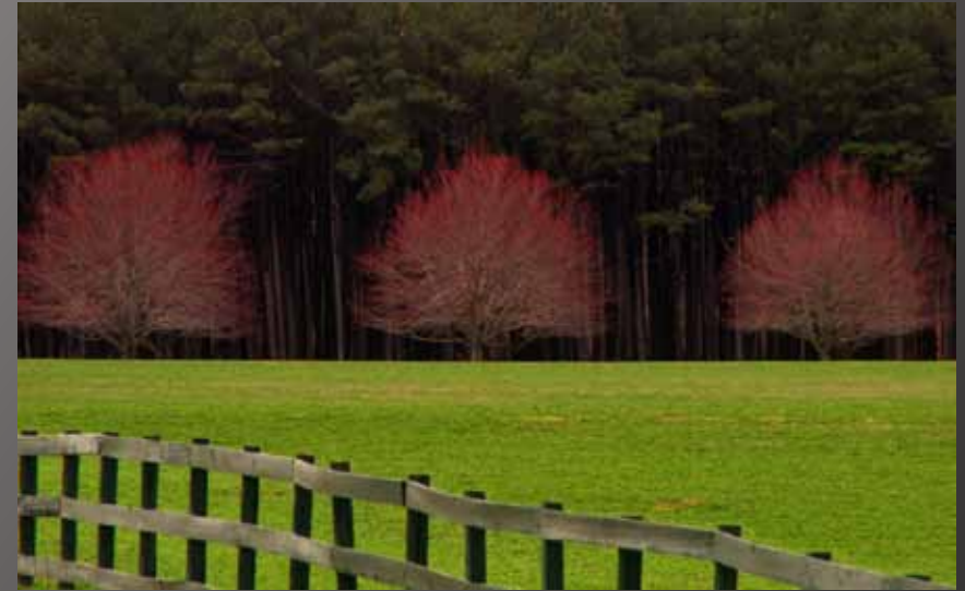
2nd - Anne Benintende "Forrest and Trees"