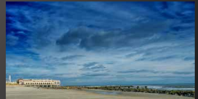
HM - Dick Chomitz "Cape May"