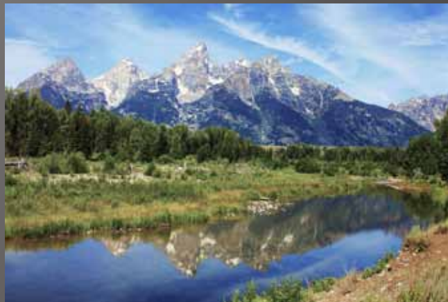
HM - Vicki Pardoe "Grand Tetons"