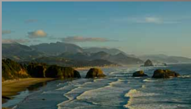
4th Place Paul Ekstrom “Cannon Beach”