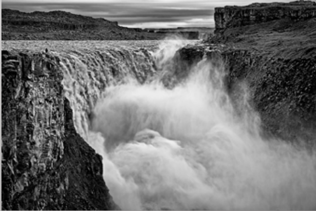
1st - Chuck Gallegos Dettifoss