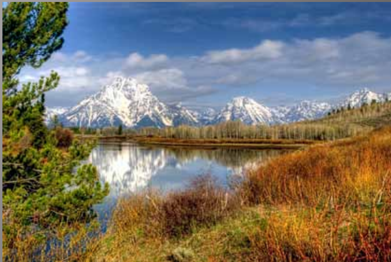
3rd - Reb Orrell "Grand Tetons"