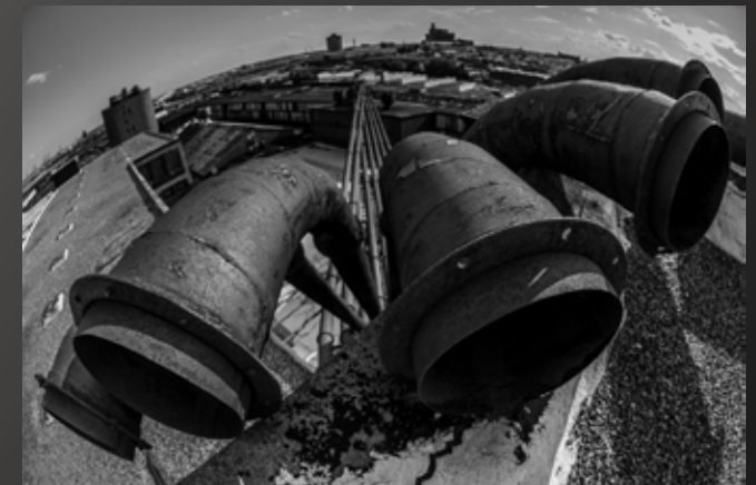
HM - Chip Bulgin City Pipes