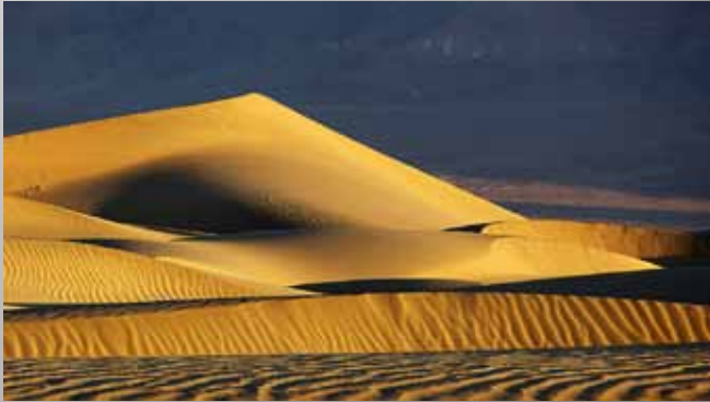
1st Place Chuck Gallegos "Sunrise Dunescape"