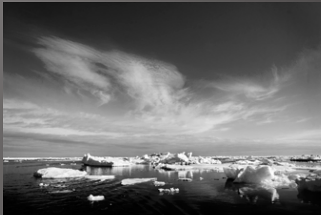
HM - Dawn Miller Arctic Spaces