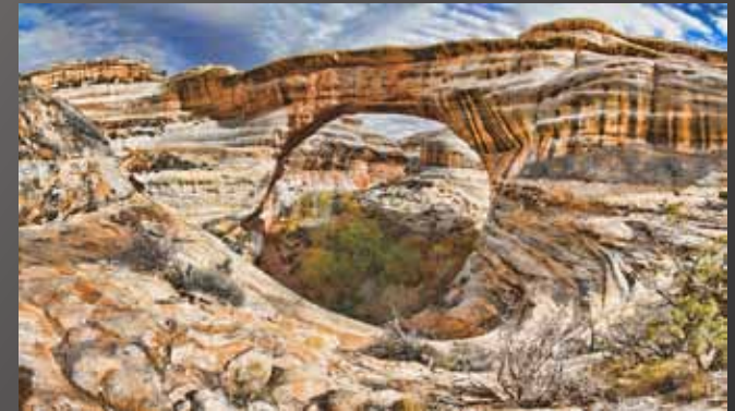
3rd Place Ron Peiffer “View through the Sipapu”