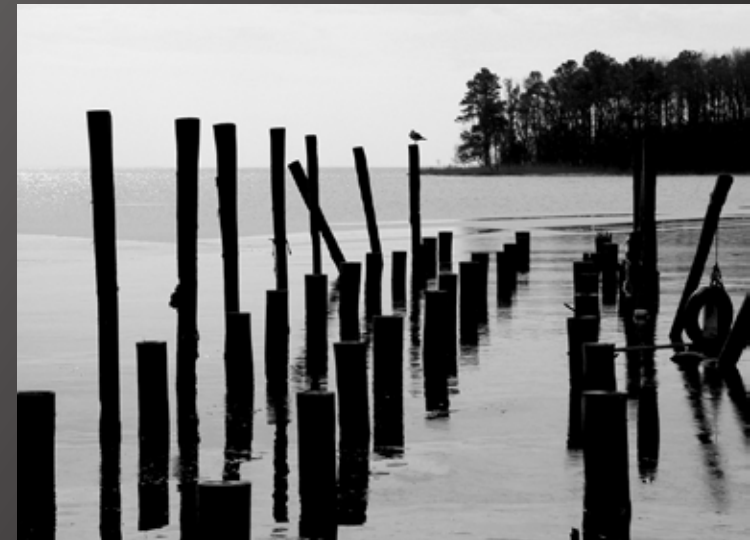
4th - Chuck Gorum "Lonesome Gull"