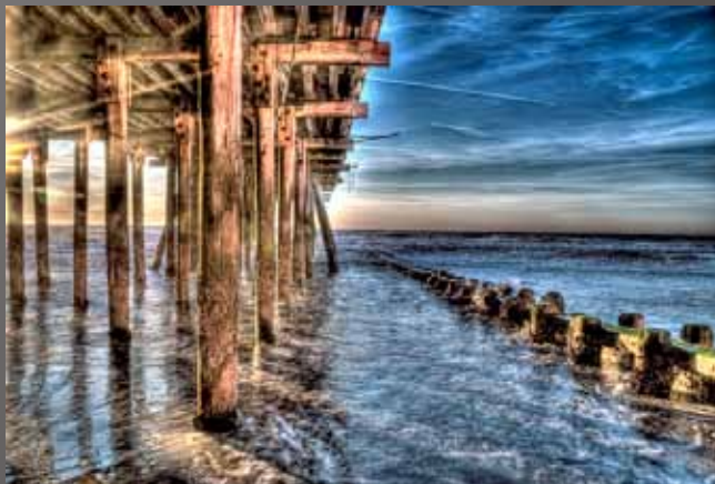
HM Reb Orrell “Boardwalk Sunrise”