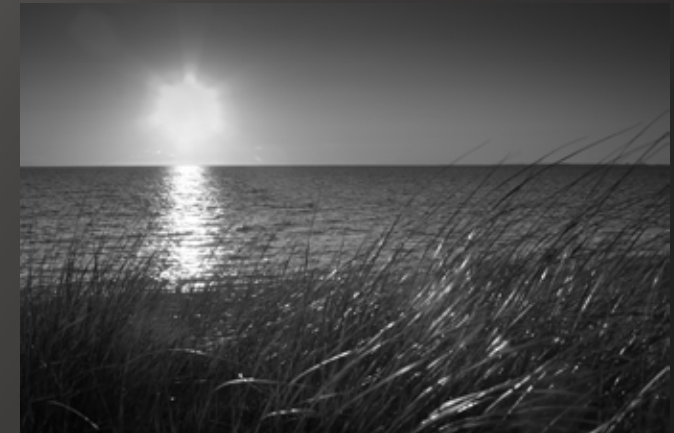
HM - Mike Worsham Sunset Grasses